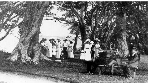
Takapuna library collection.