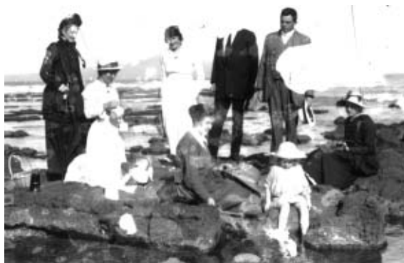
Picnic on the rocks, early 1900s.

At low tide the remnants of 500 tree stumps can be seen on the reef by the boat ramp. These tree moulds formed when fluid lava congealed around standing trees. Most of the lava then flowed away, leaving isolated stumps of basalt where the trees once stood. It is New Zealand's only example of a fossil forest.