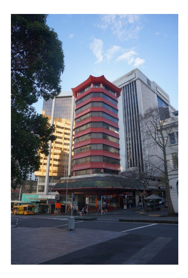
Figure 1. Choice Plaza.

Chinese participation within New Zealand society has been hampered by prejudice, poll taxes, immigration restrictions and other regulatory discrimination since 1860. It resulted in the attitude of cautious engagement and keeping a low profile. Such cautiousness and quietness are evident in the architecture and the use of architecture on Grey's Avenue. After they took over buildings that were designed and built to align with the dominant culture, they coded the Chinese presence on the street in a 'thin and quiet' manner. The Auckland Chinese scene encompasses the history of Grey's Avenue, the archaeological site at 44 Wakefield Street, Kong Foong Yuen, Choice Plaza, Dominion Road, and various businesses including supermarkets and restaurants (see Figures 1-2).