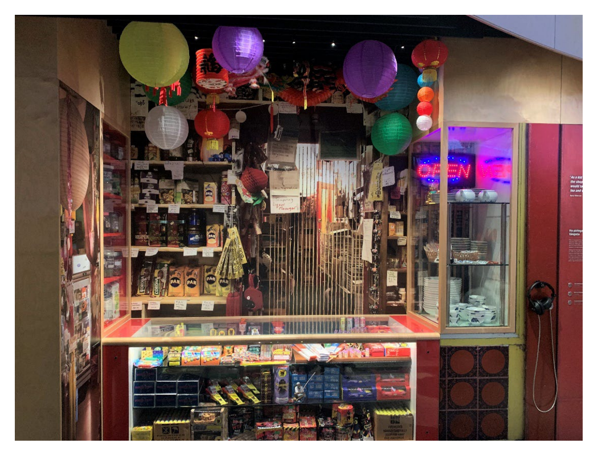
Figure 2. Model of Wah Lee's store at Auckland War Memorial Museum.

Chinese cultural heritage is a multicultural concept in the case study of Auckland. There are multiple representative samples in the variation and constant of different heritage themes. Essentially, Chinese cultural heritage is a meaning-oriented concept that varies by individual rather than being a scientific term. The primary meanings of Chinese cultural heritage can be divided into three aspects: 'being Chinese', 'cultural inheritance', and 'relationship with Māori communities'. The very concern is their cultural identity – who they are: who they are in the past, present, and future; who they are in their minds and the local context. Through the dual lenses of time and space, participants were concerned with Chinese cultural heritage in three relations: homeland and home, us and them, authenticity and re-creation (see Table 2). These three relations uncover the conception of Chinese cultural heritage in the spatial dimension as a sense of place attachment, in the emotional dimension as nostalgia, and in the temporal dimension as a continuous cultural process.