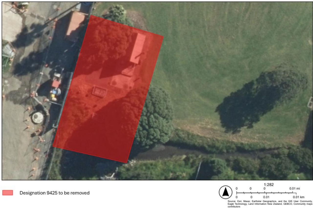
Figure 1 – Proposed Designation Removal