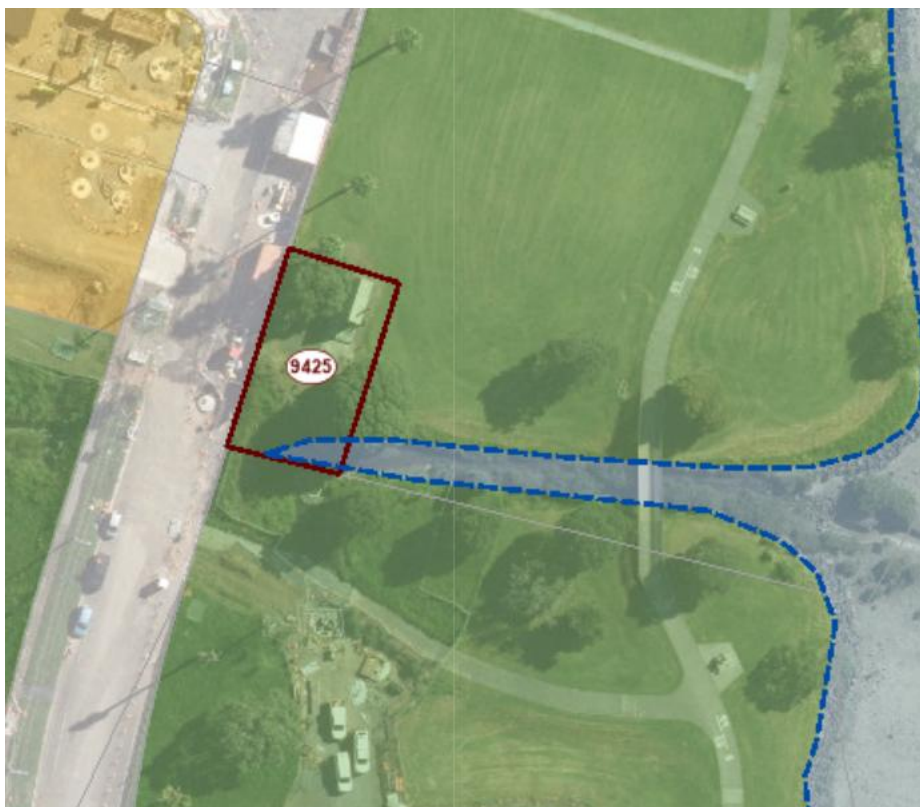
Figure 1: Designation 9425 at 192A Riverside Avenue (Riverside Reserve), Point England

Watercare Services Limited has provided a site plan showing the extent of the designation which is to be removed (refer to Attachment A ).