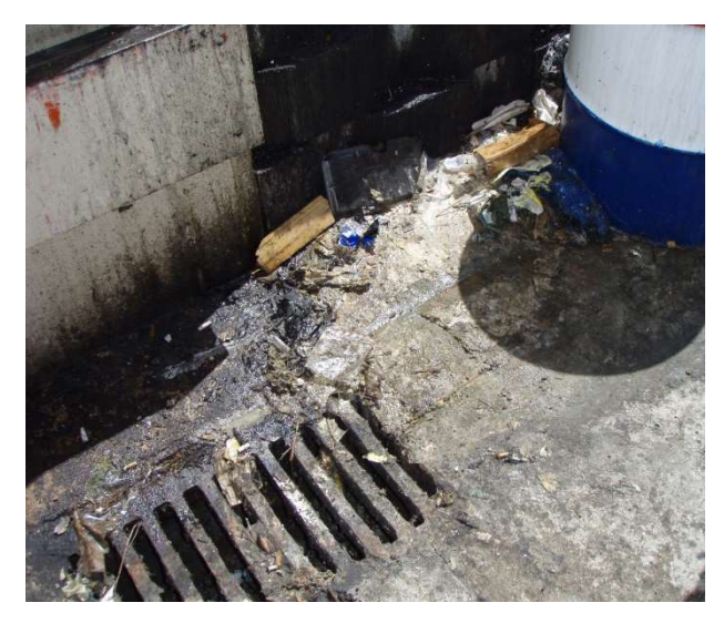
Make sure food waste, grease and fats \underline{\text{do not}}\, go \text{ down drains}

The disposal of food waste, fats and grease needs to be carefully managed to prevent pollution to the environment.