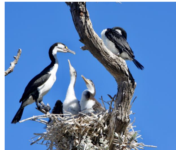
Kawau / Shag nest, Jude Hynes

With a pest free island , there would be no need for the continued use of toxins to control pests.