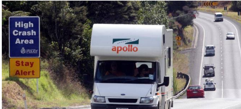
Figure 1: The Dome Valley is demonstrably "one of New Zealand's deadliest roads" with 17 fatalities and 42 serious injuries recorded between 2005 and 2016.. The proposed huge increase in heavy traffic is untenable.

Added to this would be the increased heavy traffic damage to road surfaces, increased noise and vibration for residents near the highway, and the inevitable road-surface pollution long evident at Redvale/Coatesville from dirty truck tires and content seepage from their cargo.