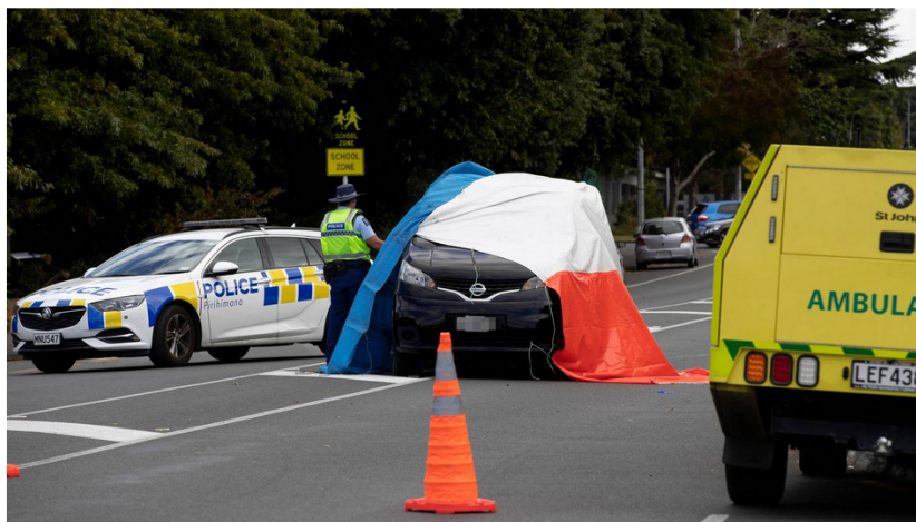
A van collided with a cyclist on Manukau Rd in Royal Oak in Auckland this afternoon.