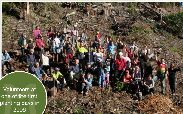
Volunteers at one of the first planting days in 2006

Between 2004-2007, in partnership with Auckland City Council and the Hauraki Gulf Conservation Trust, and with the assistance of community grants, FOMR raised the money to remove the pine trees.