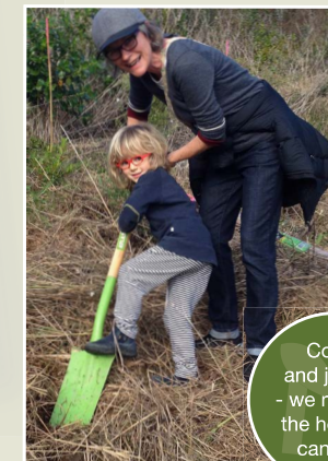
Come and join us - we need all the help we can get!

FOMR consists of a small committee working closely with the Auckland Council. FOMR has around 200 volunteers and supporters on their database and also on Facebook, The Friends of McKenzie Reserve (@TFOMR). Regular monthly working bees are held from March to November and opportunities for corporates to volunteer and work in the Reserve are possible, as are school volunteer schemes and Duke of Edinburgh volunteer hours.