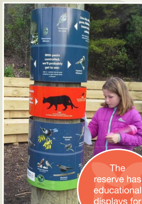
The reserve has educational displays for all ages

Enclosure Bay and one to Sandy Bay. One of the tracks forms part of the Te Ara Hura 100km walk around Waiheke Island.