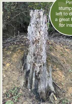
Pine stumps are left to decay - a great habitat for insects

More than 15,000 eco-sourced native trees have been planted. An extensive network of tracks connects to a lookout over the Hauraki Gulf, an education/information hub and surrounding roads (Empire Avenue, Coromandel and Great Barrier Roads) including one that leads to