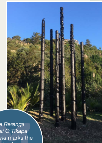
Te Rerenga Wai O Tikapa Moana marks the Empire Avenue entrance to the reserve

"These waterways were highways for trade and warring parties. That's what I was honouring - the Tikapa Moana, and it is really important to me that it is staying where it was created."