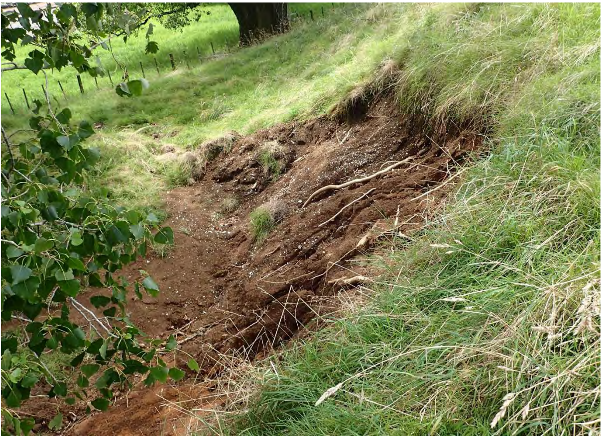
Fig. 5. Slip 9 is the only that has occurred near any tree, with some roots exposed by the slipping, which has started above and beyond the tree.