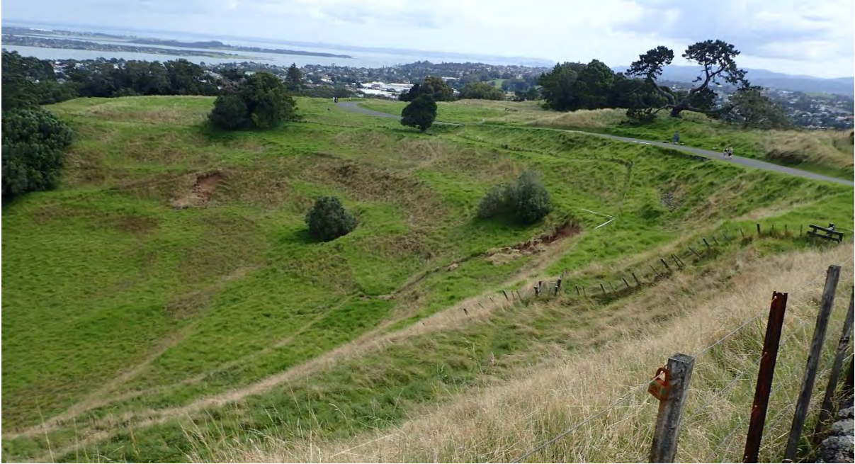
Fig. 4. The two small slips (14-15) in archery breached crater.