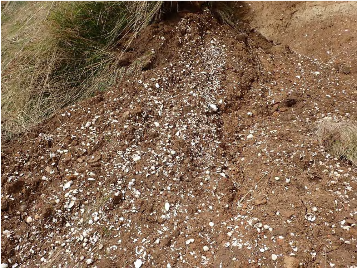
Fig. 8. Shell midden has been exposed and come down in most of the slips. Here in slip 1.