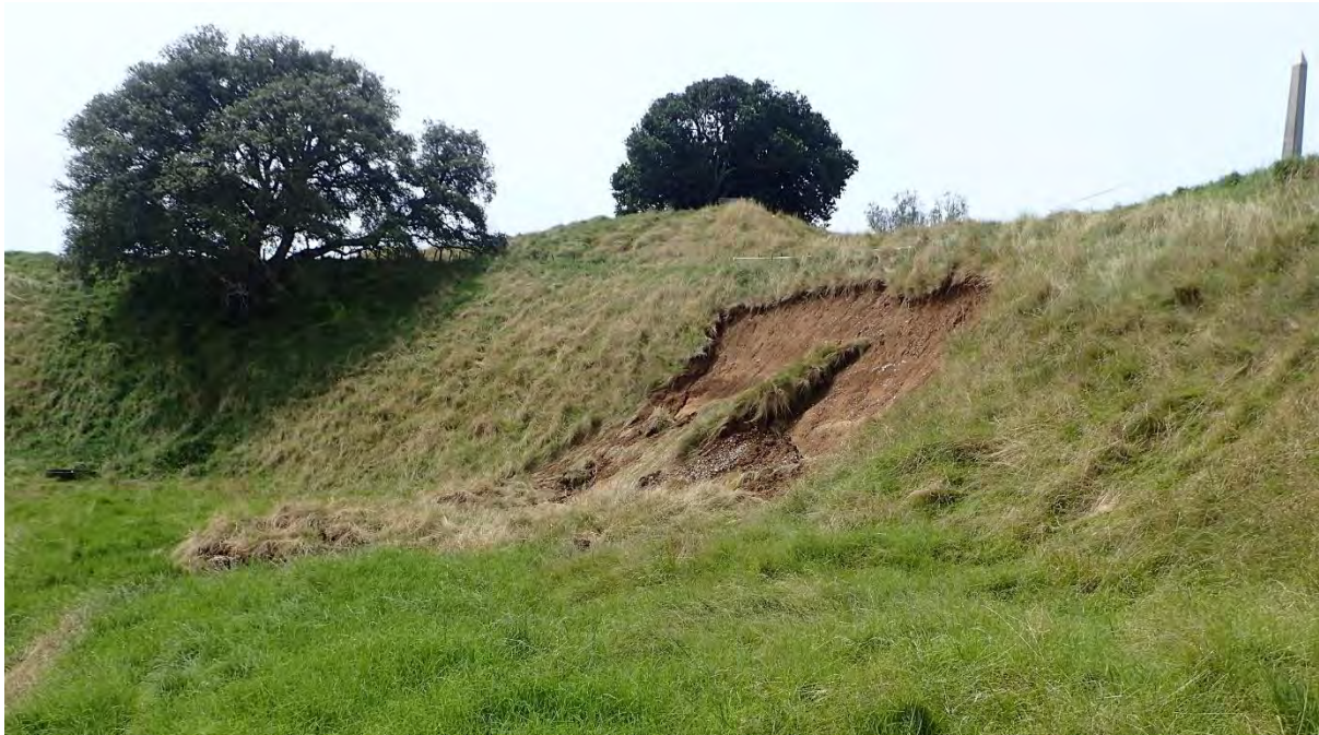
Fig. 6. Slip 1, in the southwest crater wall is an example of the kind of slips that have occurred on Maungakiekie, with failure of the rise between two terraces and only the upper 0.5-1 m of regolith failing and flowing down the slope with its toe extending across the lower terrace.