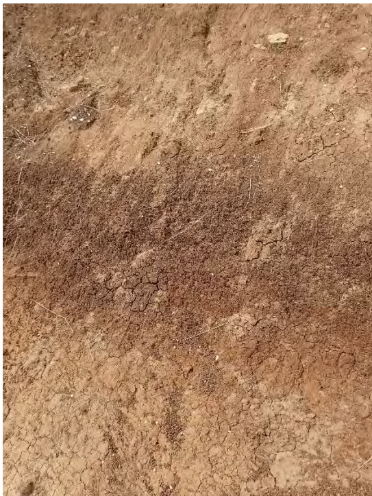
Fig. 9. Close up view of the upper scarp of slip 1 showing weathered fine tuff at the base overlain by darker red-brown soil in the middle overlain by terrace fill containing lumps of tuff dug out from the back of the terrace above by pre-European Maori.