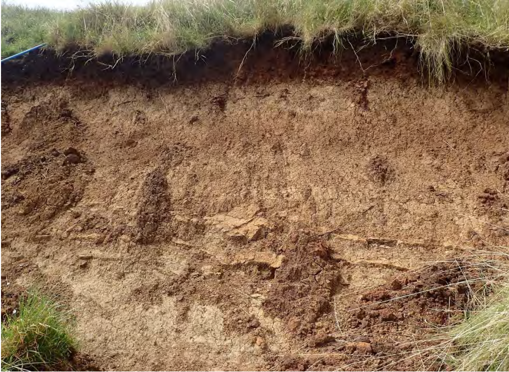
Fig. 10. Stratigraphy exposed in slip 2 with obvious beds of harder coarse tuff within finer tuff (all erupted from Three Kings Volcano) in the lower part of the scarp. This is overlain by a darker red-brown soil and at the top the lighter terrace fill.