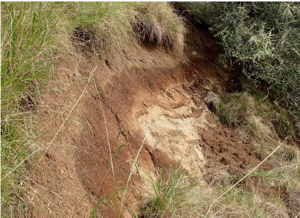
Fig. 11. Slip 7, on the western slopes, has exposed the freshest bedded Three Kings tuff (lower right) overlain by red-brown soil and then lighter brown terrace fill.