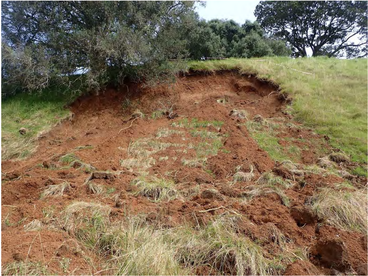
Fig. 12. Looking up slip 12 which is a slope failure on the riser between two terraces.