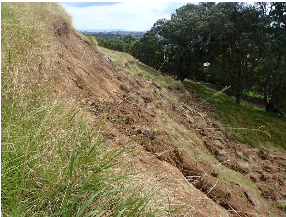
Fig. 7. Slip 6 shows the over steepened nature of the slope that failed and the shallow depth of regolith that has flowed down slope like a carpet of grass and topsoil developed in the terrace fill.