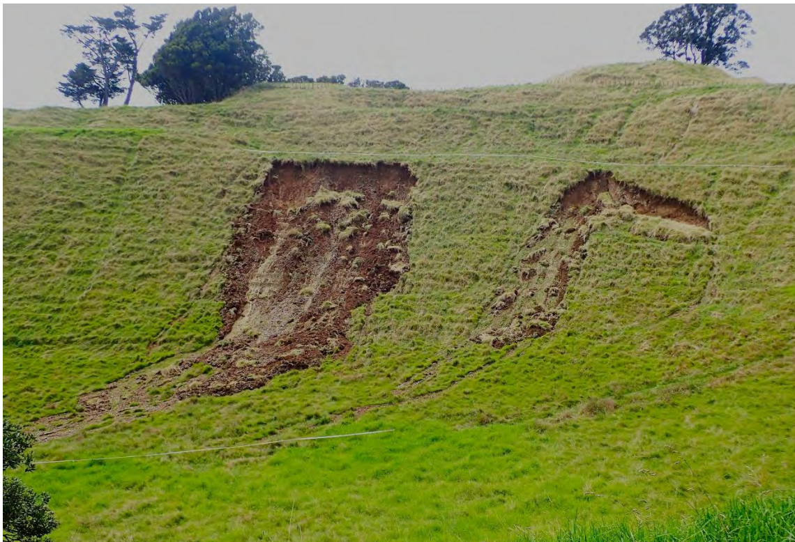
Fig. 3. The two largest slips (3-5) in the southwestern breached crater. Note how slip 3 (right) has started slipping at the top, just below the edge of the terrace above.