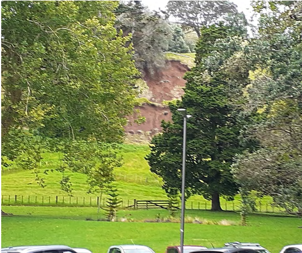
Fig. 2. Slips 12 and 13 on the northern slopes, close to the Cornwall Park kiosk.