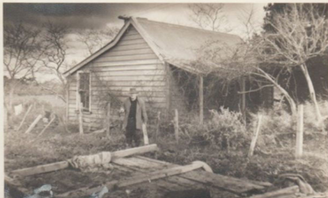
Bayview Auckland 0629