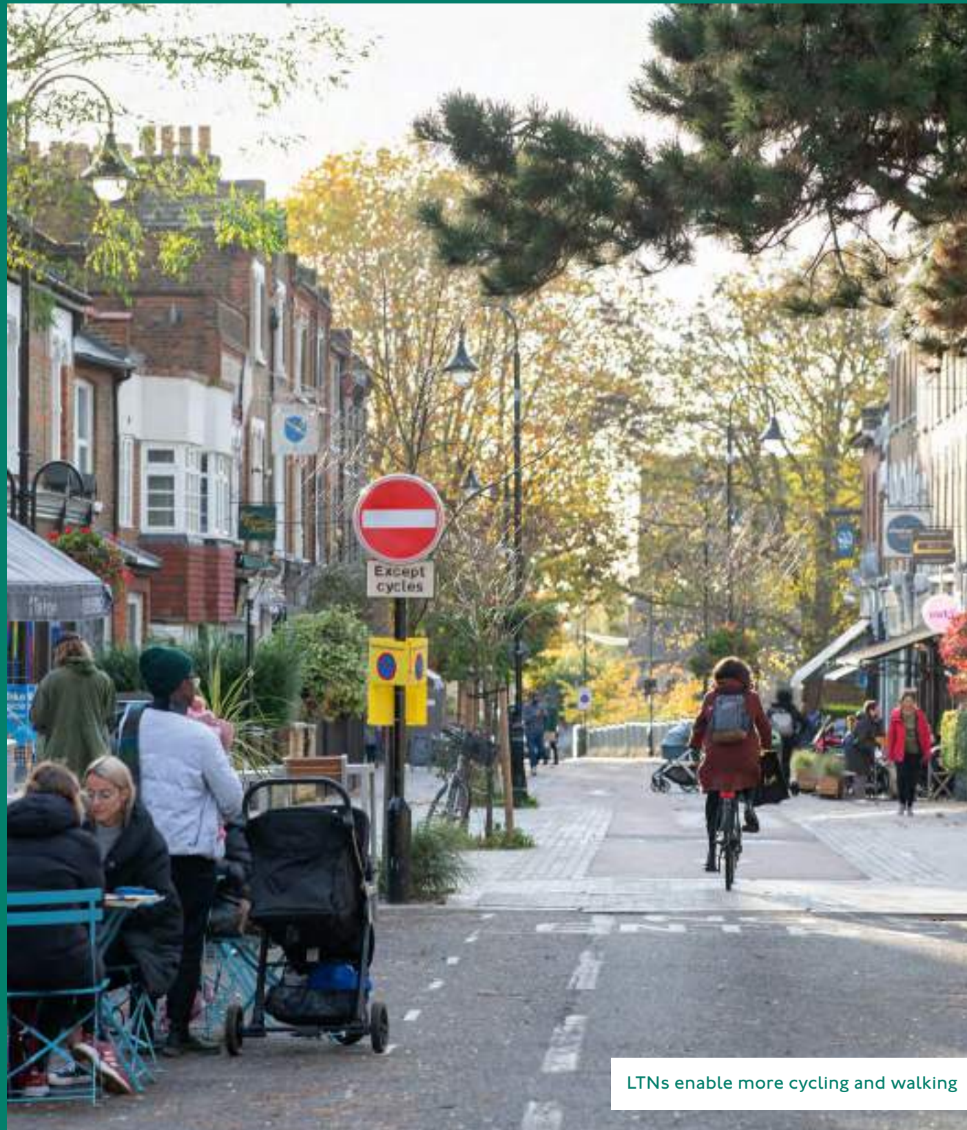
LTNs enable more cycling and walking