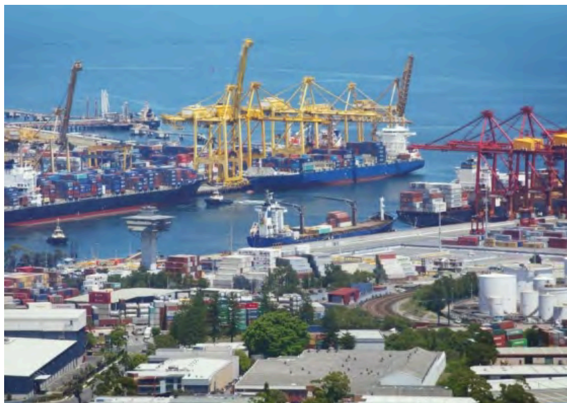
Government-driven port reform has failed to improve container port productivity measured by 'crane rates'.

In fact, the MUA has suggested regulators be given powers to investigate and gather evidence on the cartel behaviour of international shipping lines and share intelligence on shipping line cartel or anti-trust behaviour with regulators in the US, Canada, New Zealand and Britain.