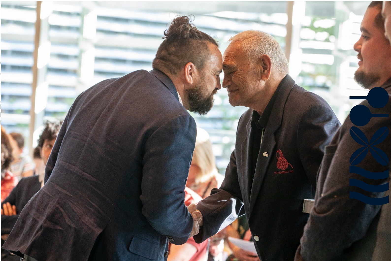
Henderson-Massey Local Board Inaugural Ceremony 2022