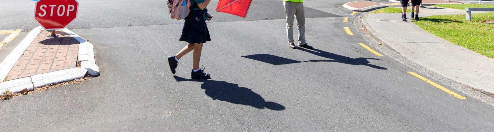
School children crossing the road safely in Te Atatu