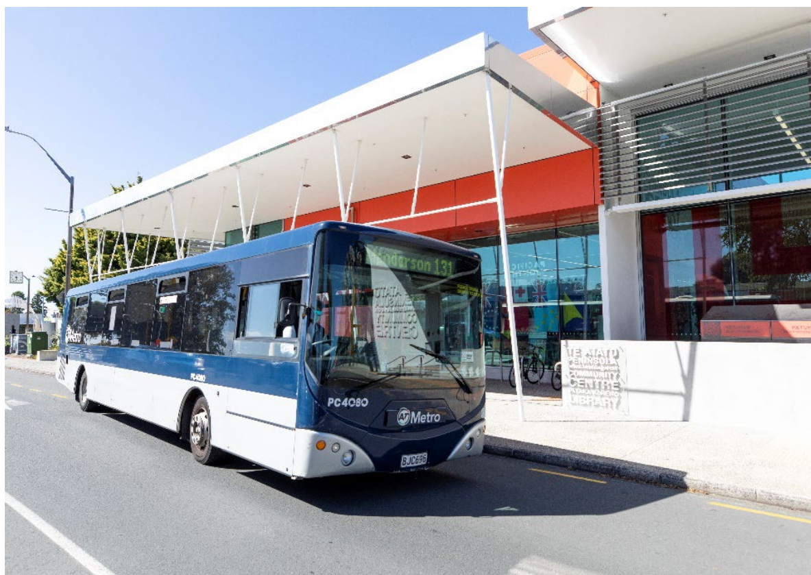
A bus waits in Te Atatu Peninsula Town Centre

An increased focus on delivering economic outcomes for rangatahi Māori and Pacific youth.