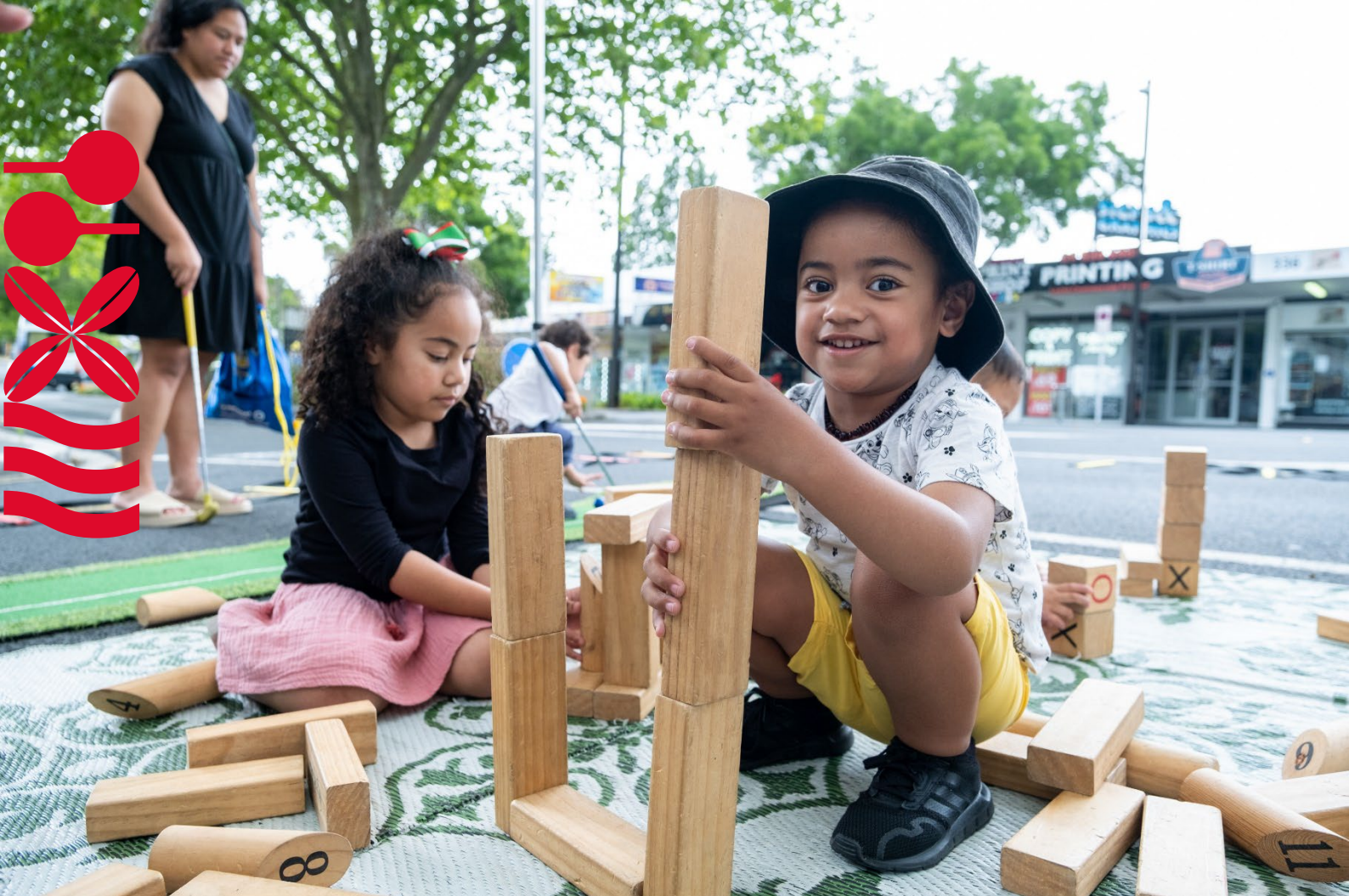
Henderson Christmas Festival