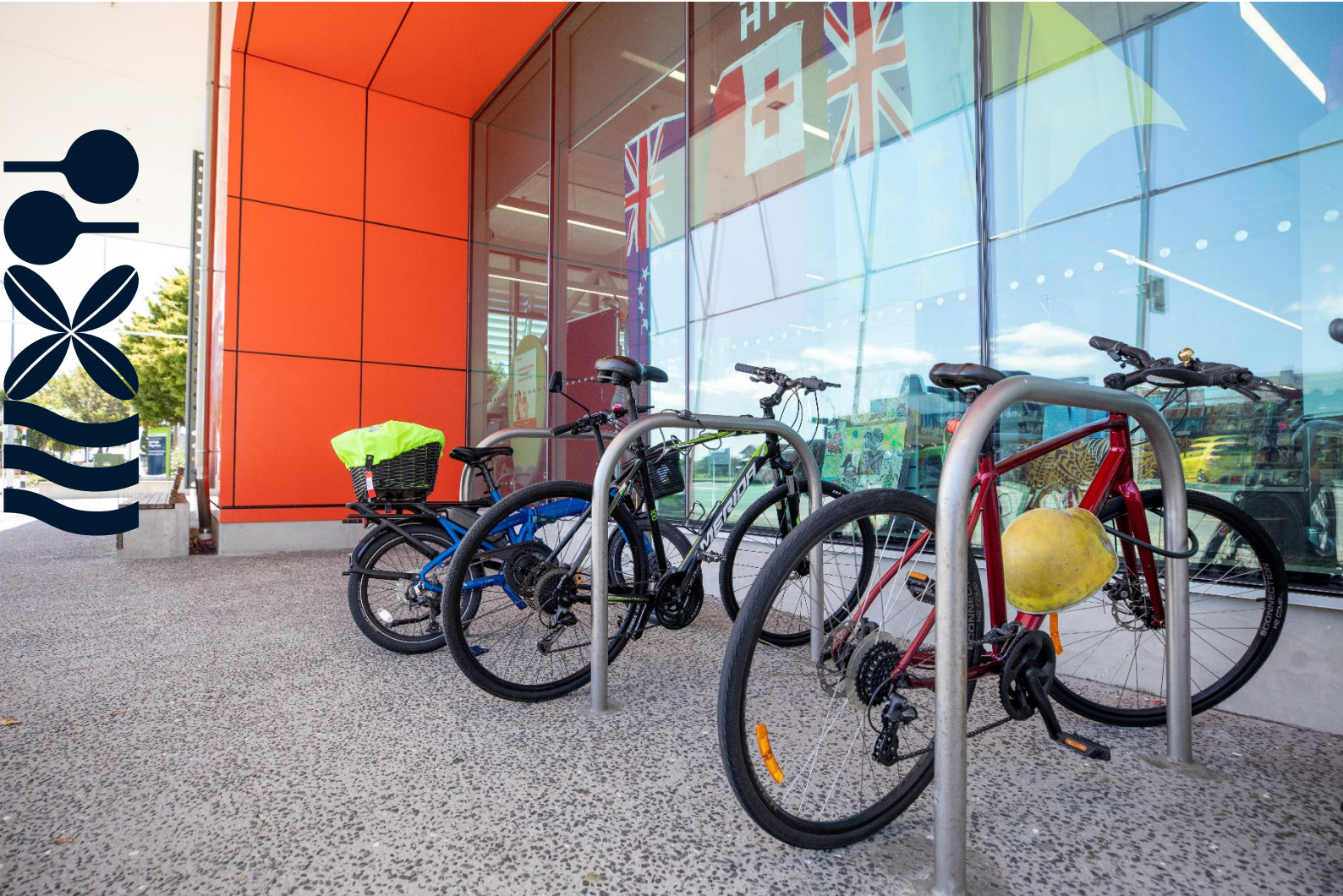
Bike racks installed at the Te Atatu Peninsula Community centre