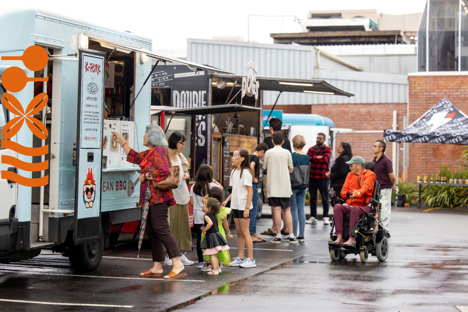
Food Trucks in Te Atatū South