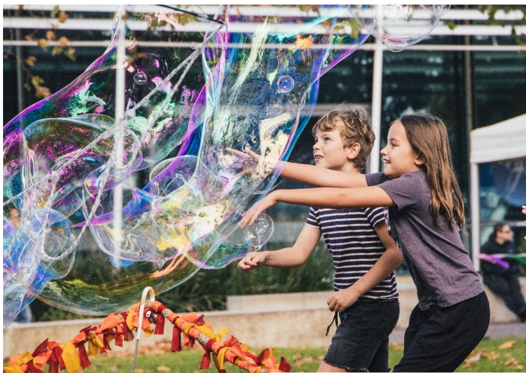
Jack Pringle Park opening in Te Atatū Peninsula