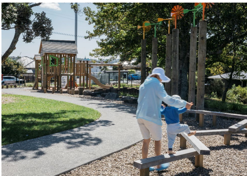
Windy Ridge Reserve playground