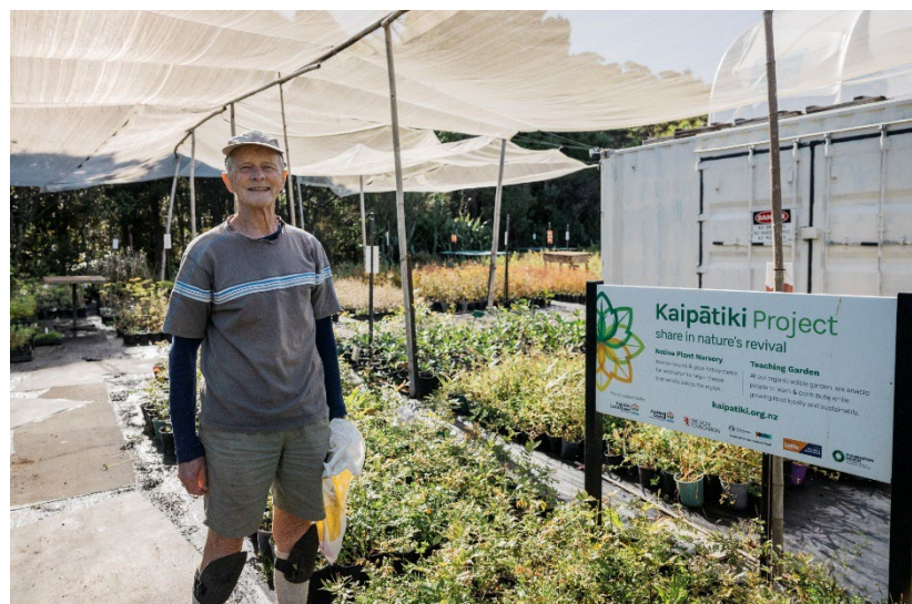
Kaipātiki Project Volunteer