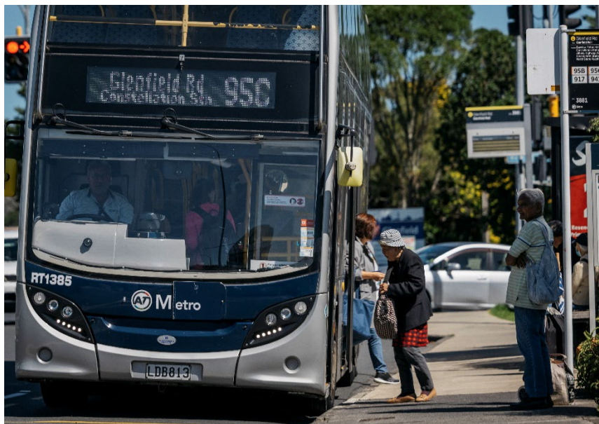
Double decker bus, Glenfield Town Centre