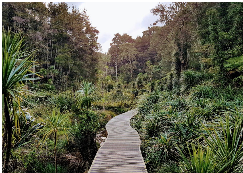
Wai manawa / Le Roys Bush, Birkenhead