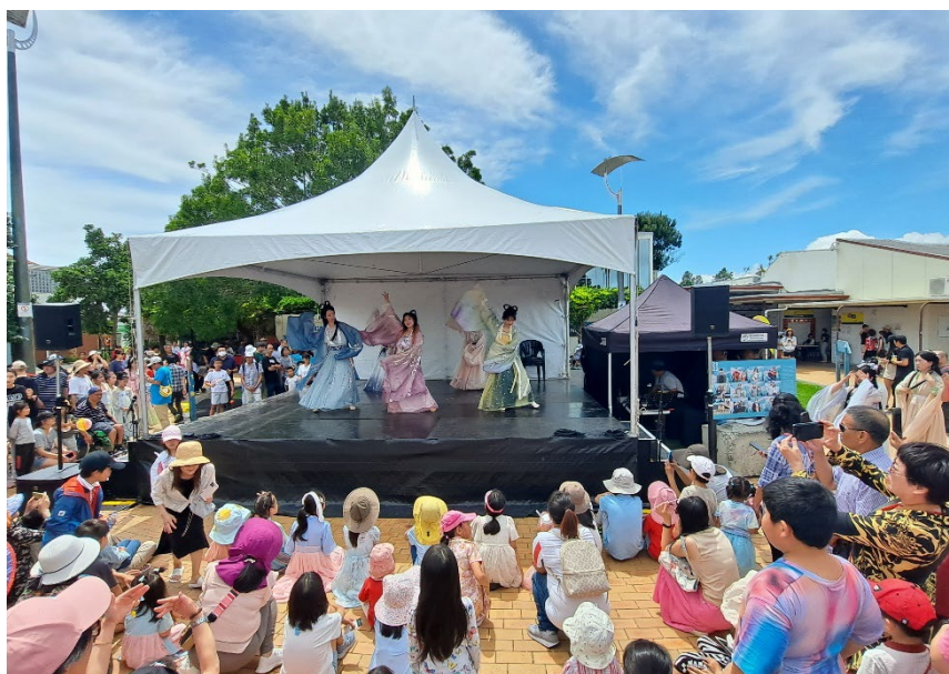
Chinese / Korean New Year event, Northcote Town Centre