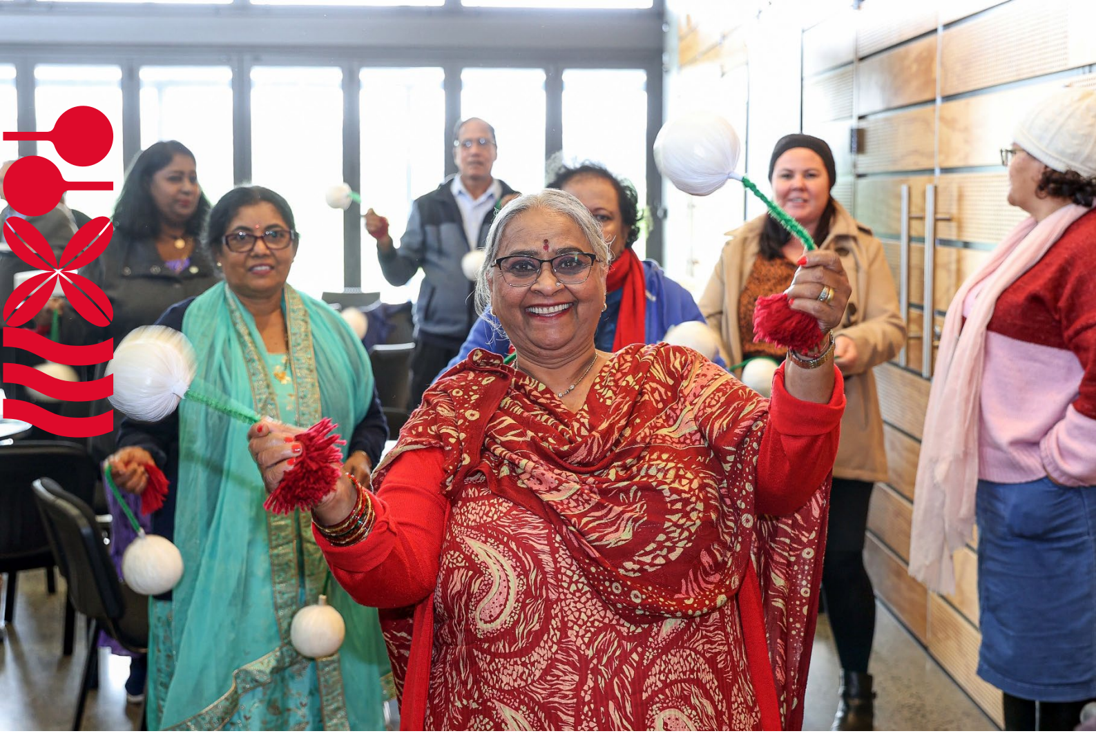
Seniors Network at Manu Tukutuku, Randwick Park