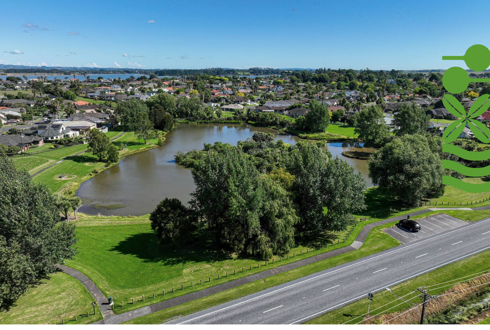
Wattle Downs ponds