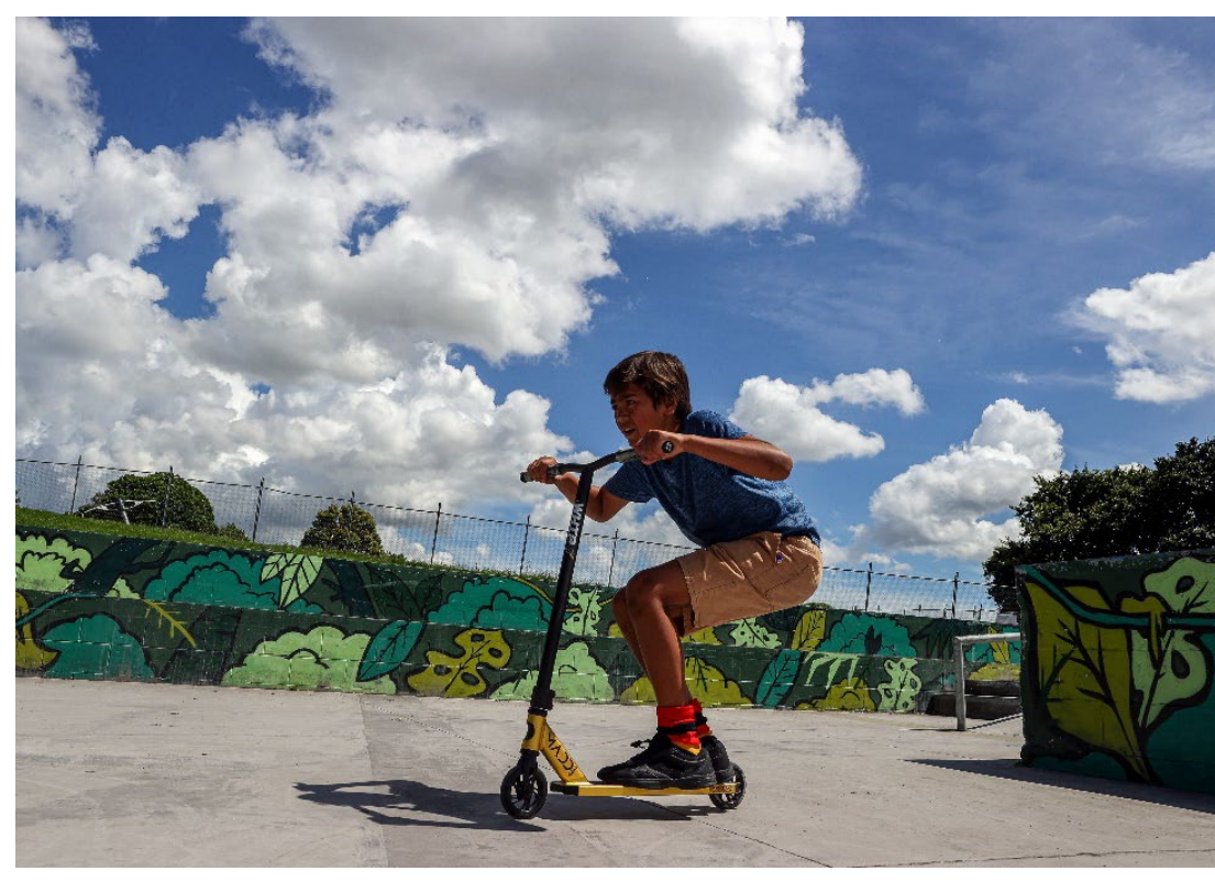
Clendon skate park