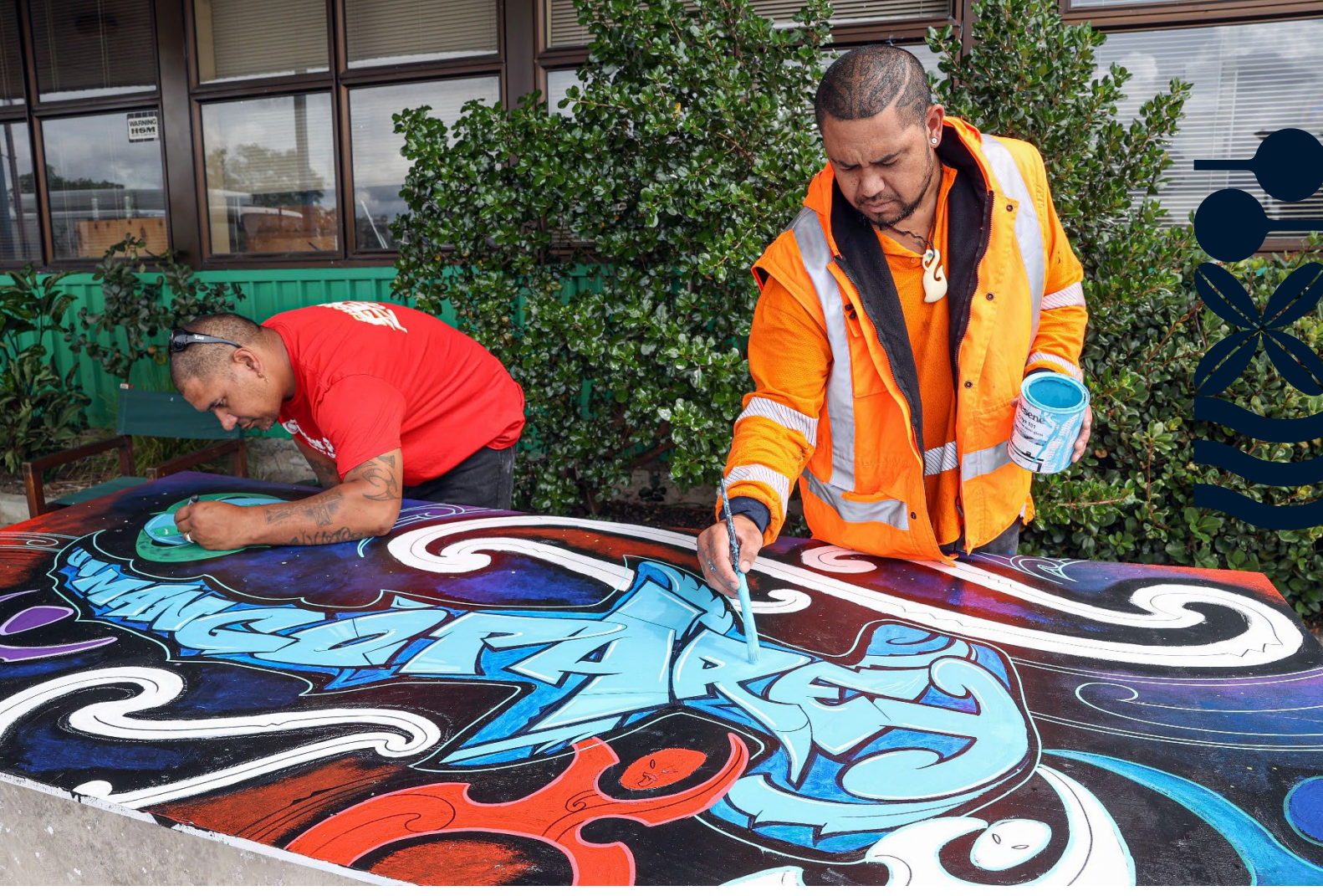
Beautification Trust, Manurewa