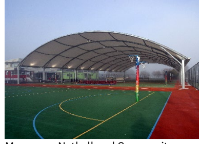
Manurewa Netball and Community Centre

Our environment is protected, restored and enhanced. We care for our natural treasures, restored waterways and flourishing urban forest. We're reducing our carbon footprint, greenhouse gas emissions and waste, and building community resilience to climate change effects.