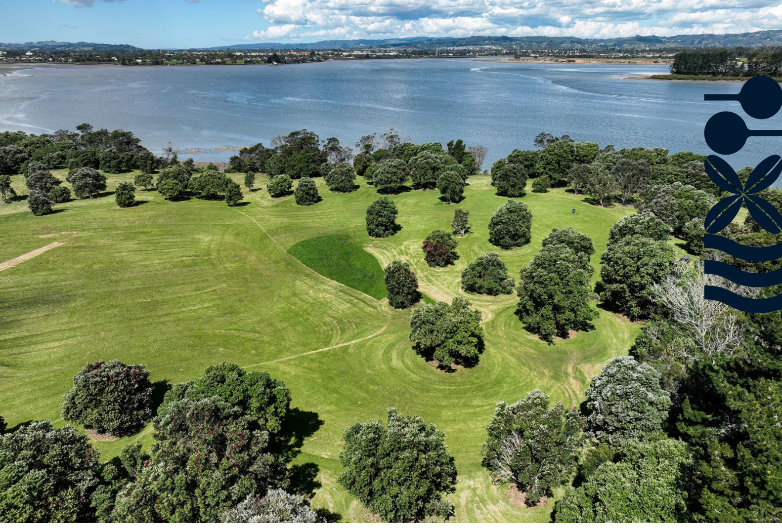
Manukau Harbour from Manurewa