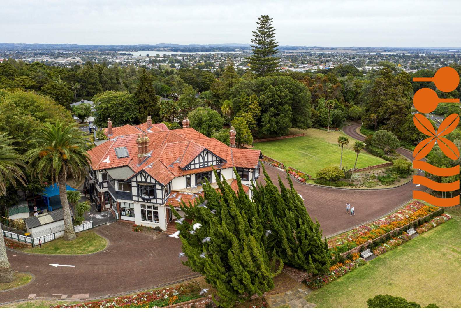
Pukepuke / Nathan Homestead