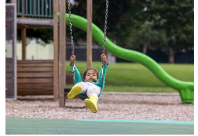
Gallaher Park, Manurewa

Our communities enjoy responsive services and facilities that enable great participation. Our facilities and public places are popular gathering points that adapt well to changing community needs. They offer choices for people from different backgrounds and life-stages to take part in sports, recreation, creativity and play.