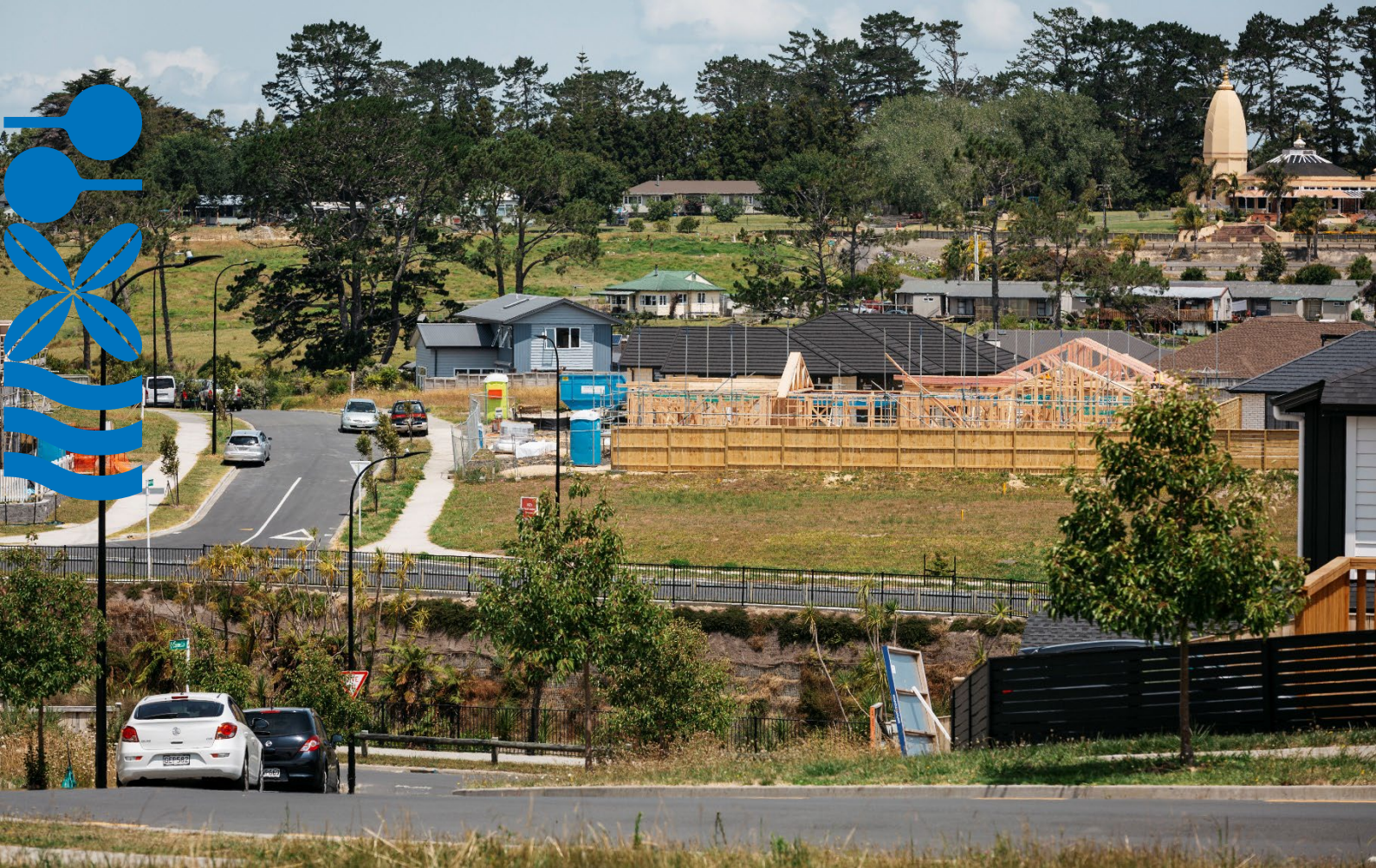
New housing subdivision in Riverhead