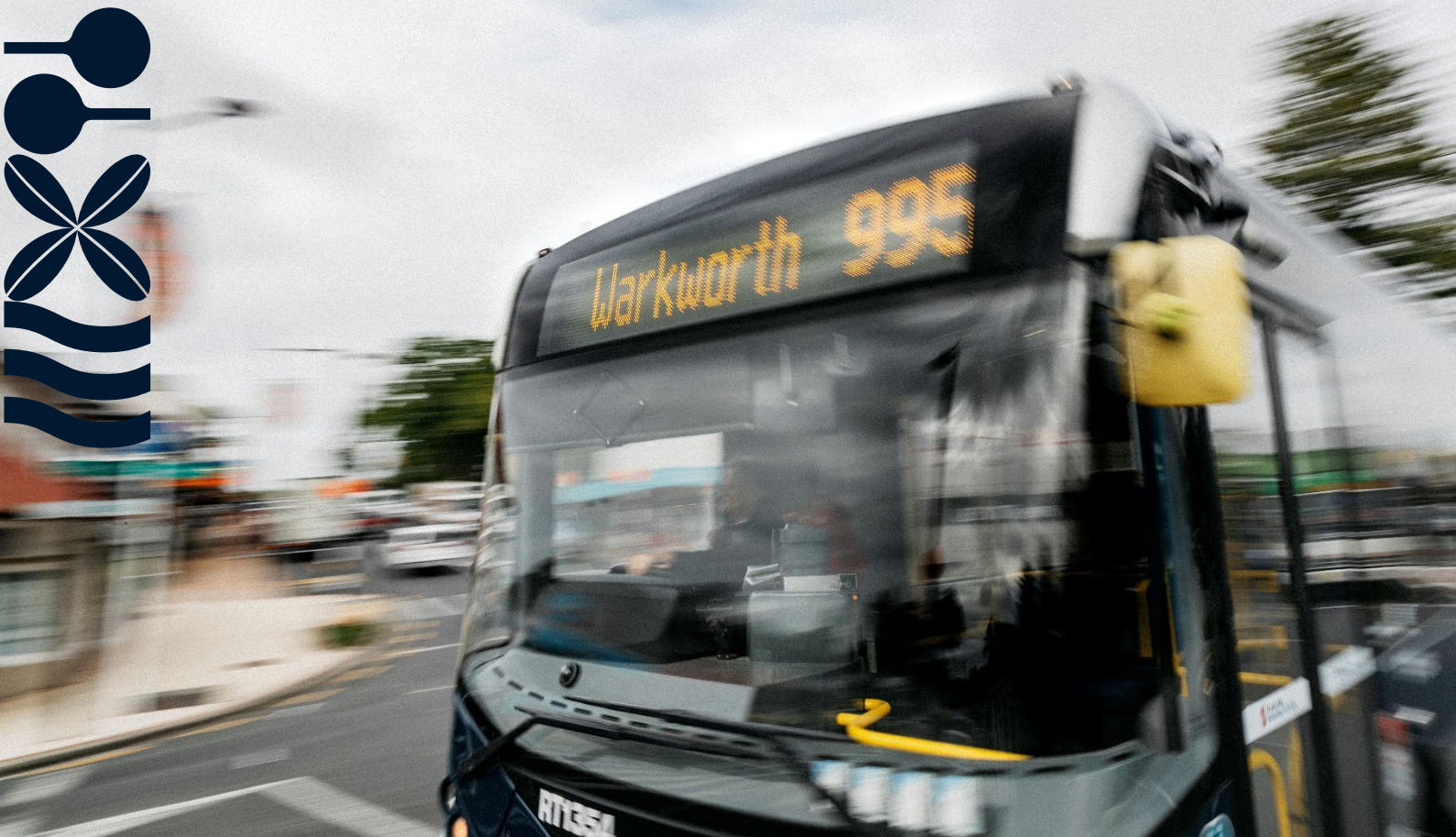
The Wellsford to Warkworth 998 bus