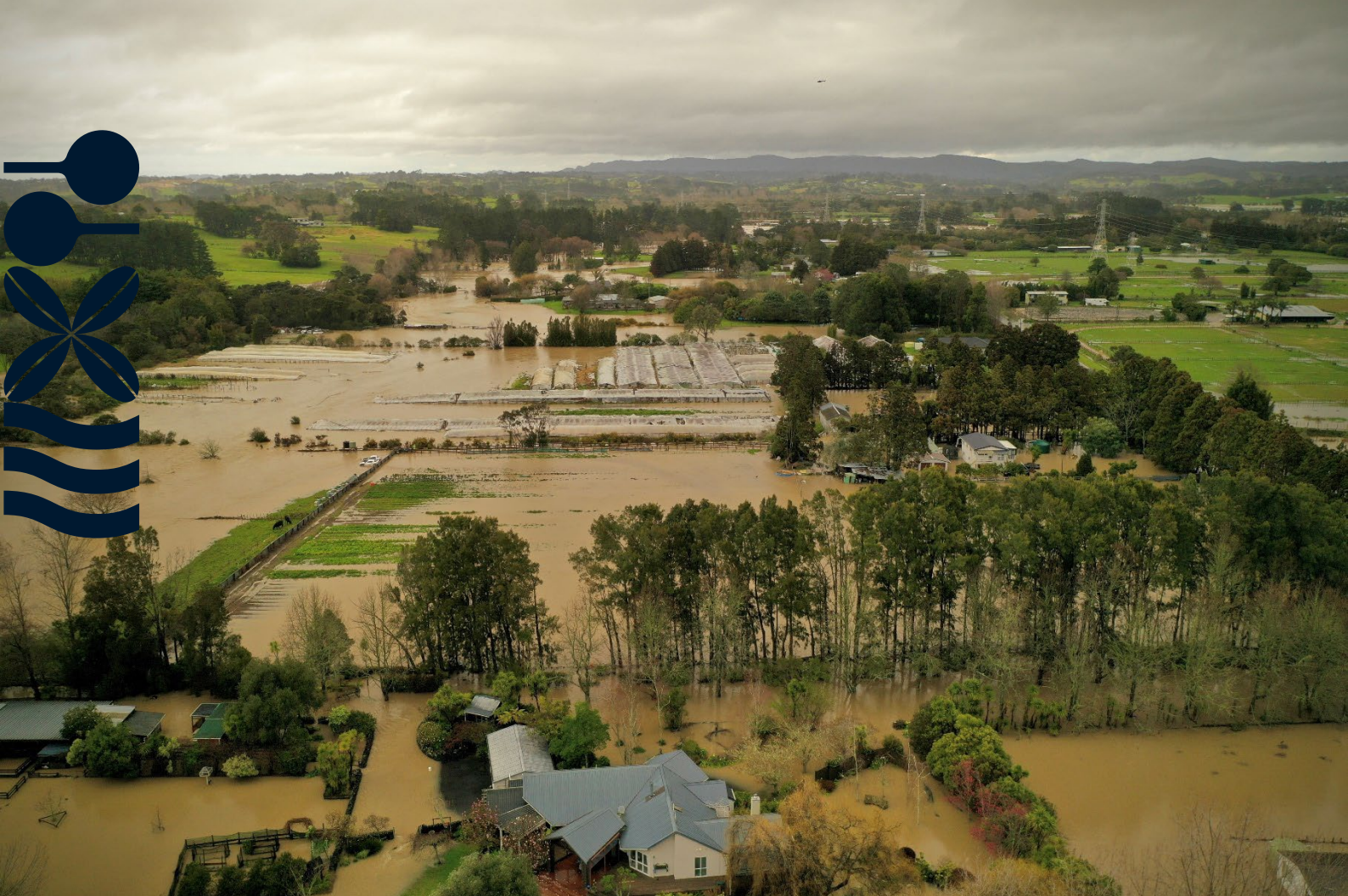
Flooding in Kumeū Huapai.