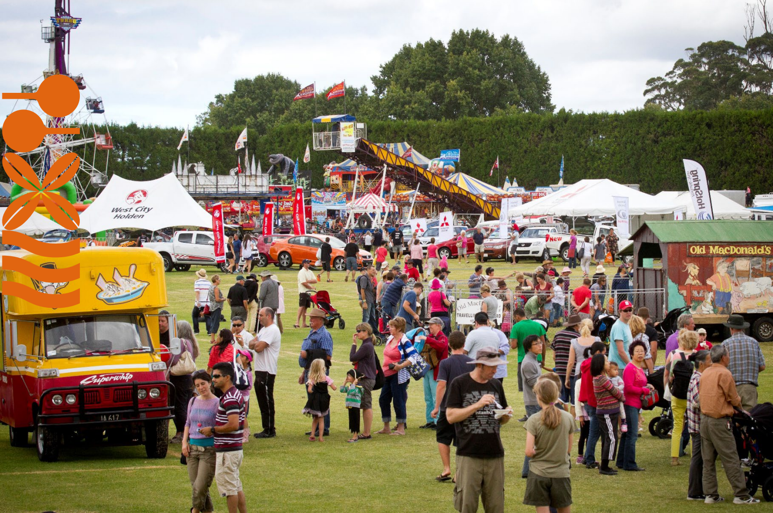
The Kumeu Show