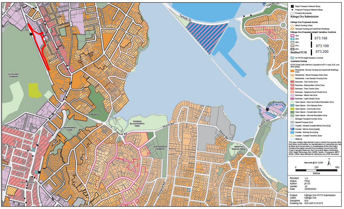
Figure 1: Kāinga Ora proposed rezoning - Map 72 - showing 23 Cheshire Street outlined in red