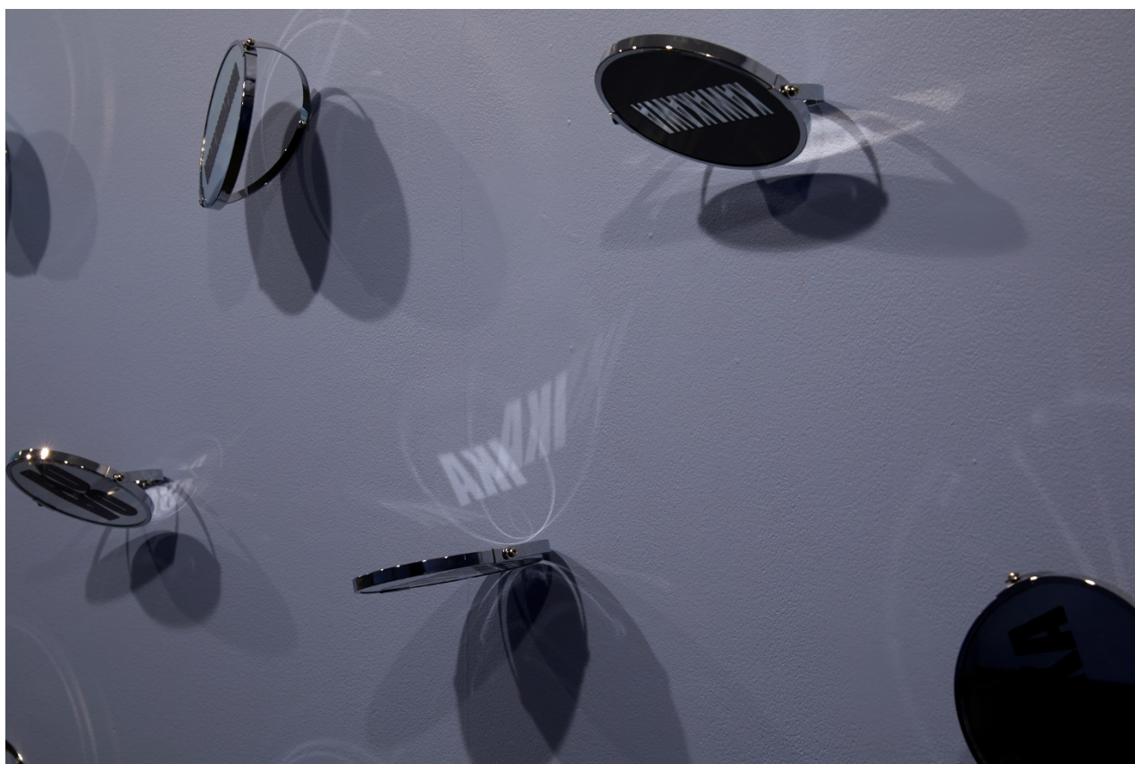
Charlotte Graham. Whakawaikawa Moana/Acidic Oceans , 2017–19 (detail). Wall-based mirror units and text installation.