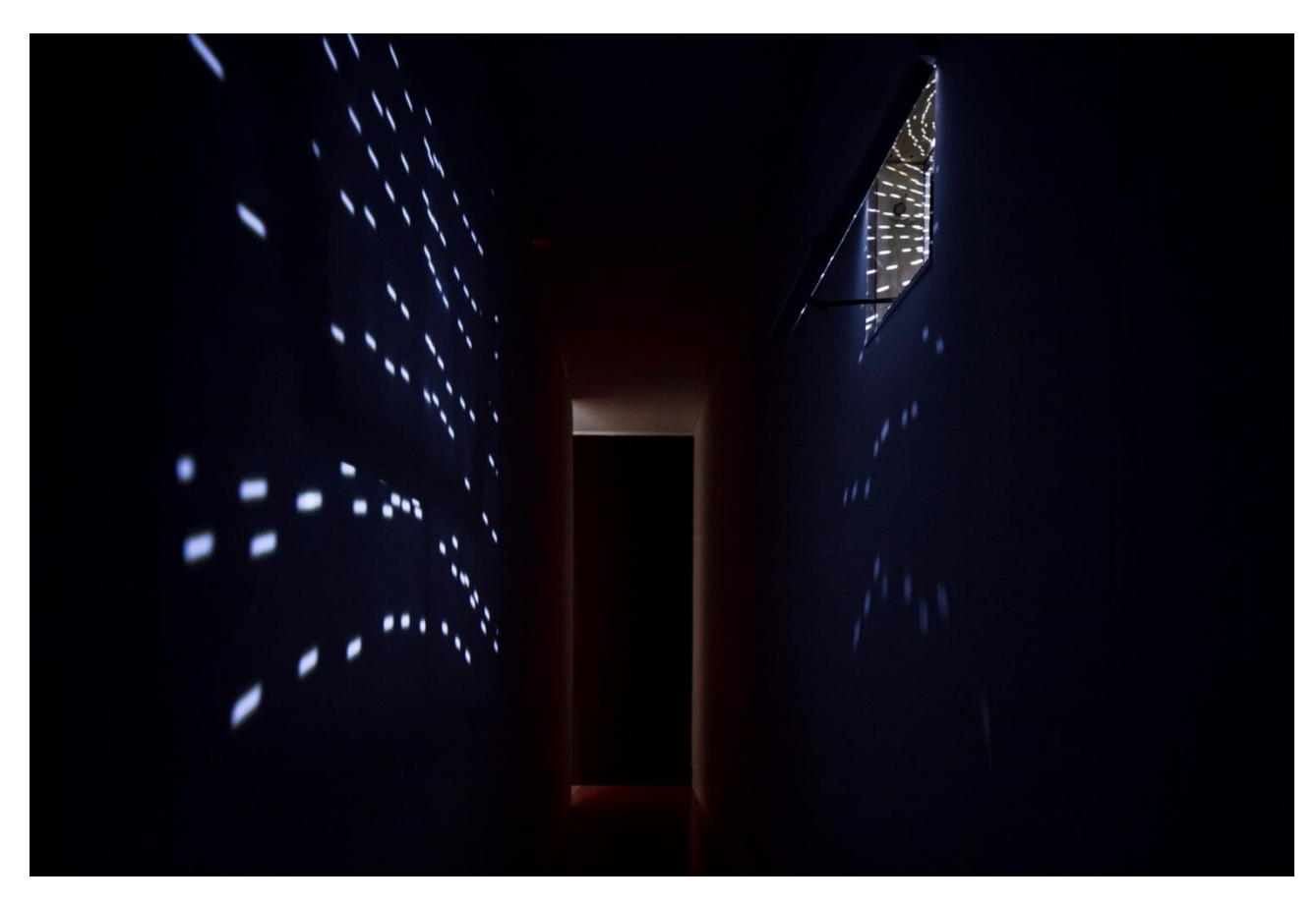
Jem Noble Dream Dialects, 2016 (installation view) commissioned by Te Tuhi, Auckland

The Contemporary Art Foundation has an agreed set of performance measures and targets which form the basis for accountability to delivering on council's strategic direction, priorities and targets. These are reported on a six monthly basis.