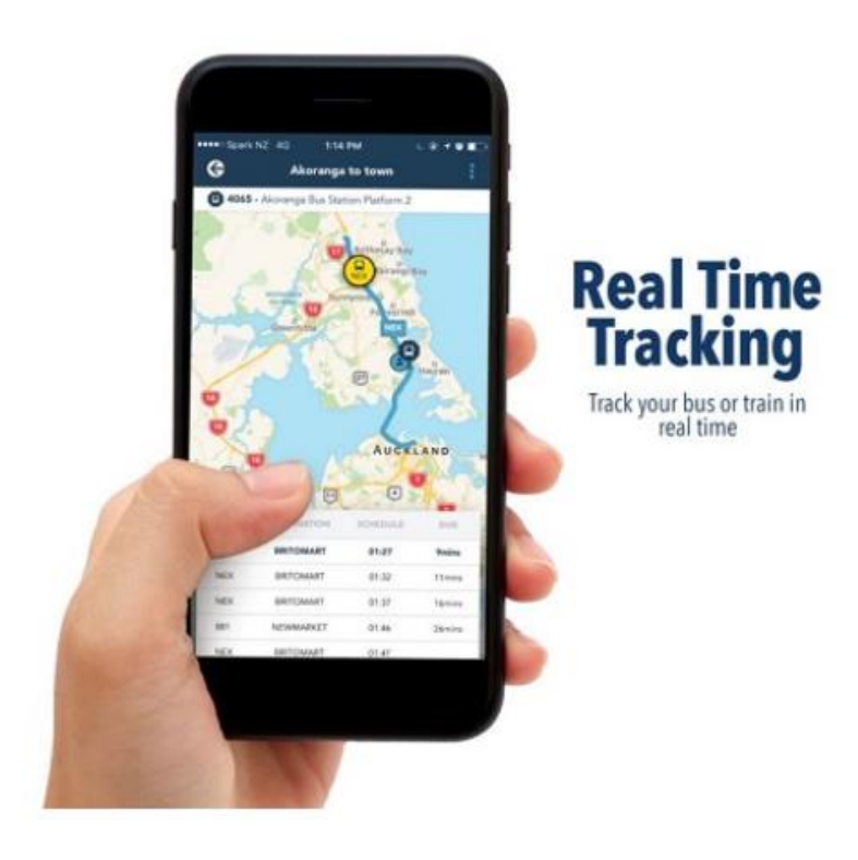
AT Mobile app goes public