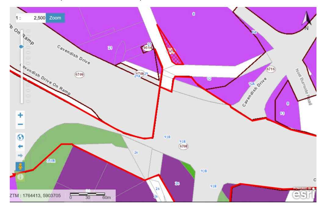
Figure 1 , AUP zoning map indicating designation and extent of partial removal of the hatched area (Section 2 SO 315376)

Figure 2: NZTA aerial map indicating designation and extent of partial removal of 16 Diversey Lane Manukau (area in red).