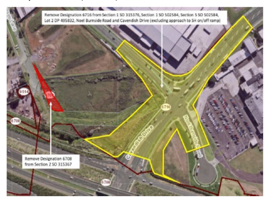
Figure 2: NZTA aerial map indicating designation and extent of partial removal of 16 Diversey Lane Manukau (area in red).

Figure 1 , AUP zoning map indicating designation and extent of partial removal of the hatched area (Section 2 SO 315376)