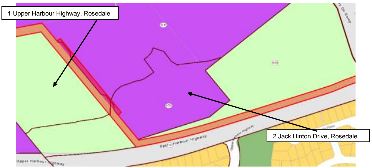
1.3. Description of the site and existing environment

The land affected by the proposed alteration to the boundary of the designation is approximately 500m in length. It extends from the eastern boundary of the North Harbour Hockey Club with the Rosedale Treatment Plant down to the Upper harbour Highway (State Highway 18) and continues just to the north of the highway boundary to the intersection with Caribbean Drive.