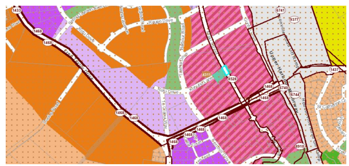
Figure 2 Designation 1468 from Spring Garden Avenue to Upper Harbour Highway