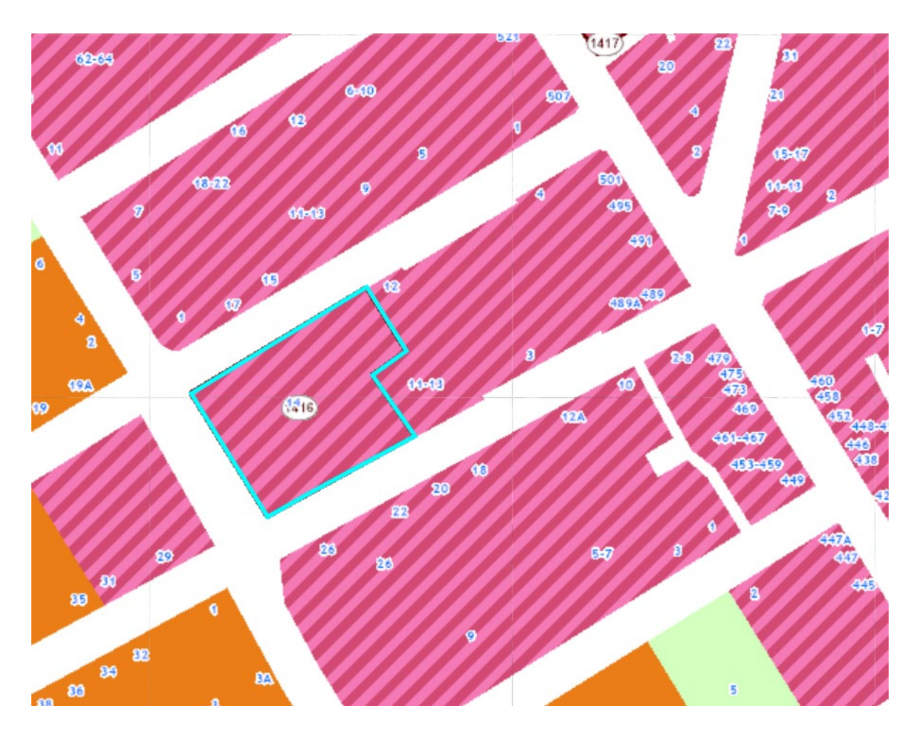
Figure 1: AUP(OP) GIS Viewer map of Designation 1416 (outlined in blue)

Auckland Transport has provided a site plan showing the extent of the designation which is to be partially removed (refer to Attachment A ).