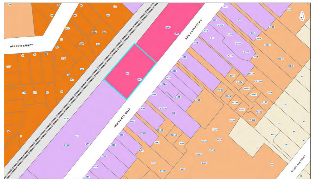
Figure 2: AUP (OP) Zoning

13. The Plan Change area is located within the Business – Town Centre zone, however the south-western boundary is contiguous with the Business – Mixed use zone ( Figure 2 ).