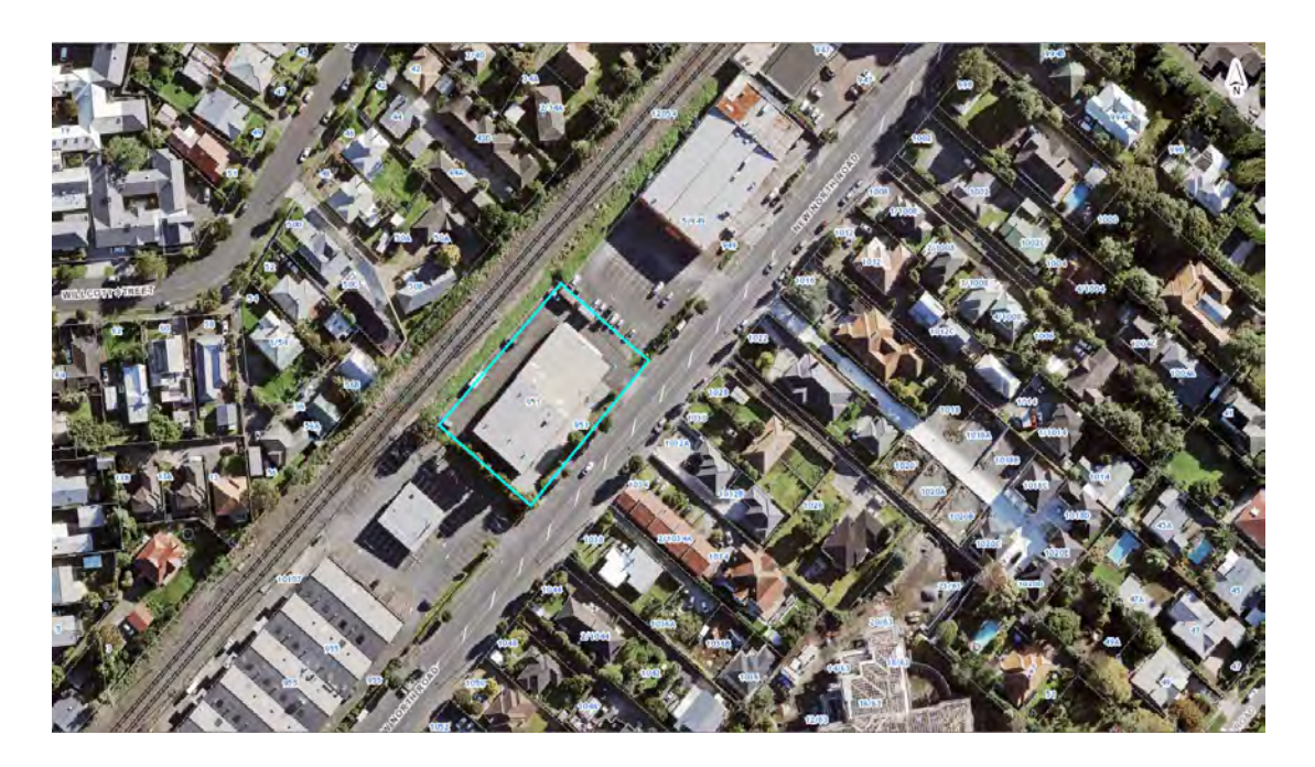
Figure 1 Location of Plan Change area

13. The Plan Change area is located within the Business – Town Centre zone, however the south-western boundary is contiguous with the Business – Mixed use zone ( Figure 2 ).