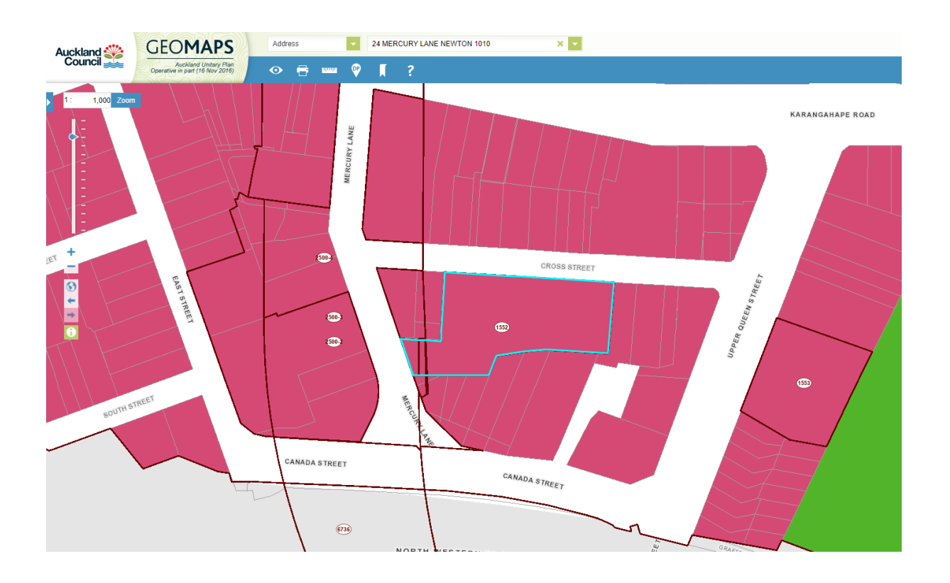
Figure 1 – Designation 1552 outlined in blue