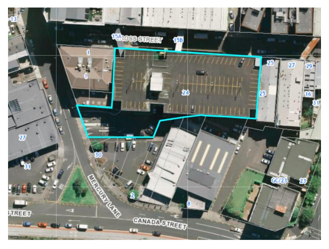
Figure 2 - Aerial photograph of designation site