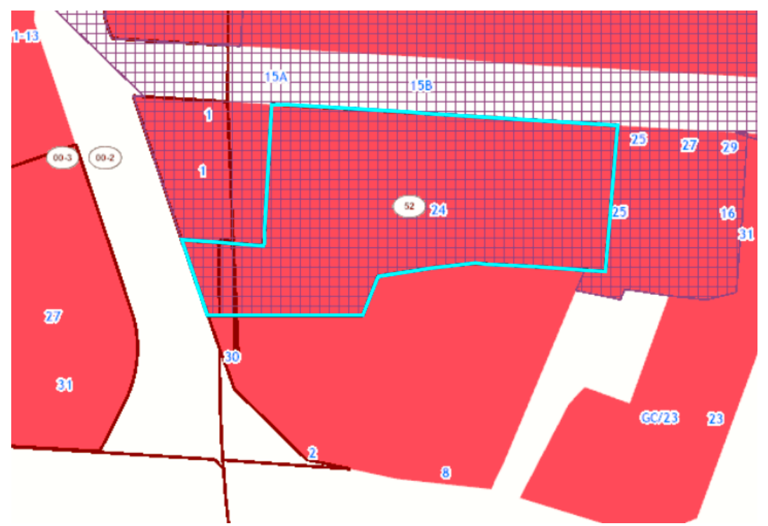
Figure 1: Designation and underlying zoning (Business – City Centre) of site

The designation is currently shown in the AUP maps as follows: