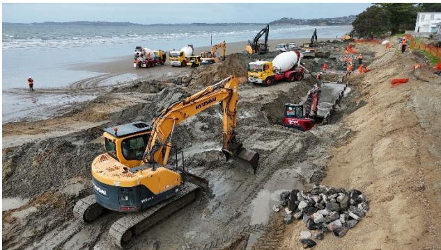
Section of foundation under construction, June 2025

Construction of the concrete foundations has been one of the most challenging aspects due to the tides and ground water, and this is now complete for two-thirds of the wall.