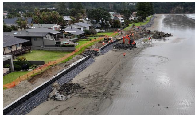
Completed section of seawall near Kohu Street, May 2025

On this project JFC appointed Veia Contractors, a diverse supplier, as one of two stonemason subcontractors to construct the seawall. Veia have gained valuable experience through working on a large-scale project for Council, and we look forward to partnering with their team on further projects in the future when the seawall is complete.