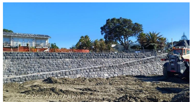
Kohu Street pedestrian ramp under construction, May 2025

The stone walls for two of the three pedestrian ramps have been formed, and the ramps will be poured with concrete when the walkway is constructed adjacent to these areas.