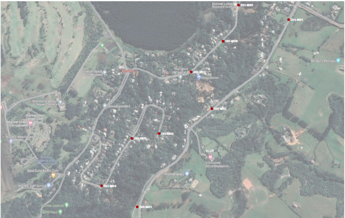
Fig 1: Drilling locations (Red dots) - nine drill locations in total.