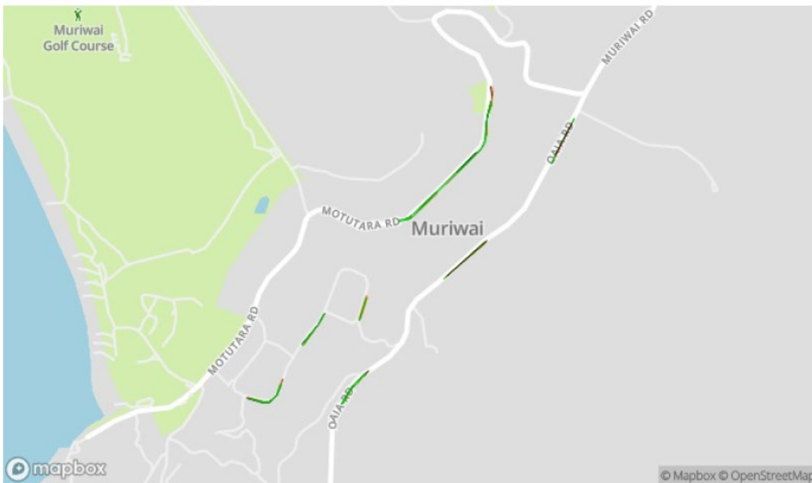
Fig 2: Traffic Management locations (Green lines) – noting this will not be all locations at once