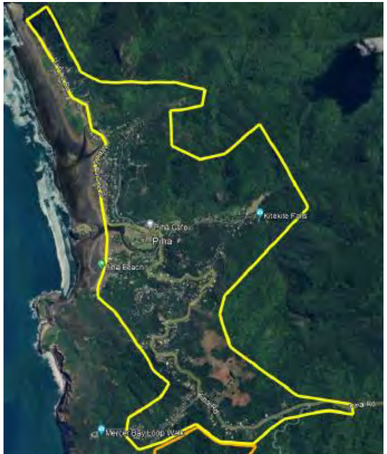
Figure 2: Overview of Piha assessment area