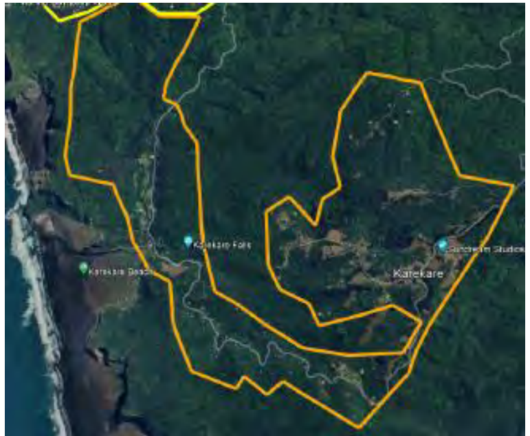
Figure 3: Overview of Karekare assessment area

Deep ground investigation (e.g. machine borehole drilling) has not been scheduled for Piha and Karekare. Because of the types of landslides experienced in Piha and Karekare, undertaking deep ground investigation may not add significant value to the broad scale landslide risk assessment (but will slow down and extend the assessment timeline). The need for deep ground investigation may be considered if there is a change in the landslide risk assessment objective in the future.