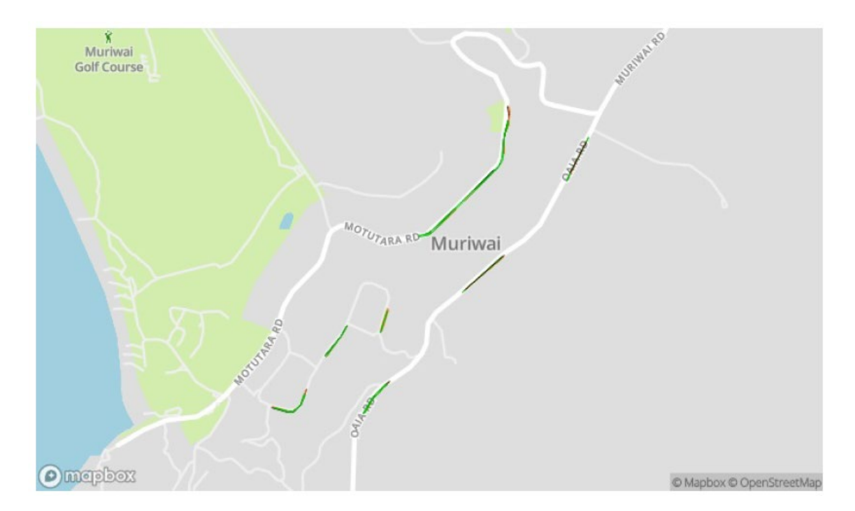
Fig 2: Traffic Management locations (Green lines) – noting this will not be all locations at once