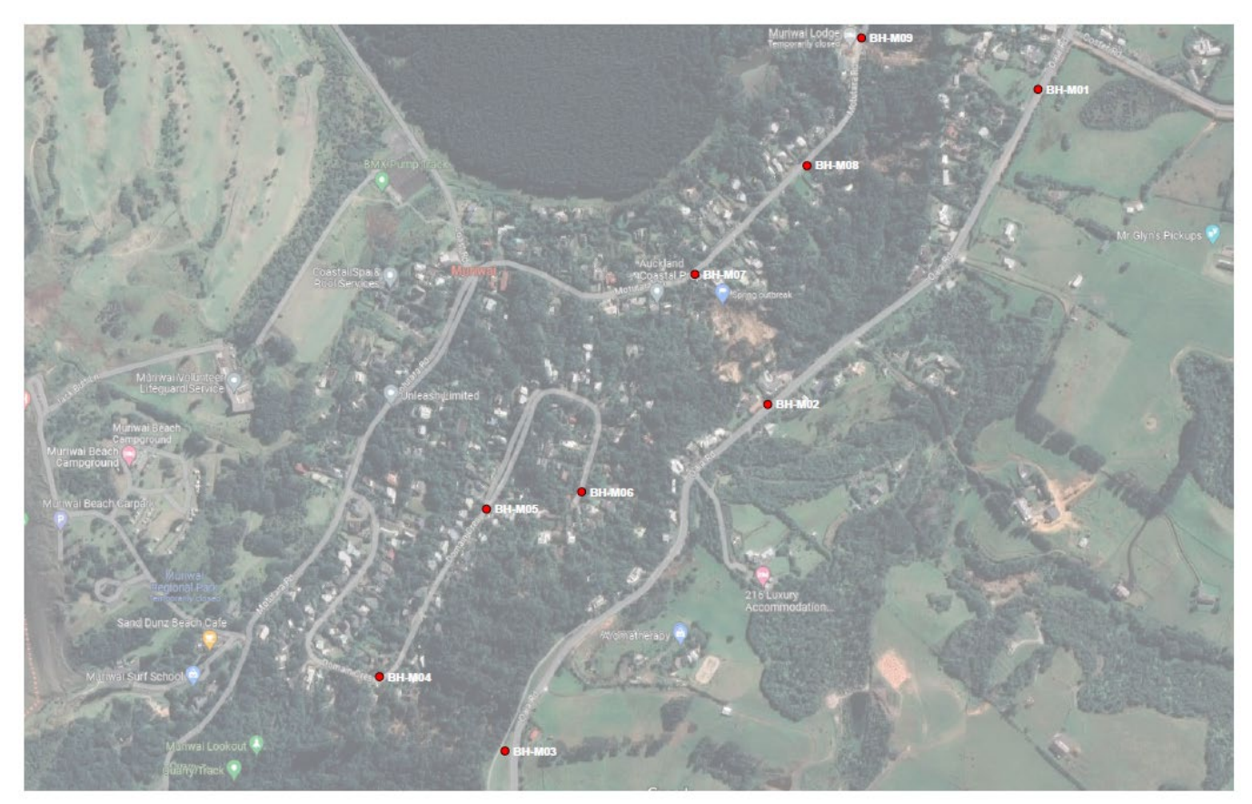
Fig 1: Drilling locations (Red dots) - nine drill locations in total.