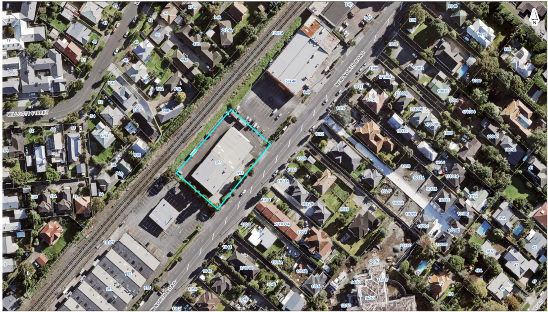
Figure 1 Location of Plan Change area