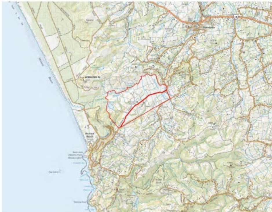
Figure 1: Location of the Muriwai Downs Property

The applicant has requested that the application be publicly notified.