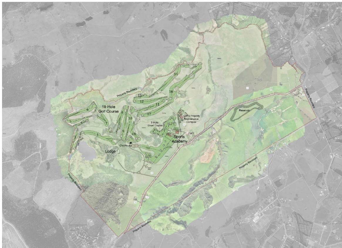
Figure 2: Site plan