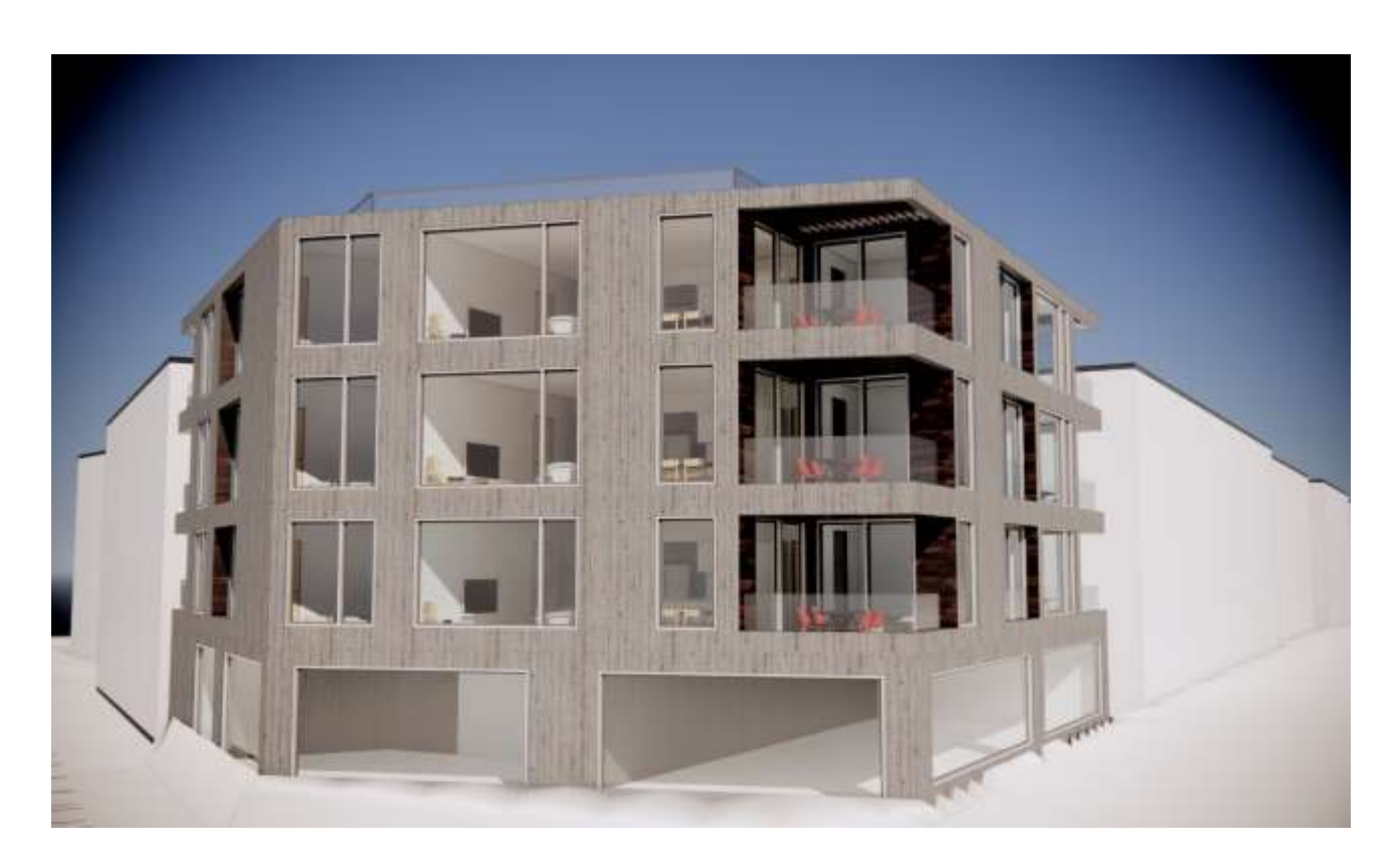
North Apartments Proposed Building composition