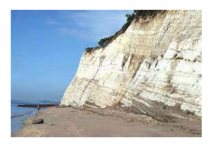
Sandstone cliffs bordering the Waitemata

Referencing the white sandstone cliffs bordering the Waitemata on the Northshore, the Central apartments exhibit a strongly horizontal composition through the use of cantilevered balconies. The balconies have inbuilt planters that bring to life the building and refer to the vegetation that grows on the eroding cliffs. The plaster render that finishes the building connects to the sandstone with its granular texture.