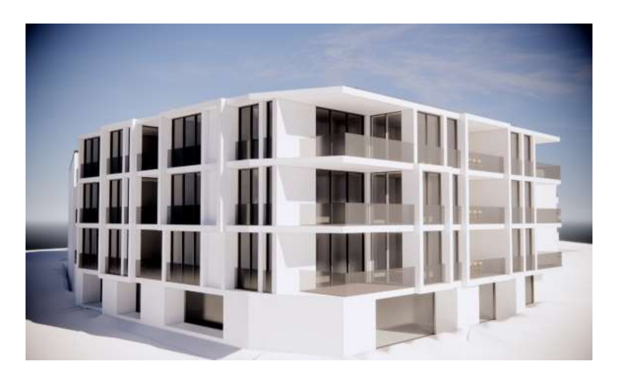
South Apartments Proposed building composition.