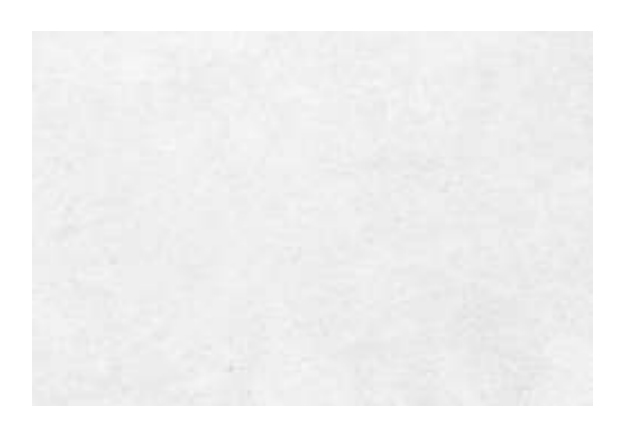
Sto Plaster - limestone finish

The texture of the white plaster render that the building is finished in references the materiality of the limestone rocks of the marine environment. The organic nonlinear composition of the eroded stone is reflected in the non-directional overlaid grid composition of the elevations of this building.