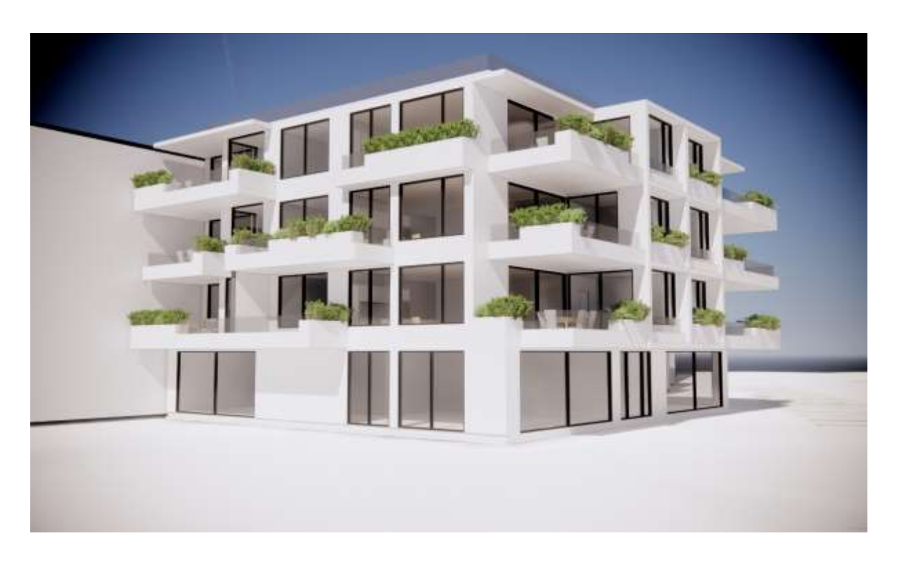
Central Apartments Proposed building composition.