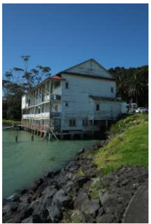
The Original Yacht Club