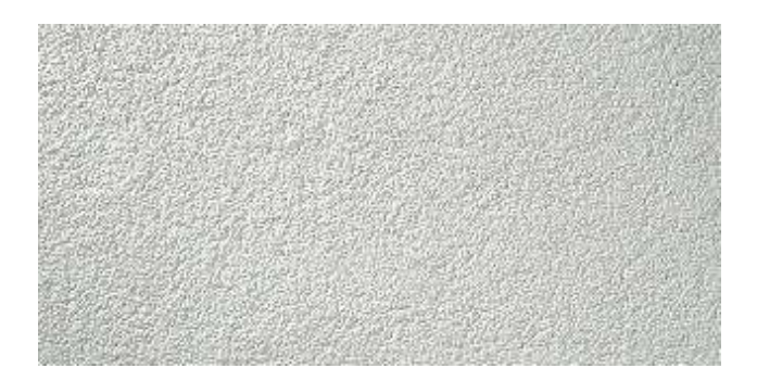
Sto Plaster - sandstone finish

Referencing the white sandstone cliffs bordering the Waitemata on the Northshore, the Central apartments exhibit a strongly horizontal composition through the use of cantilevered balconies. The balconies have inbuilt planters that bring to life the building and refer to the vegetation that grows on the eroding cliffs. The plaster render that finishes the building connects to the sandstone with its granular texture.