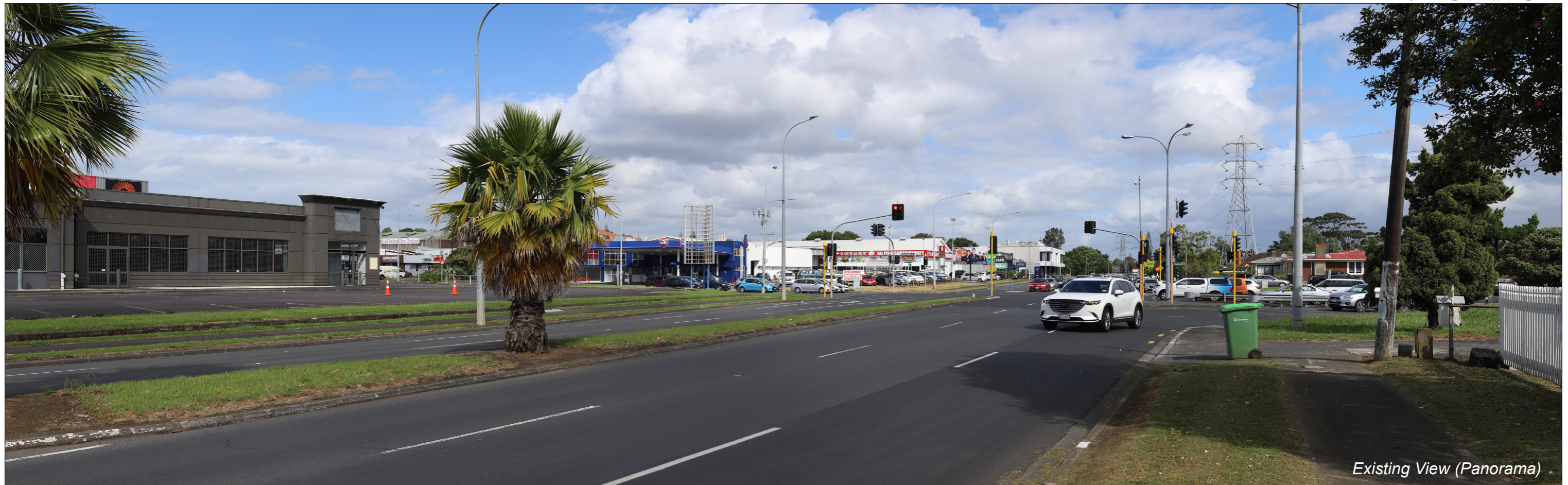
Existing View (Panorama)