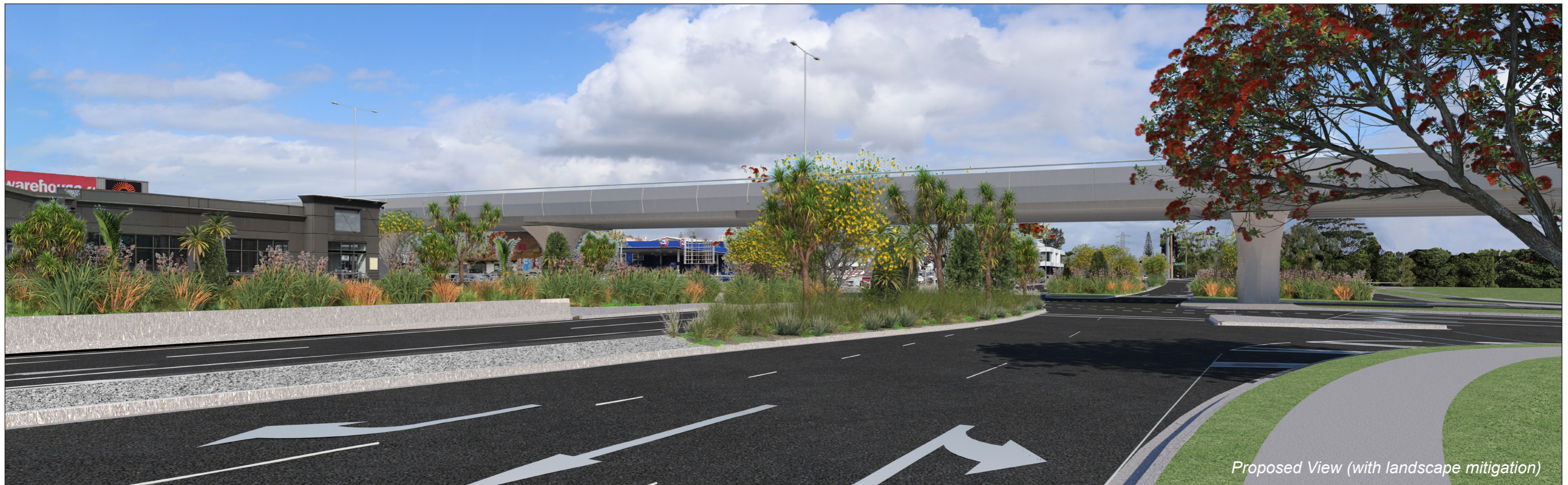
Proposed View (with landscape mitigation)