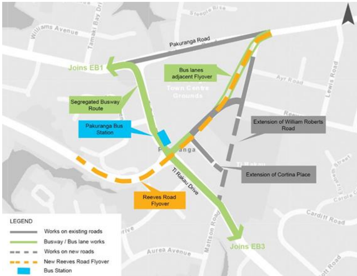
Figure 1 Overview of EB2

An overview of the proposed EB2 works is shown in Figure 1 below.