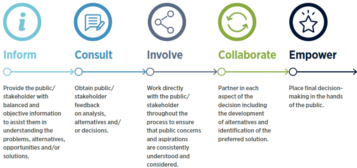
Figure 4 IAP2 spectrum of public participation