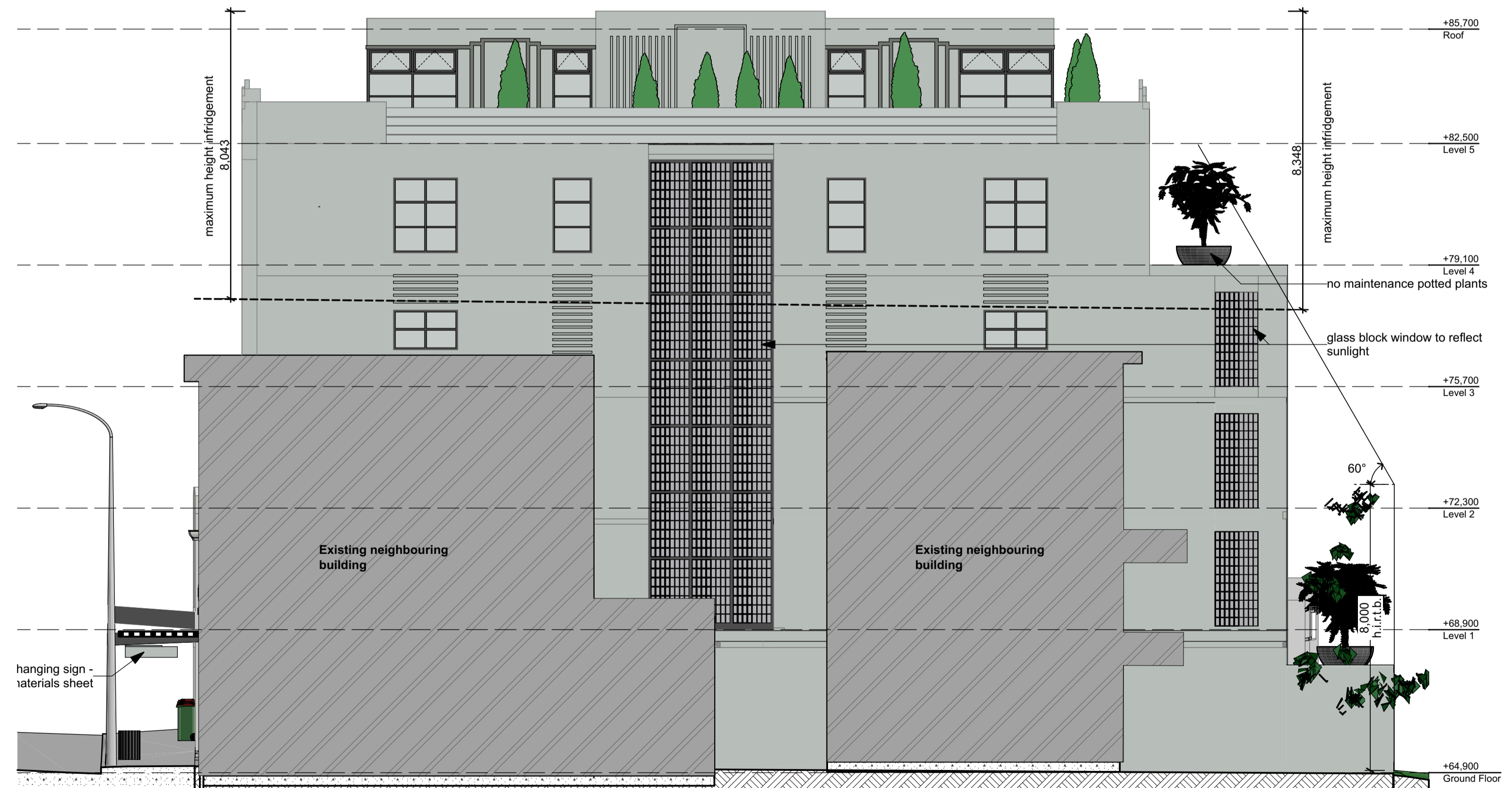
1 Proposed North Elevation 1:100