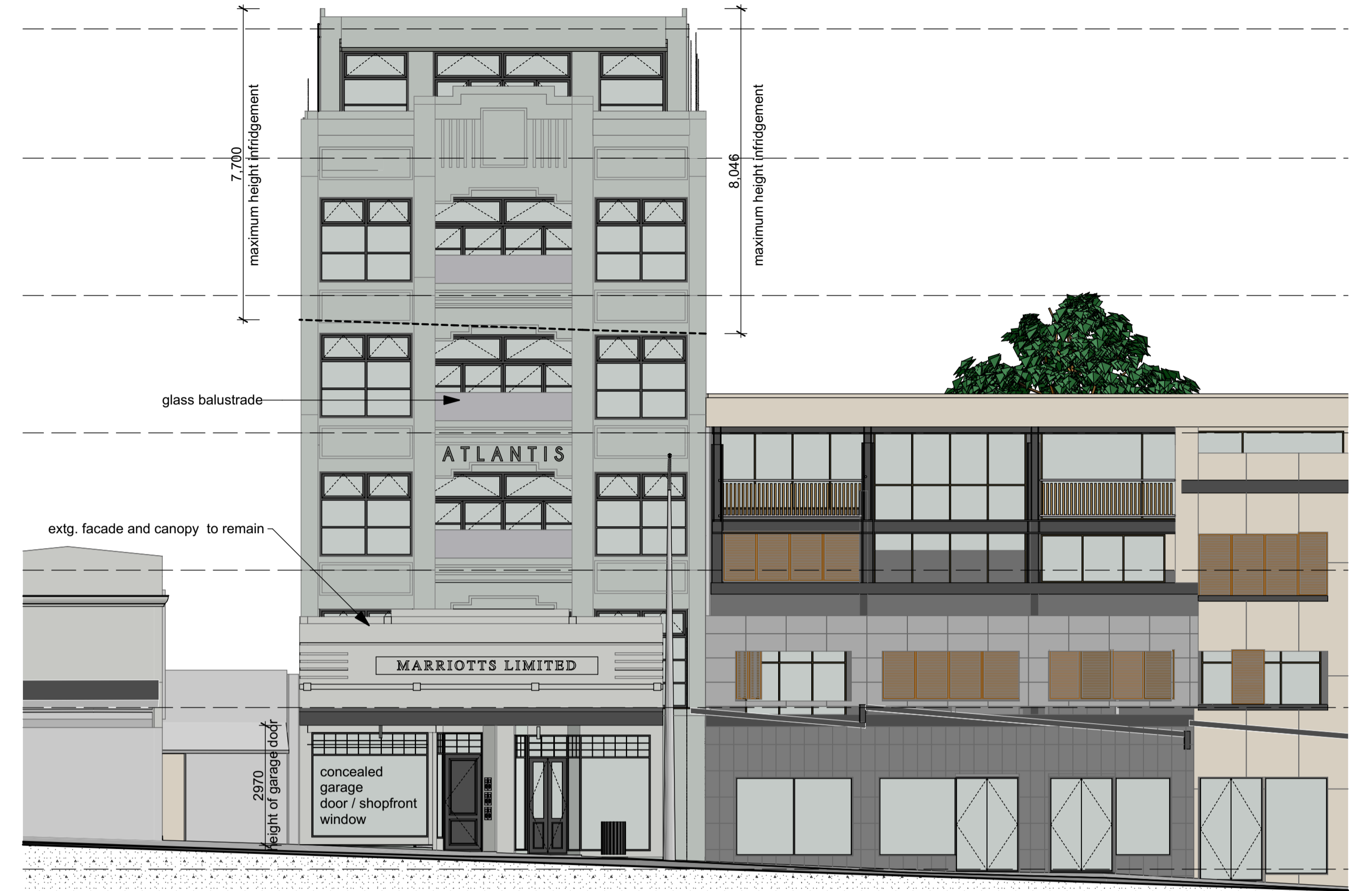
2 Proposed East Elevation 1:100