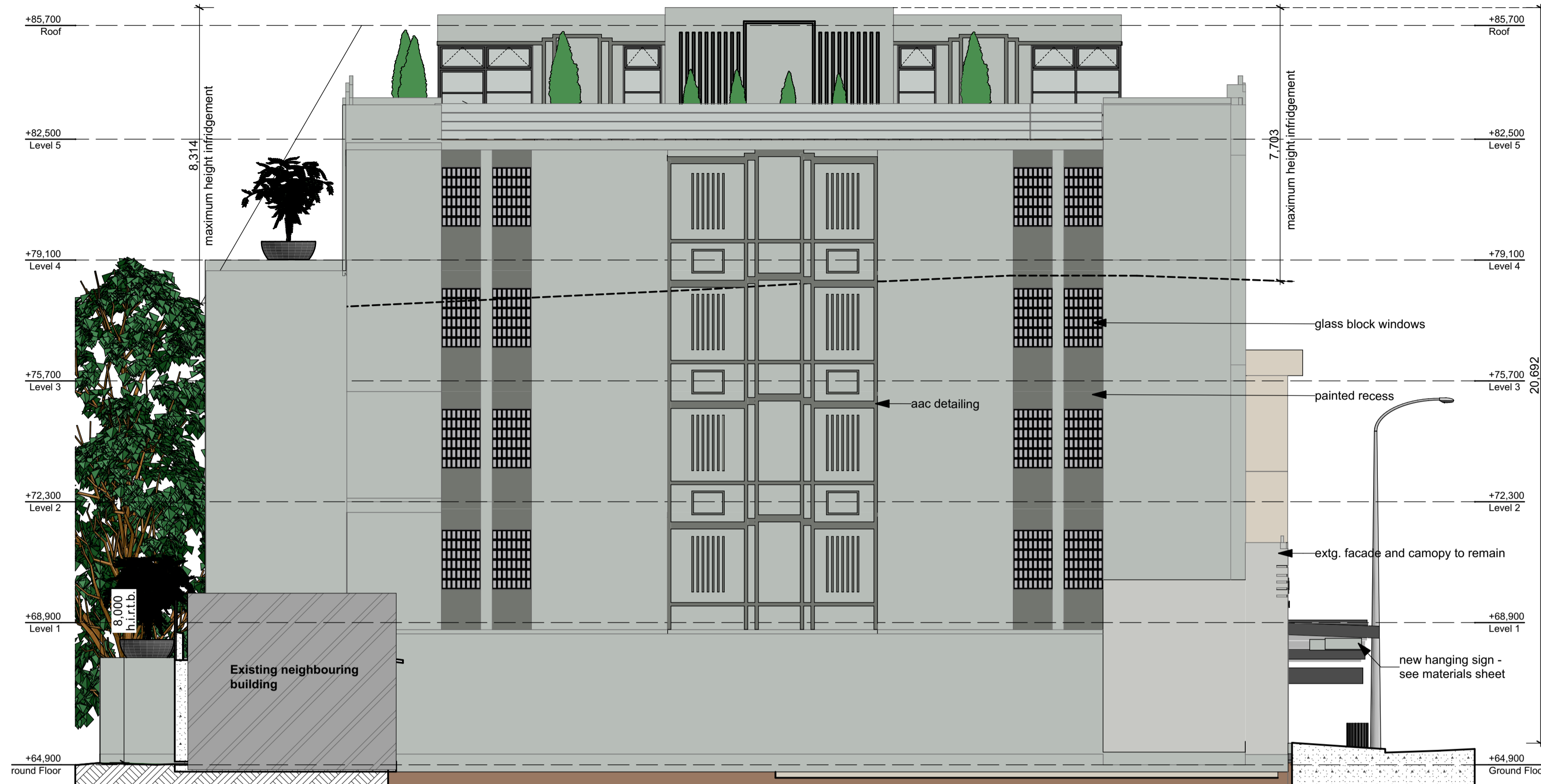
4 Proposed South Elevation 1:100