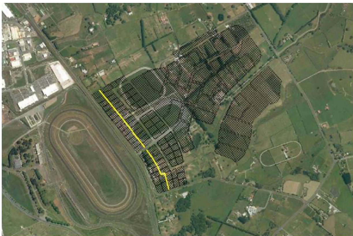
Figure 6 The 'mid|block wall'

The acoustic barrier is to be located mid-block and runs approximately north-south as illustrated below.