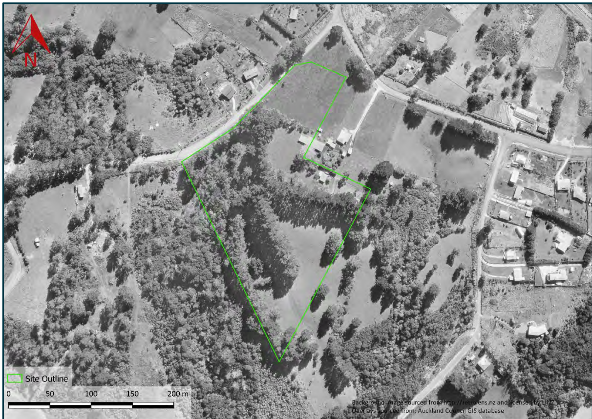
1970 Aerial Photograph