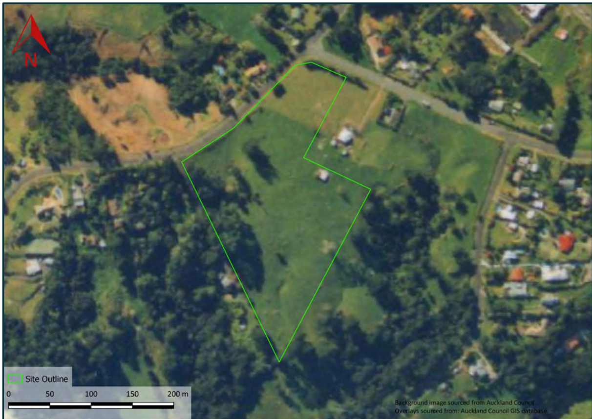
1996 Aerial Photograph