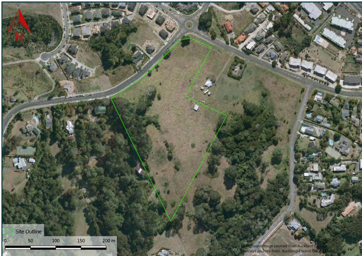
2010 Aerial Photograph