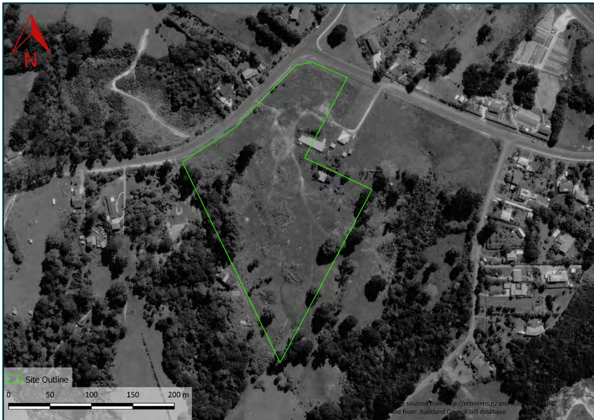
1981 Aerial Photograph