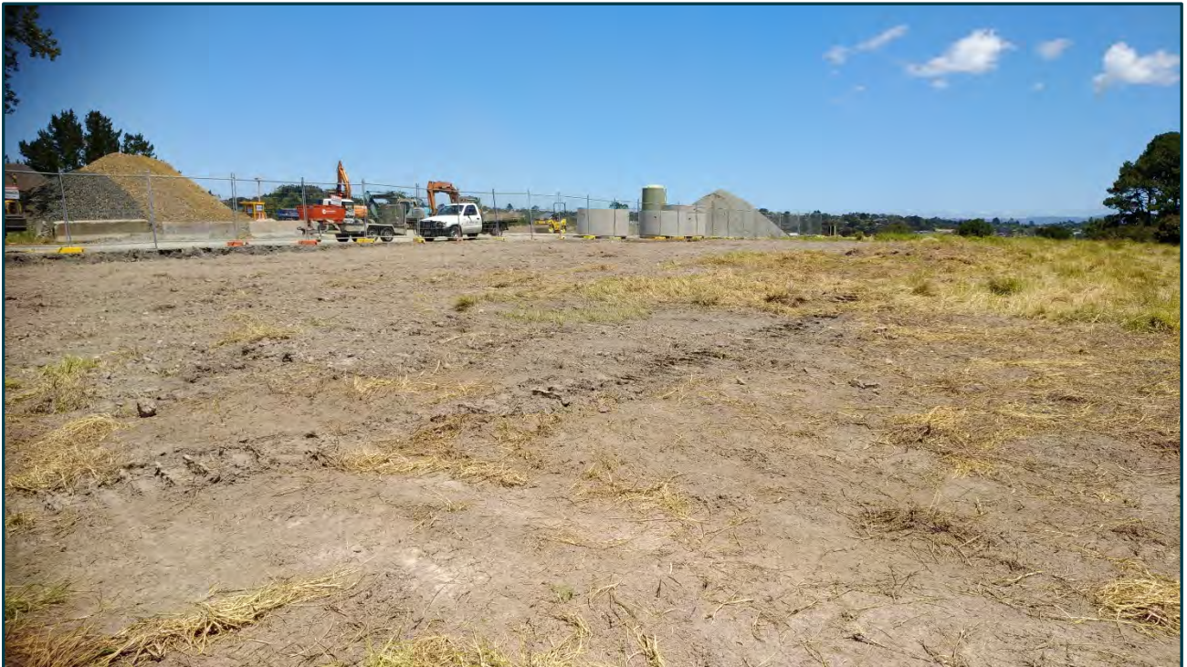
Photograph 9: View of soil disturbance area to the northwest of fenced area, facing southeast.