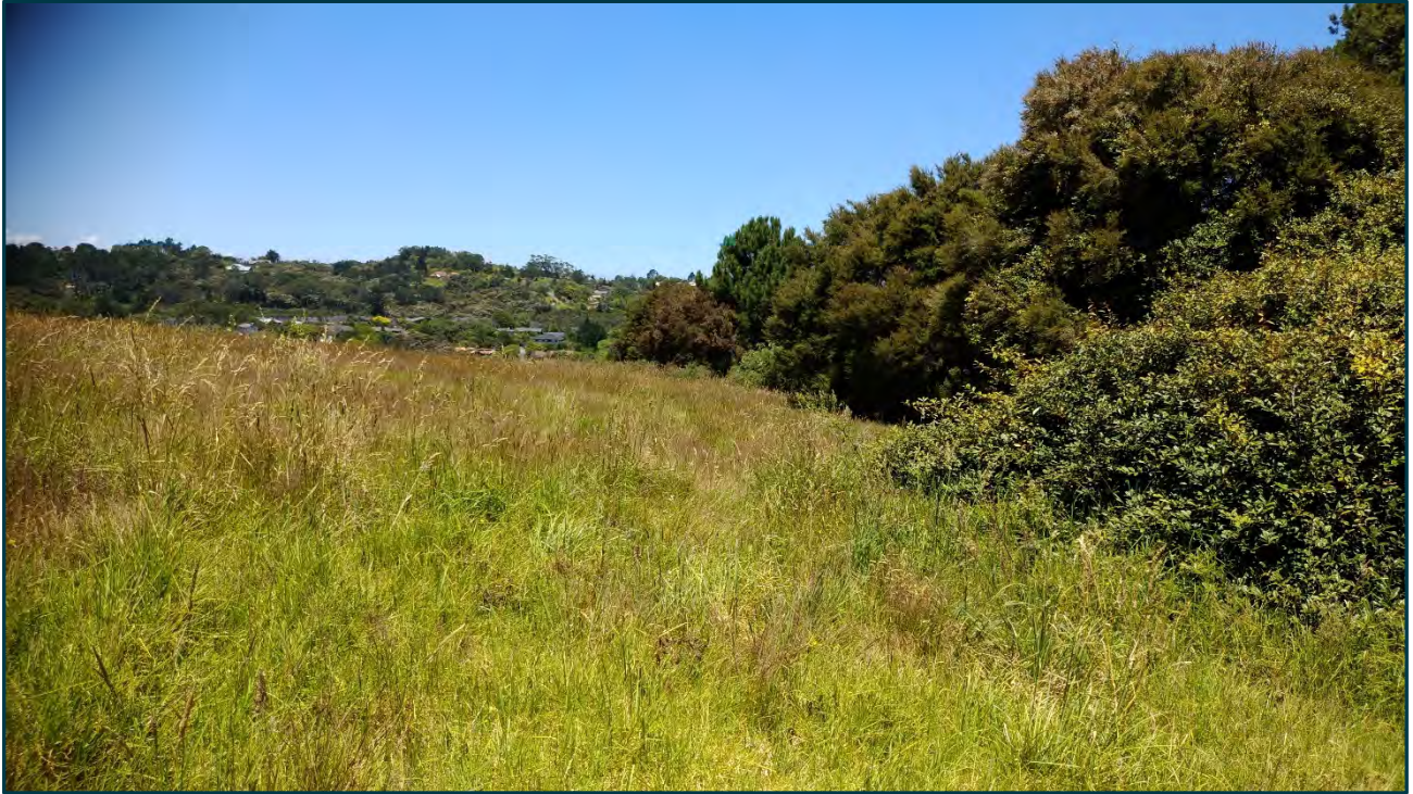
Photograph 3: View along southwest boundary of site, facing southeast.