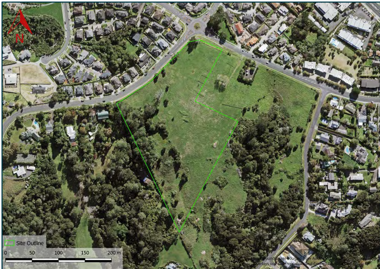
2017 Aerial Photograph