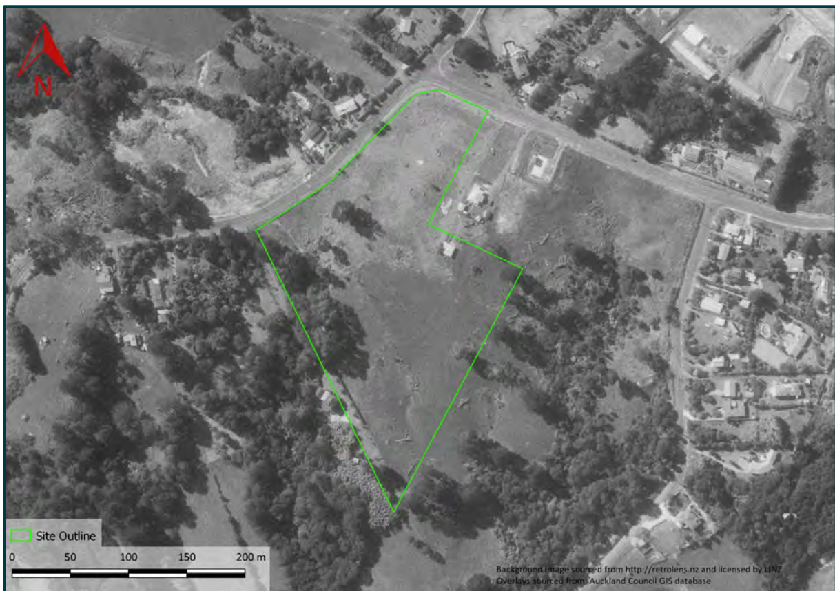
1988 Aerial Photograph