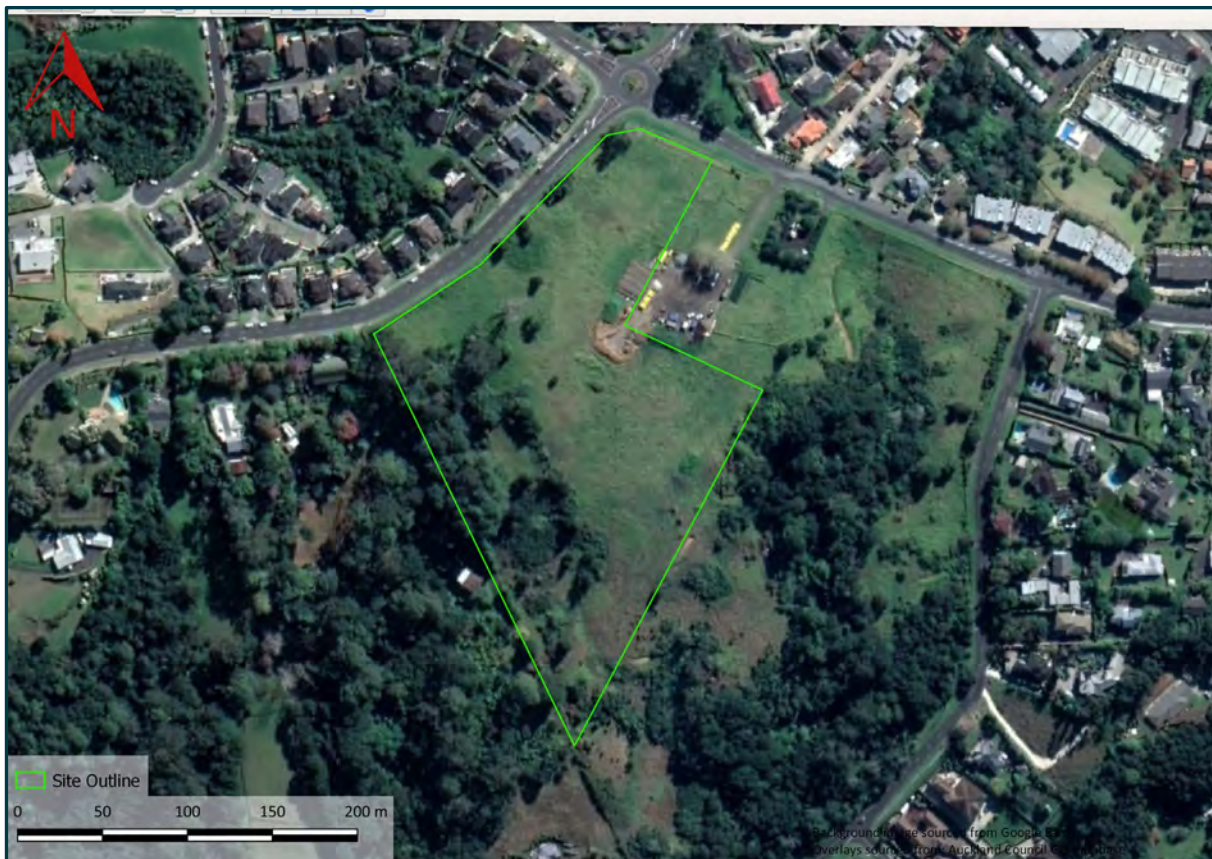
2019 Aerial Photograph