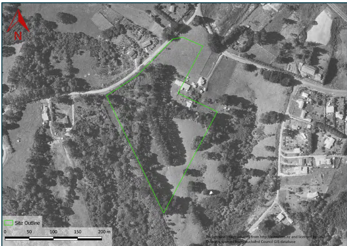
1973 Aerial Photograph