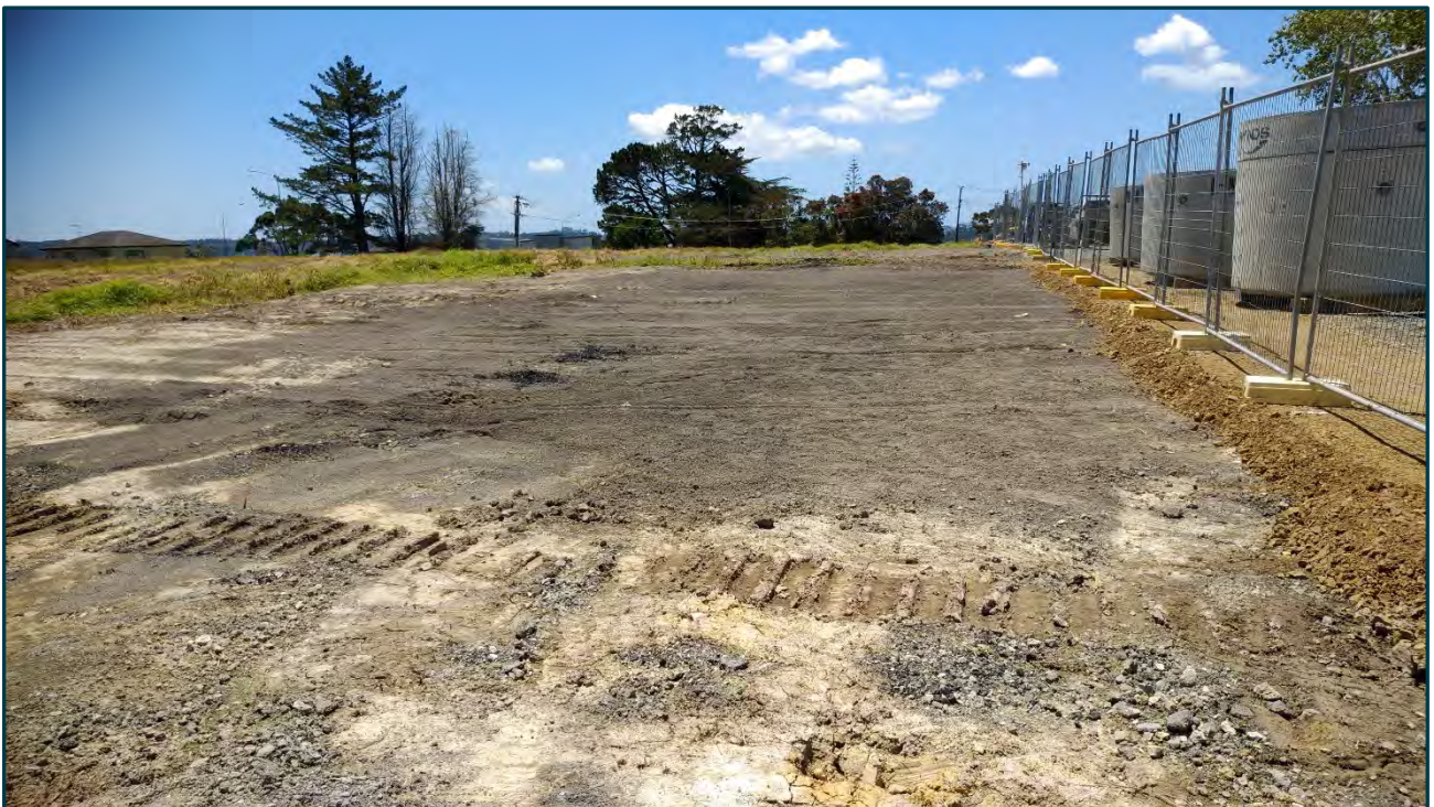
Photograph 10: View of soil disturbance area to the northwest of fenced area, facing north.