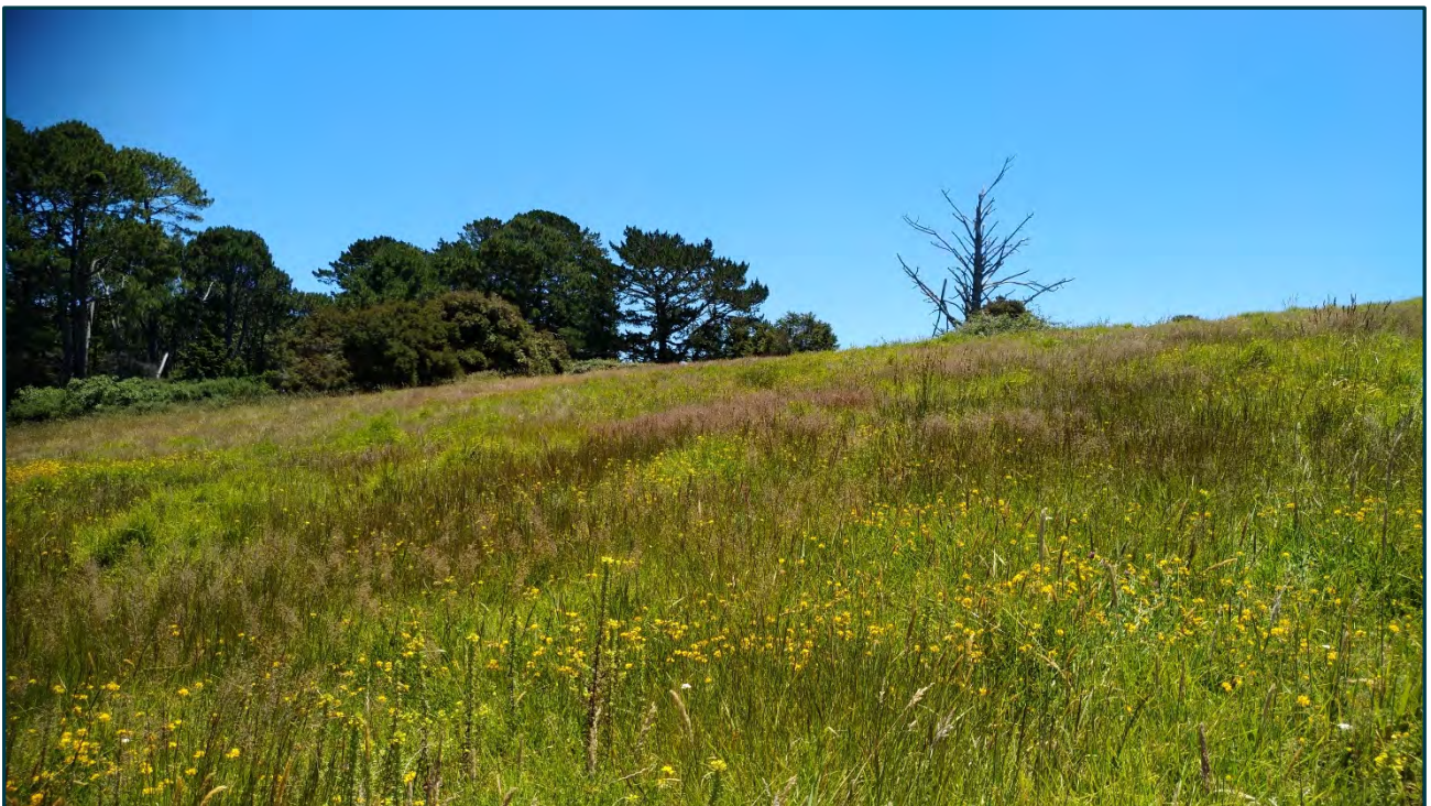
Photograph 6: View of central portion of site, facing north.