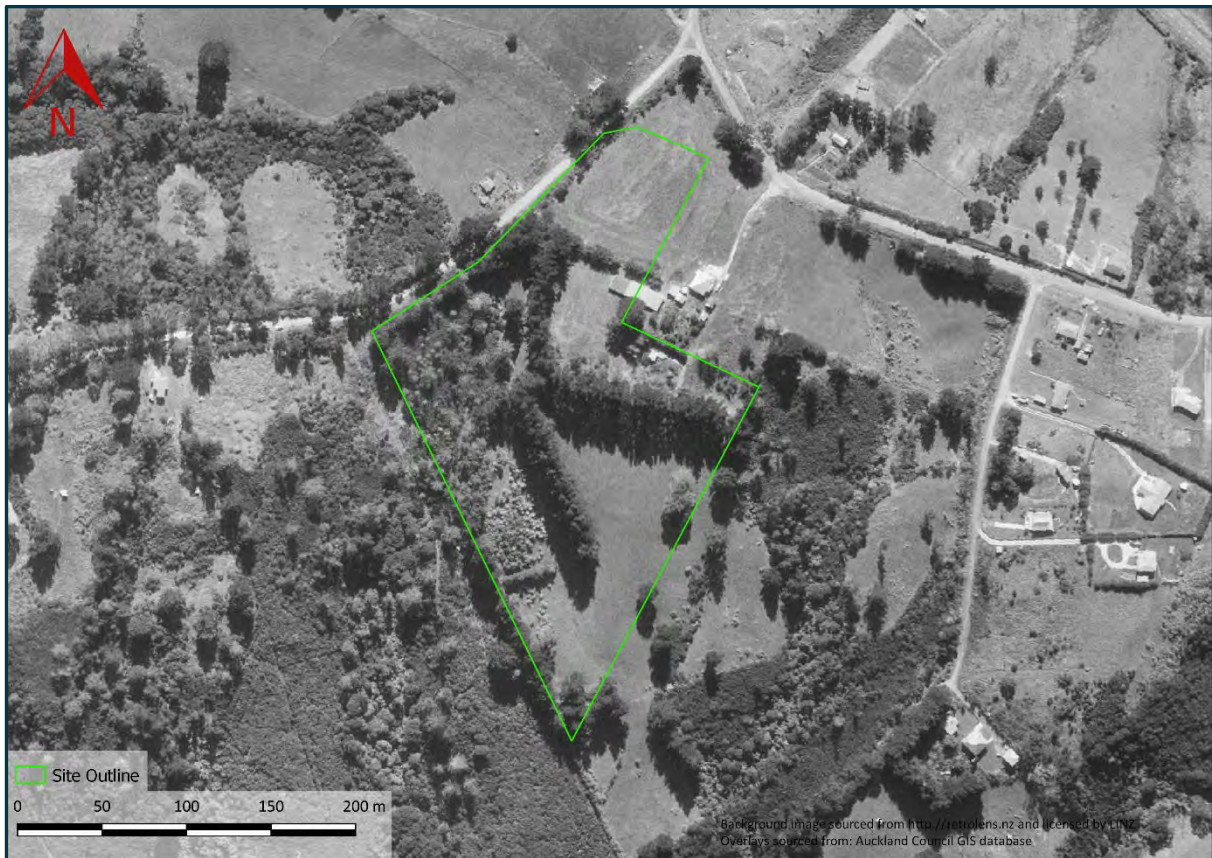
1963 Aerial Photograph