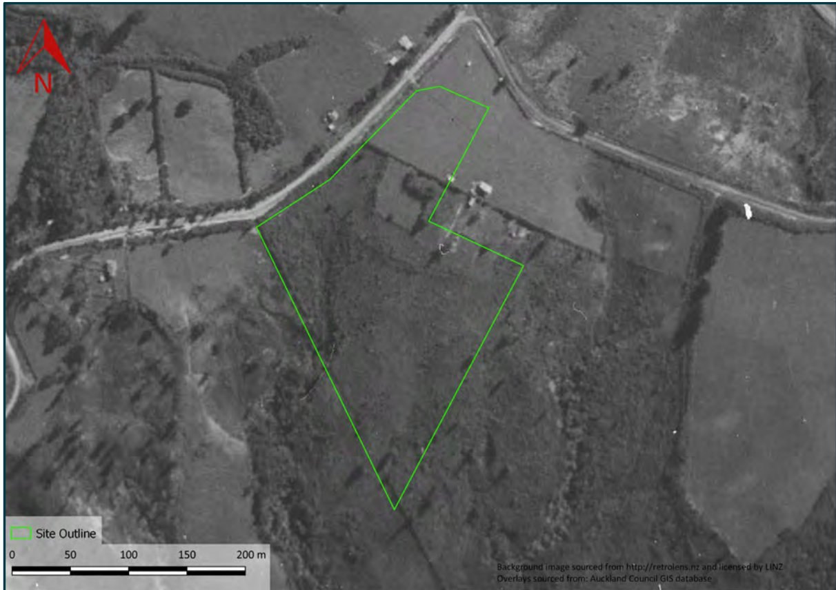
1940 Aerial Photograph