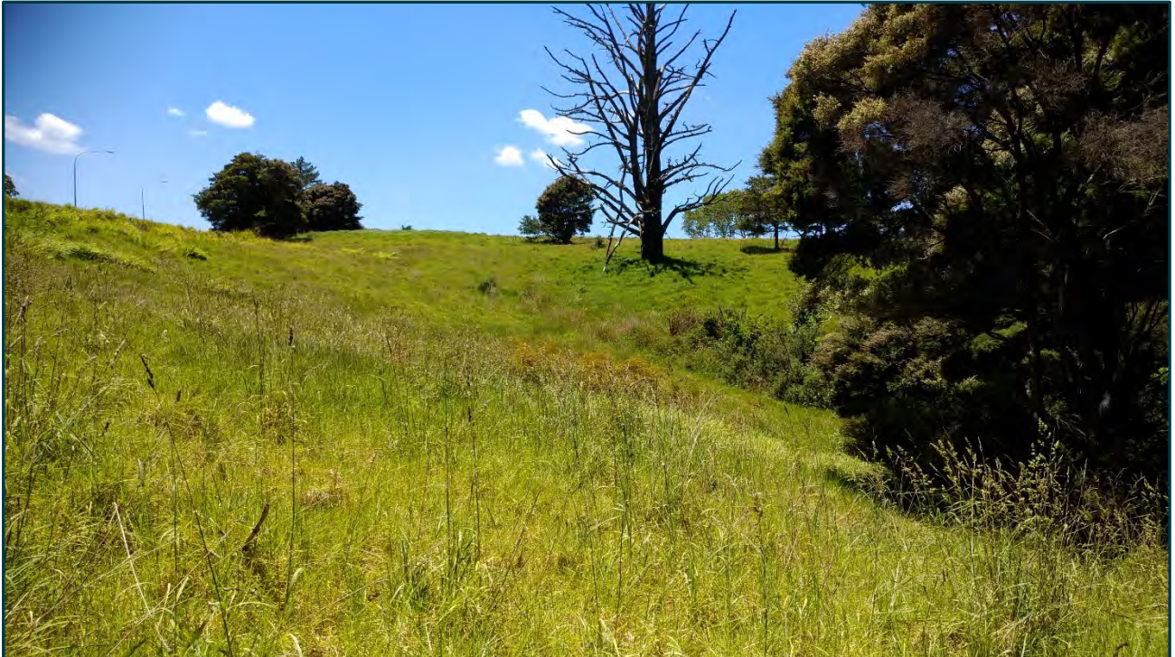
Photograph 2: View of northwest portion of site leading down to western watercourse, facing southwest.