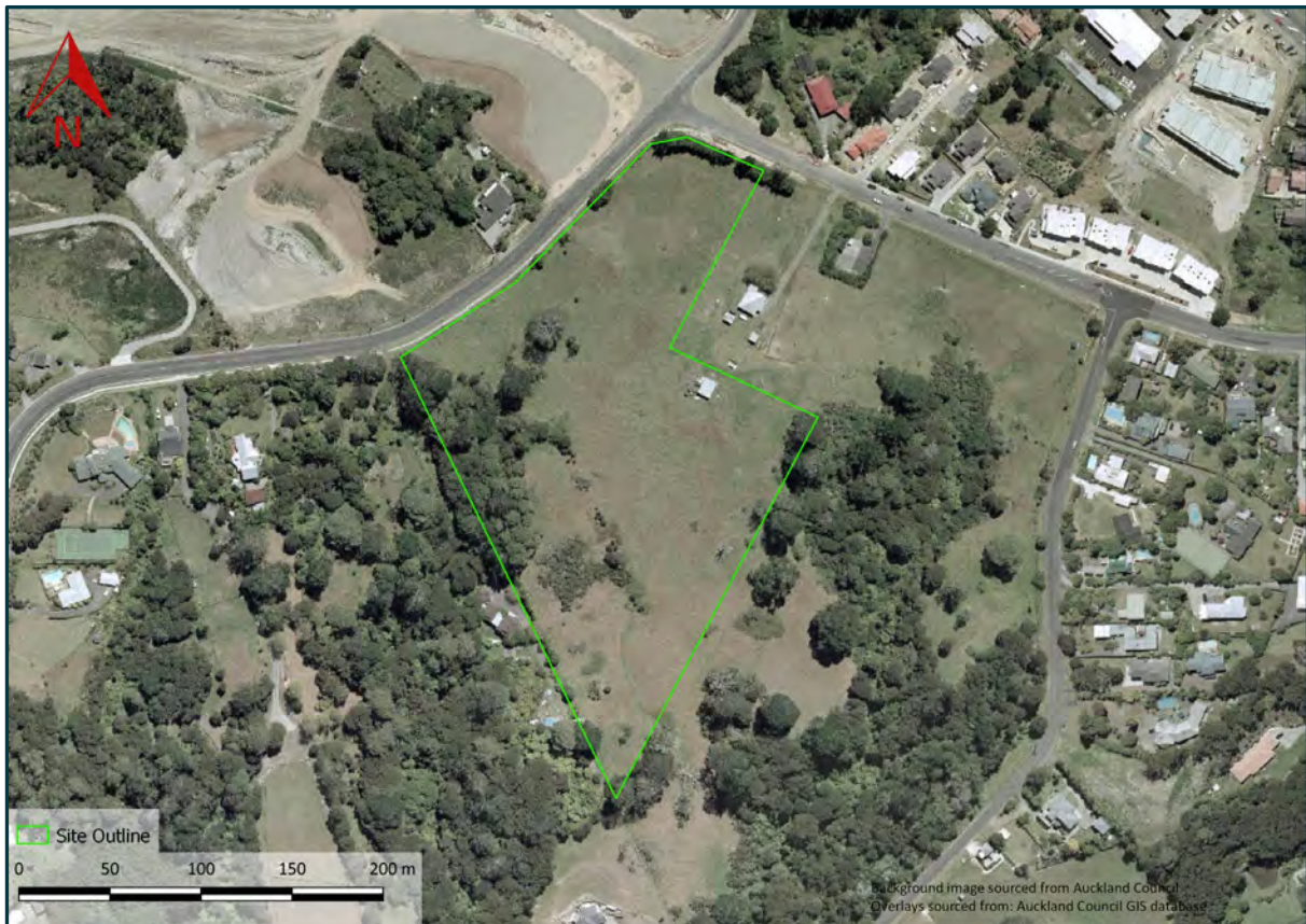
2006 Aerial Photograph