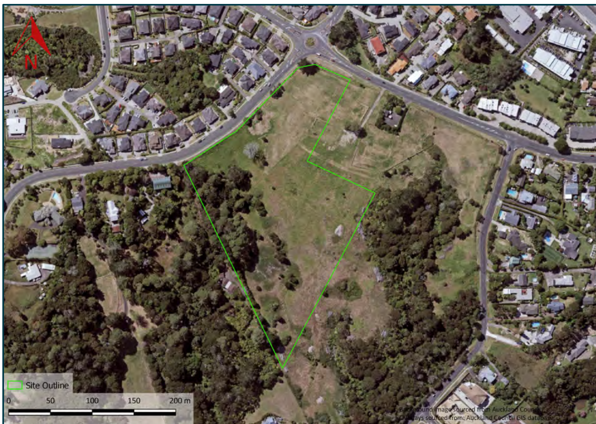
2015 Aerial Photograph