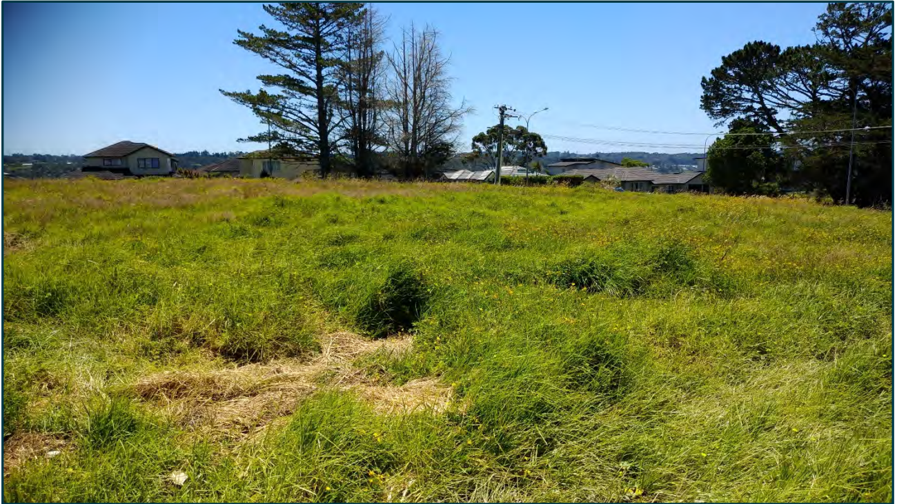
Photograph 1: View of northern portion of site, facing north.