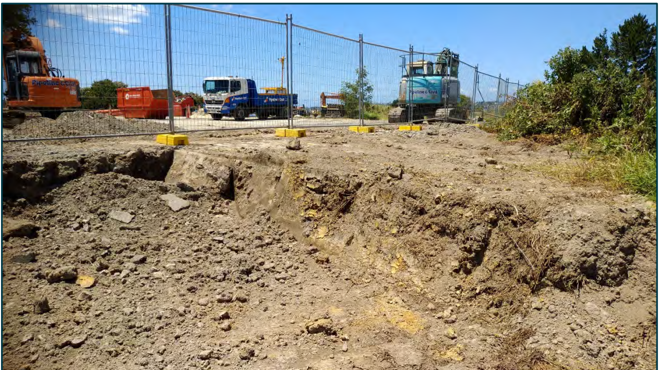
Photograph 8: View of soil disturbance area to the southwest of fenced area, facing east.