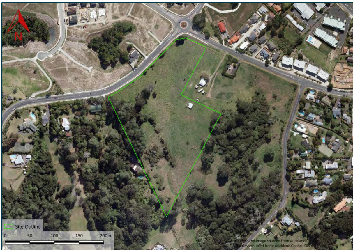
2008 Aerial Photograph