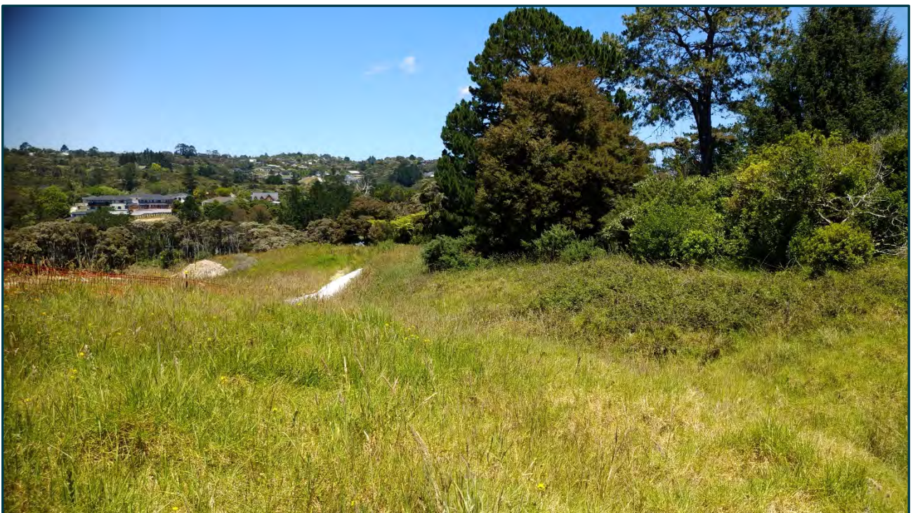
Photograph 4: View of southern portion of site leading down to southern watercourse, facing south.