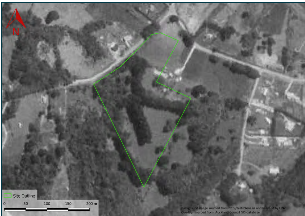
1968 Aerial Photograph