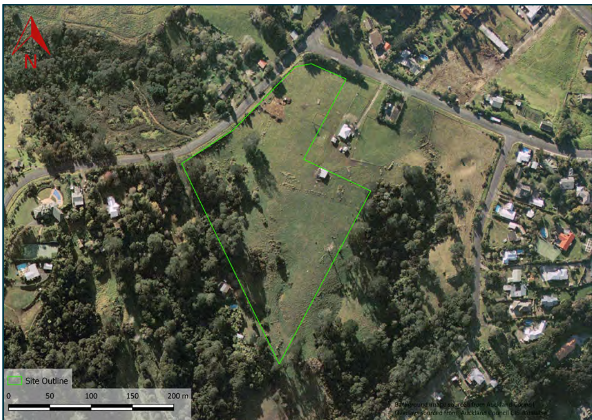
2001 Aerial Photograph