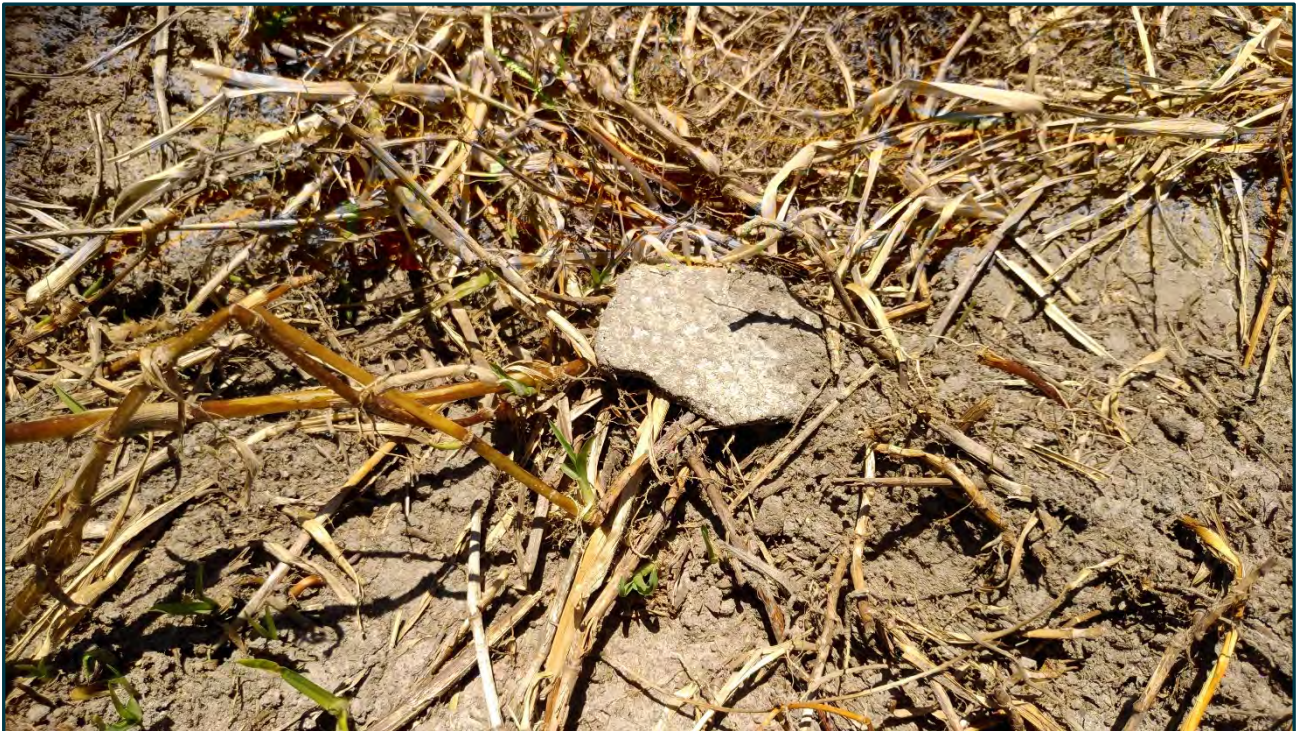
Photograph 11: View of fragment of potential ACM identified within soil disturbance area to the northwest of fenced area.