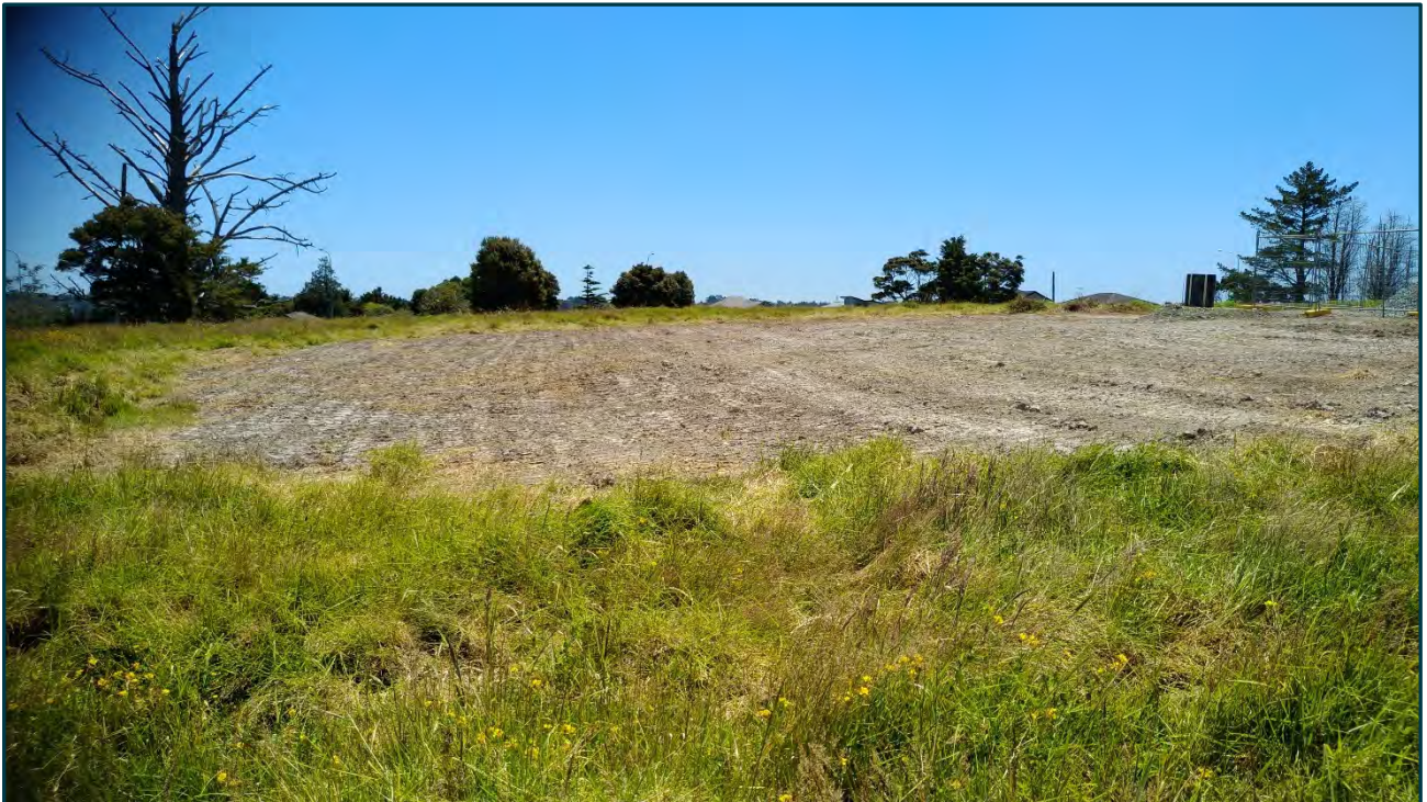
Photograph 7: View of soil disturbance area to the southwest of fenced area, facing northwest.