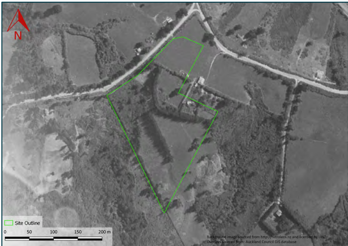
1950 Aerial Photograph