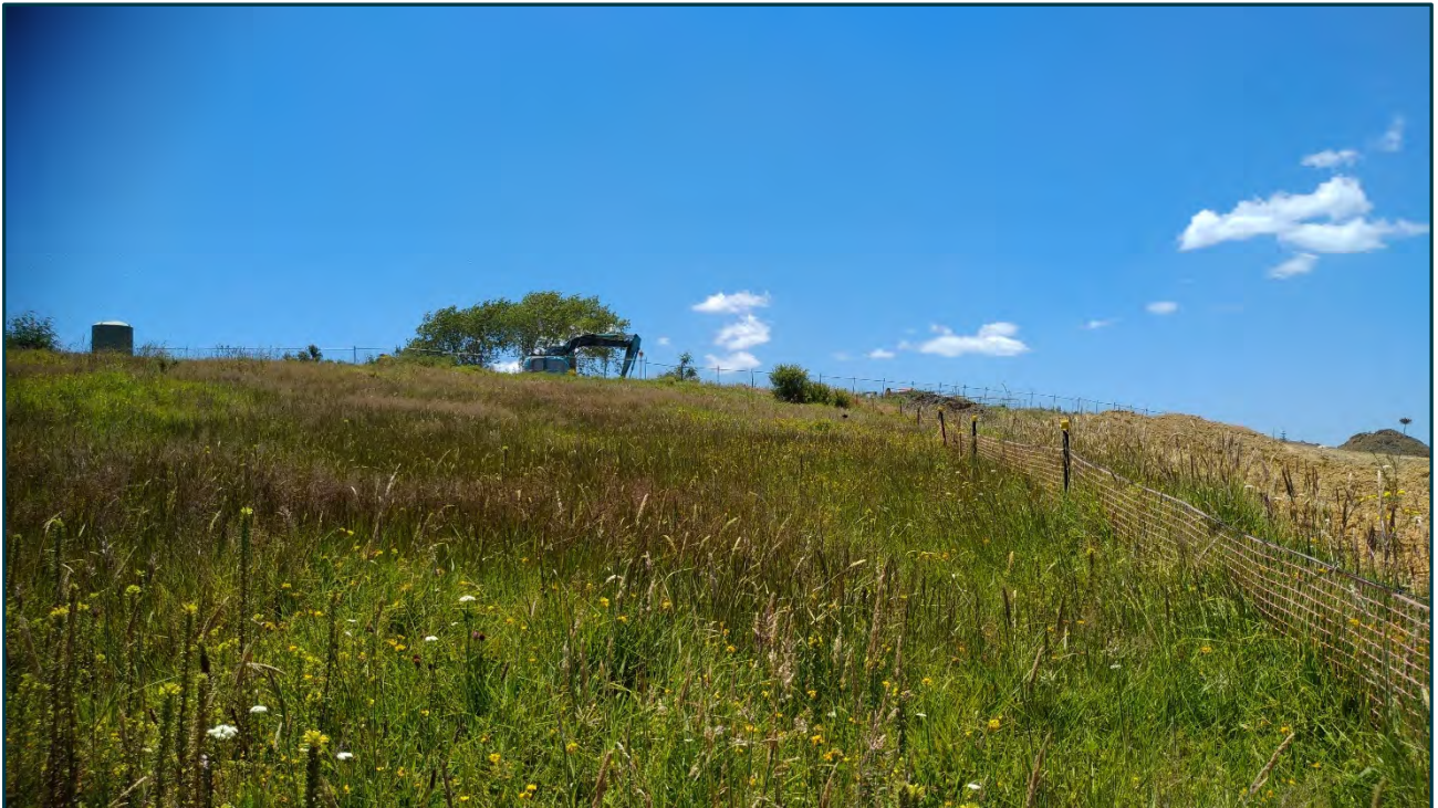
Photograph 5: View of southeast boundary of site, facing northeast.