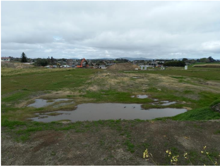
Northern Boundary with 45a Constable Road