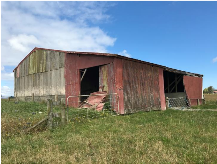
Implement Shed, PACM Clad