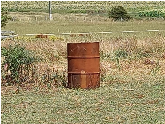
Area of Burning (AOB1)