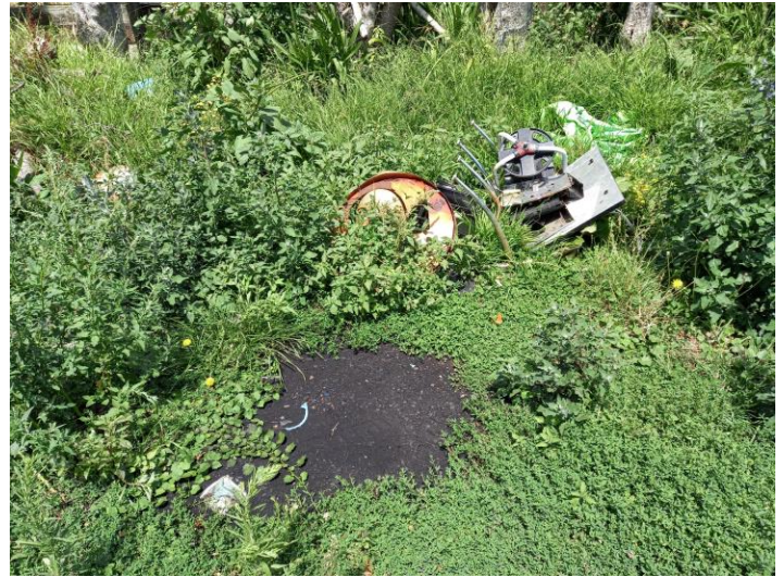
Area of Burning (AOB3)