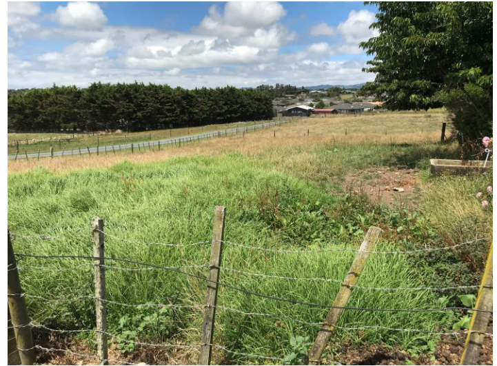
Southern Portion of 92 Constable Road