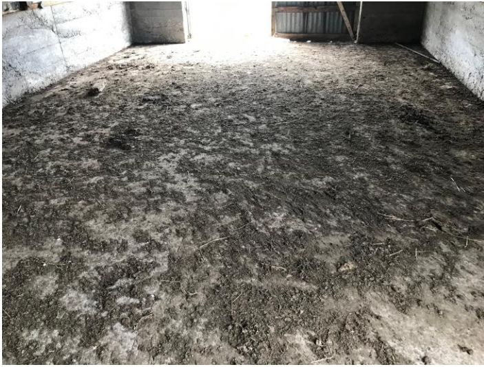
Interior of Hay Shed