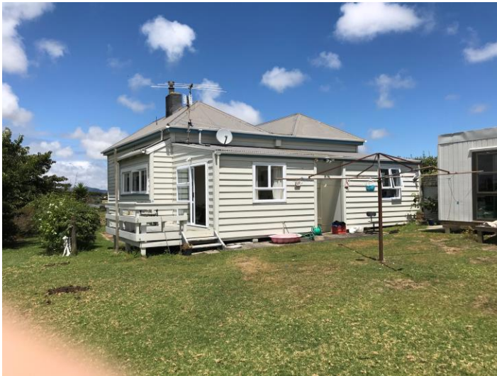
Residential Dwelling (RD1)