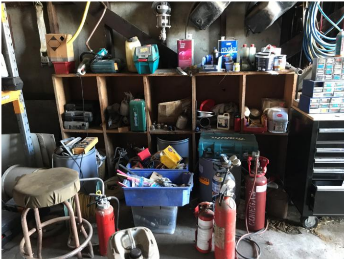
Interior of Storage Shed (SS1)