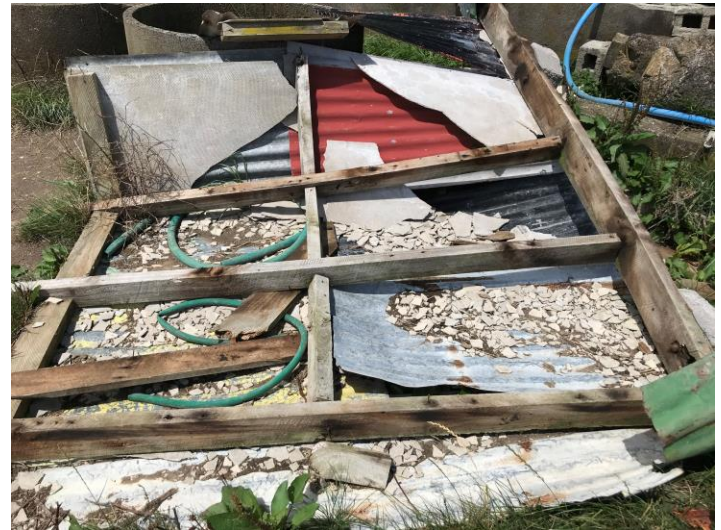
Broken PACM Sheeting outside Workshop (W2)