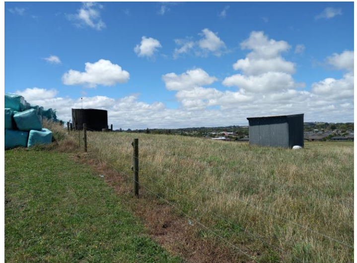
Storage Shed (SS2) & Water Tank (WT2)