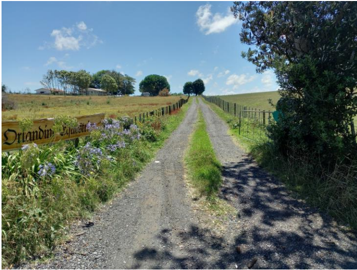
Site Entrance 130 Constable Road (S2)