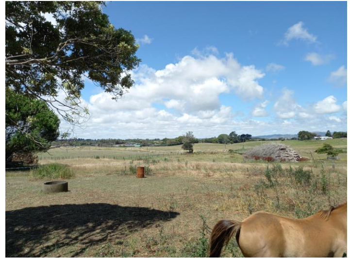
Southern Portion of 130 Constable Road