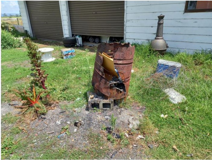
Area of Burning (AOB2)