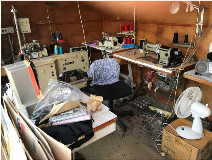
Interior of Workshop (W1)