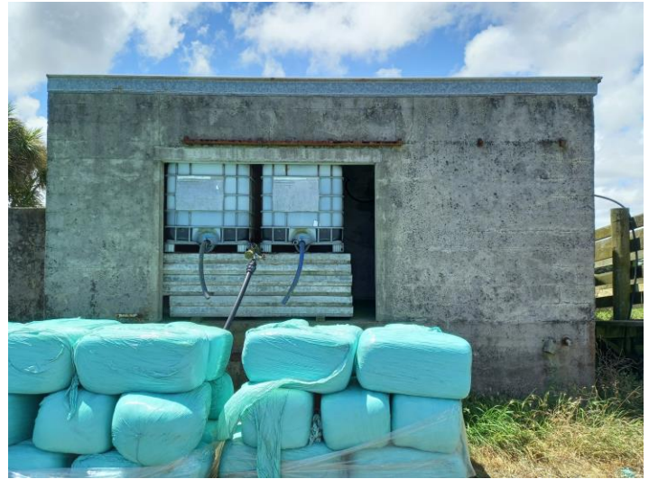
Water Tanks (WT1)