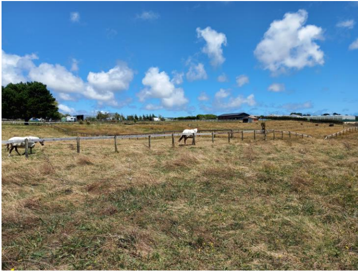
Central Portion of 130 Constable Road