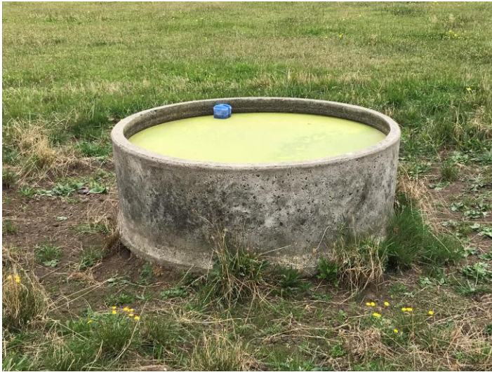
Example of Concrete Water Troughs