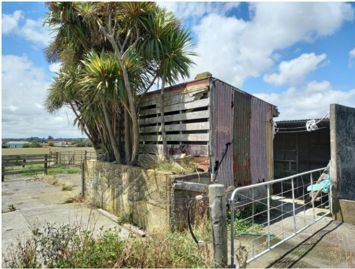
Water Tank Shed