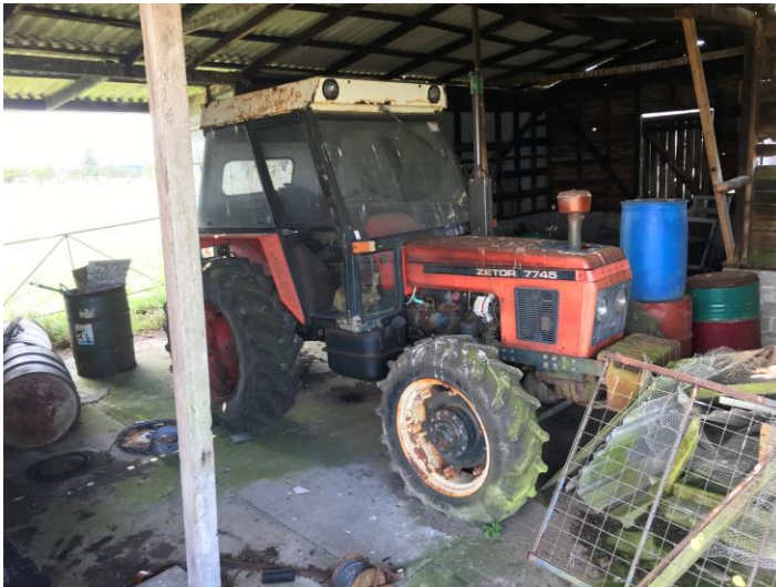
Interior of Workshop (W2)