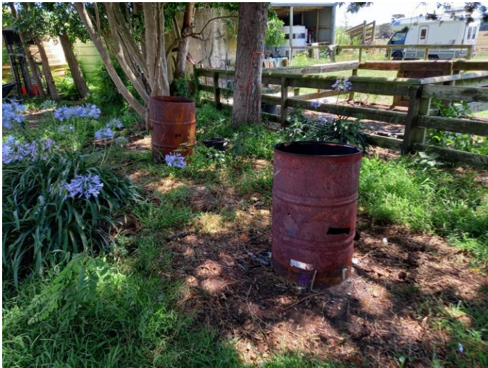
Area of Burning (AOB4)