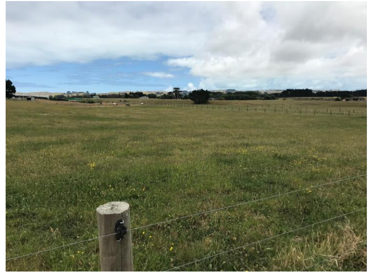
Central Portion of 92 Constable Road