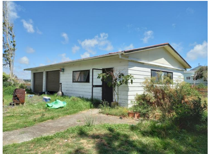
Storage Shed (SS2)