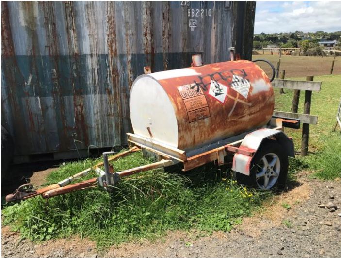
Diesel Tank adjacent to Contractor Storage