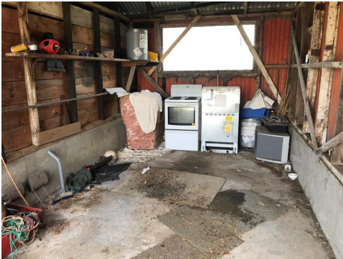
Interior of Laundry Shed