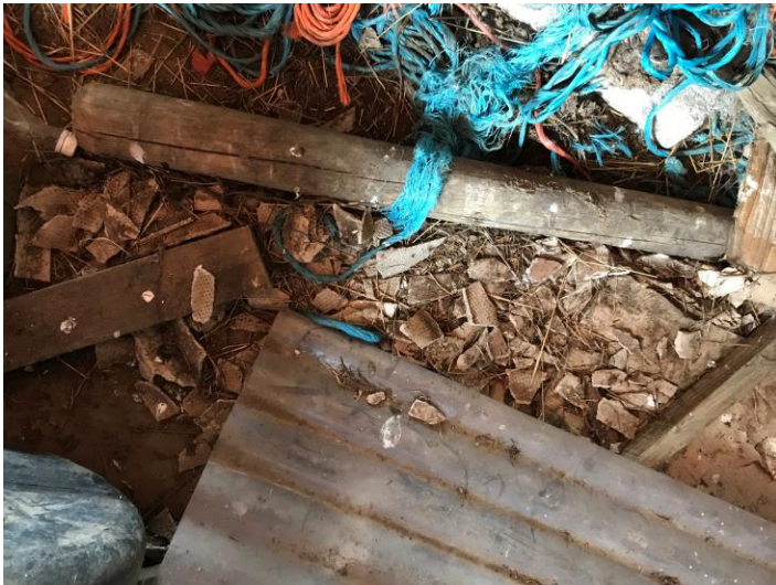
Broken PACM Sheeting