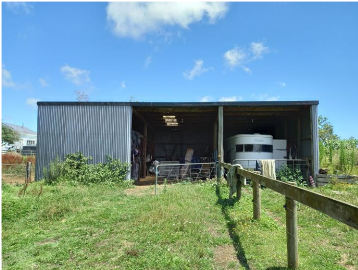
Horse Float and Equestrian Shed