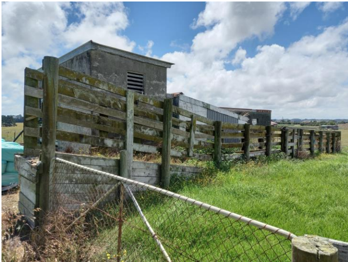
Stock Loading Ramp (SLR1)