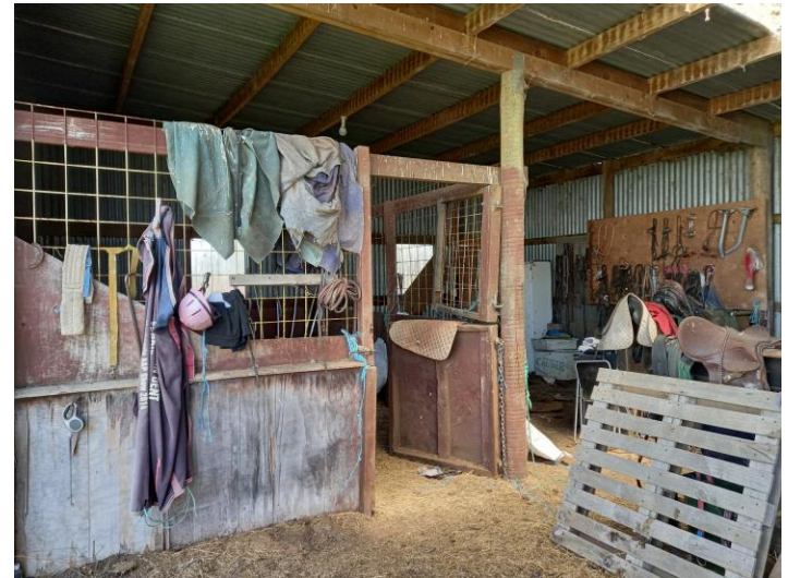
Interior of Equestrian Shed