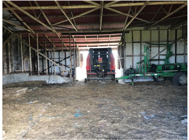
Interior of Implement Shed