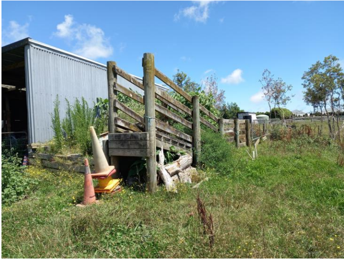
Stock Loading Ramp (SLR2)