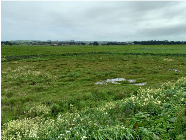
Southern Portion of 45a Constable Road