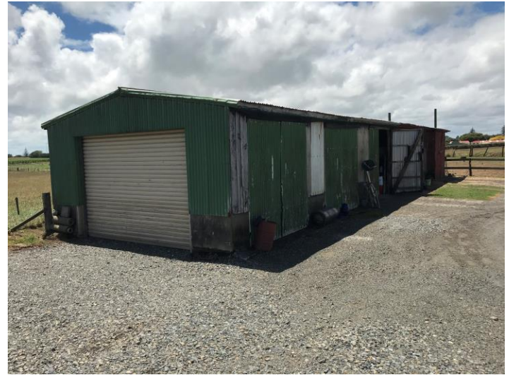
Storage Shed (SS1)