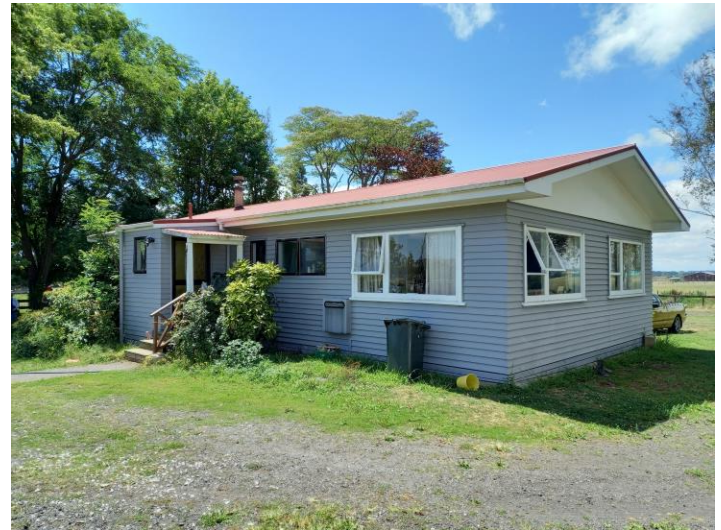
Residential Dwelling (RD2)