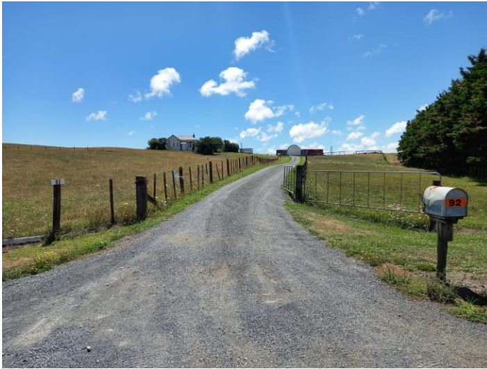
Site Entrance 92 Constable Road (S1)