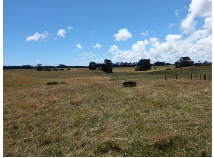
Northern Portion of 130 Constable Road