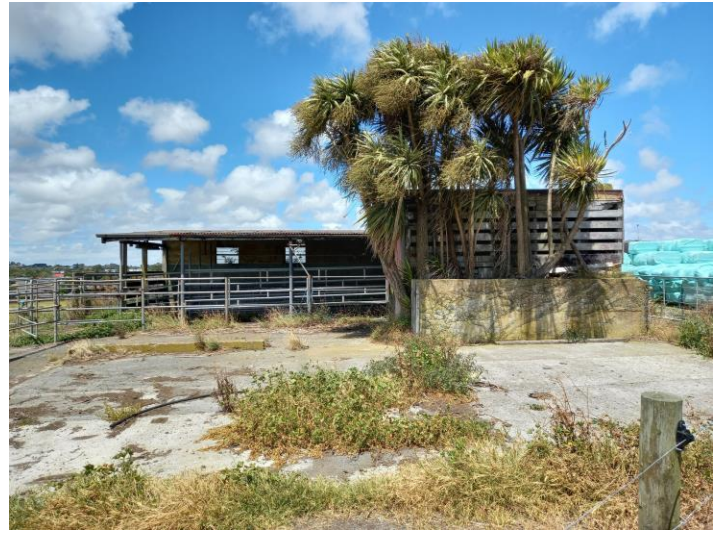
Historical Building Platform