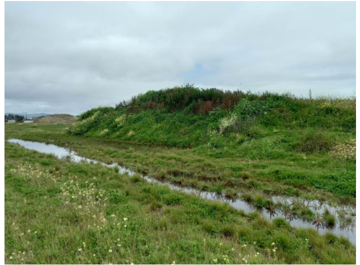
Stockpile on Site