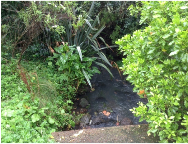
Native Riparian Vegetation