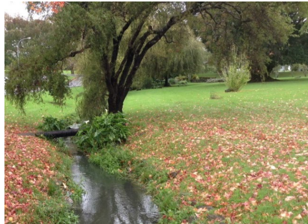
Notable and Protected Trees