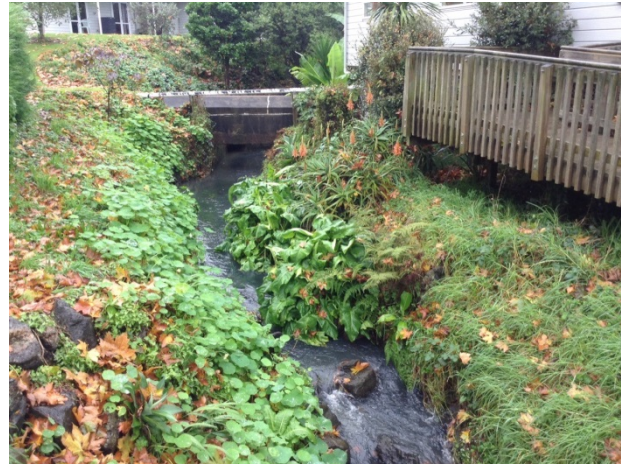
Exotic Riparian Vegetation