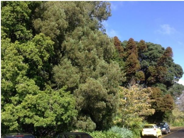
Mature Mixed Canopy