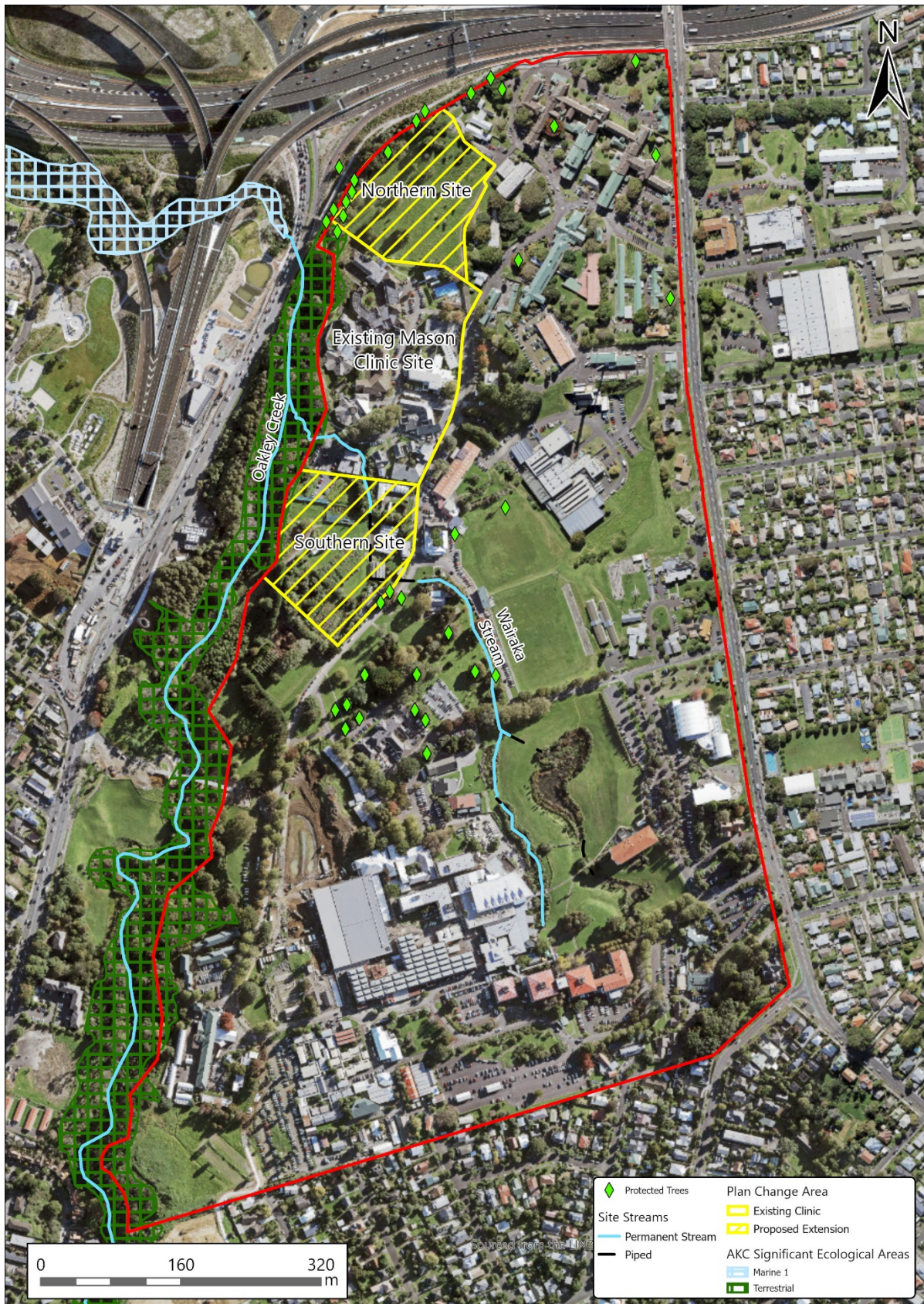
Figure 1: Plan Change Area and SEA Overlay