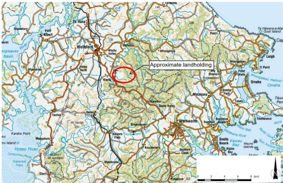
Figure 1: Location plan

1232 State Highway 1, Wayby Valley, between Wellsford and Warkworth, adjoining Dome Valley. Refer to Figure 1.