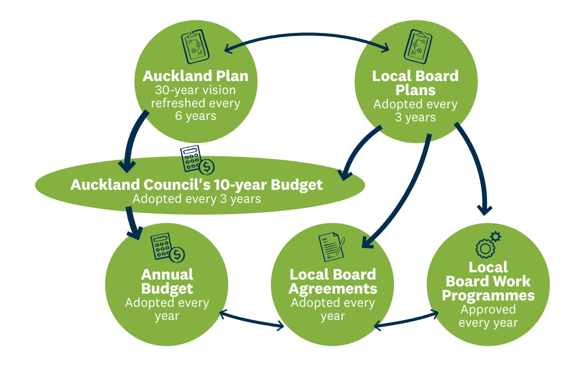
Diagram 1: The relationship between Auckland Council plans and agreements.

Local board agreements for 2021/2022 have been agreed between each local board and the Governing Body and are set out in Section 2.