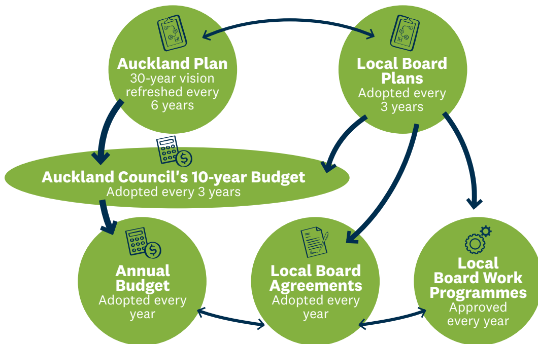
Diagram 1: The relationship between Auckland Council plans and agreements.

Local board agreements for 2021/2022 have been agreed between each local board and the Governing Body and are set out in Section 2.