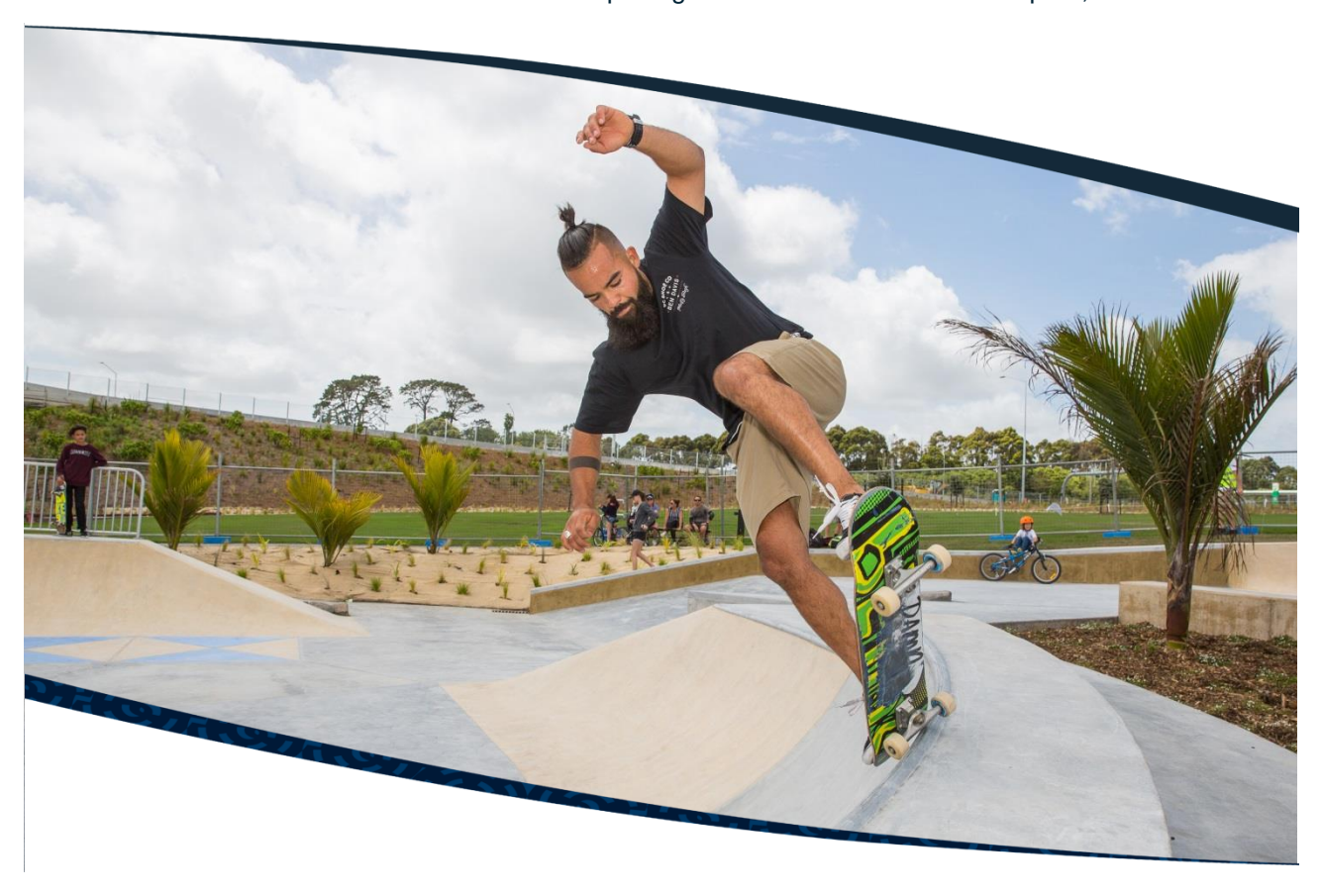
A skateboarder at the opening of Waterview Reserve skate park, November 2016