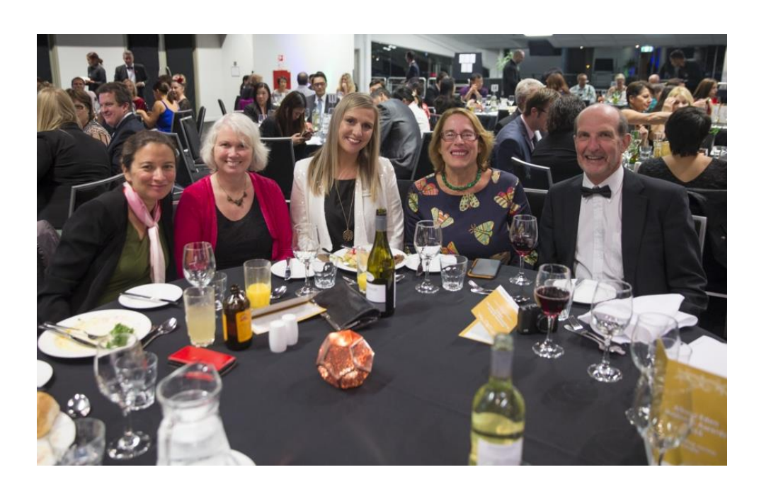
Albert-Eden Business Awards 2016