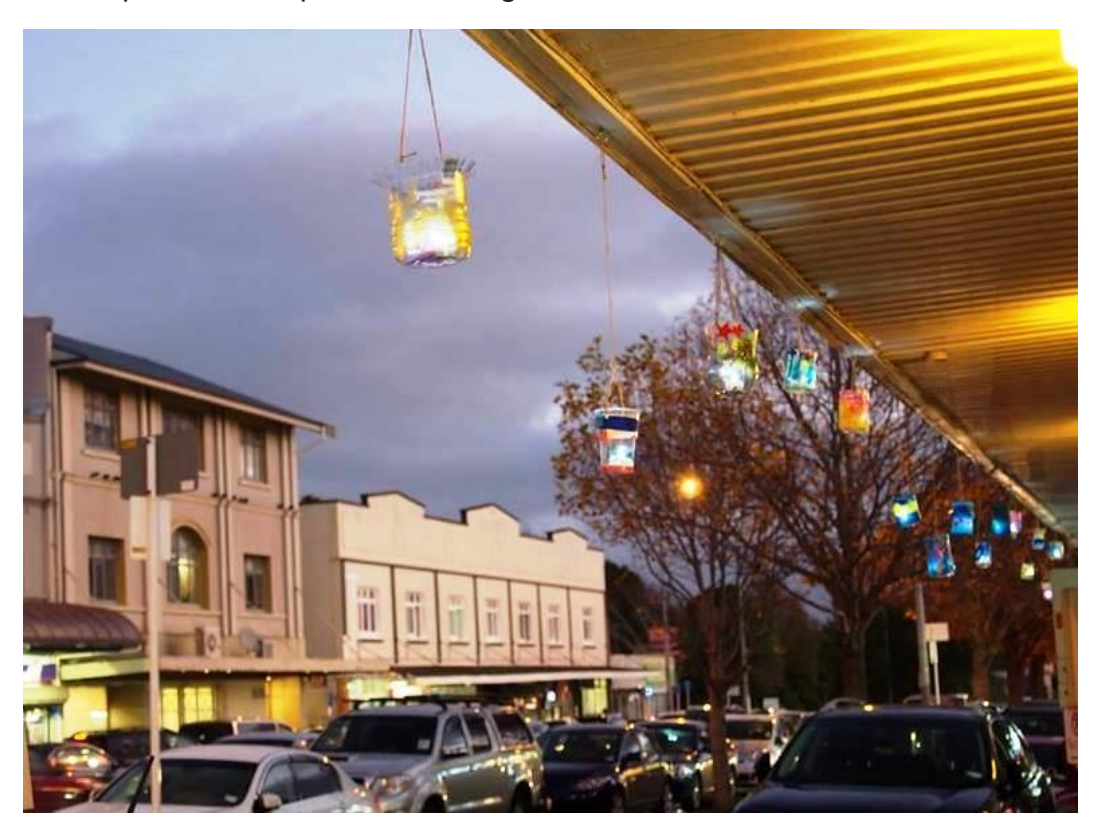
Lanterns in Mt Albert for Matariki 2016

Ensured all aspects (e.g. budget, design and public endorsement) of the of Mt. Albert town centre upgrade are ready for construction in late-September 2016. This project will revitalise the town centre, bring a refreshed sense of vibrancy to Mt. Albert, and also provide economic development opportunities and improved transportation linkages.