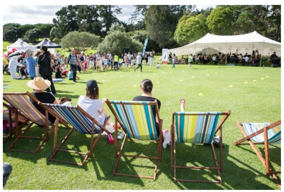
Easter at Chamberlain 2016