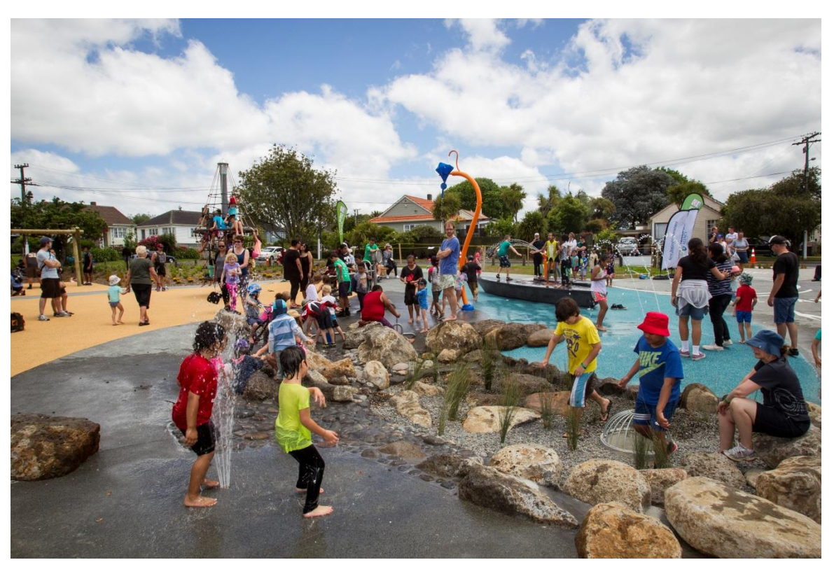
The upgraded playground at Waterview Reserve

The Board also recognise the value of encouraging active and healthy lifestyles through sport and recreation. We continue to upgrade our sports fields by installing the latest turf technology, and provide quality light and changing facilities.