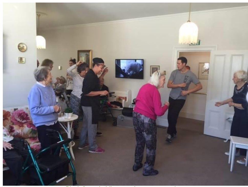
Black Grace holding a senior movement class