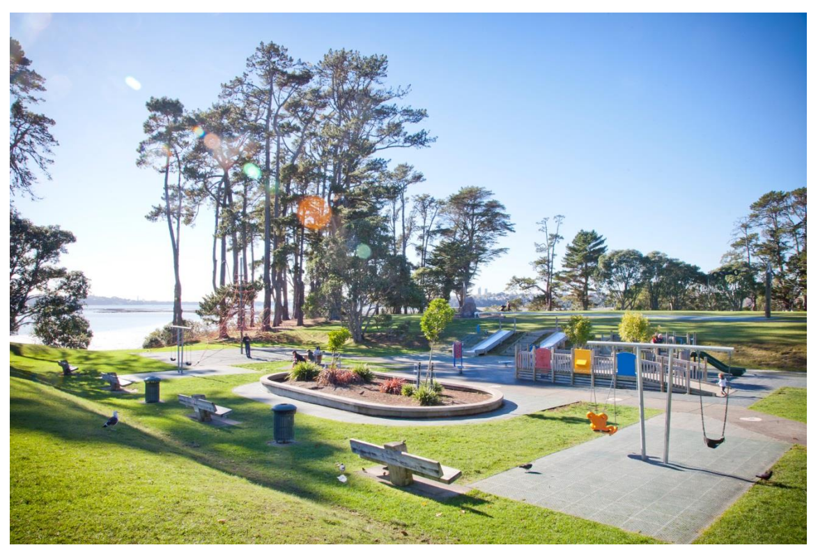
Coyle Park, Pt. Chevalier

Dog access rules were consulted on and reviewed for Eric Armishaw Park, Pt. Chevalier Beach, Coyle Park, Gribblehirst Park and Heron Park. The Board received and considered 336 submissions as a part of the review process, in order to ensure that the right balance of needs for dogs, their owners, non-dog owners and wildlife.