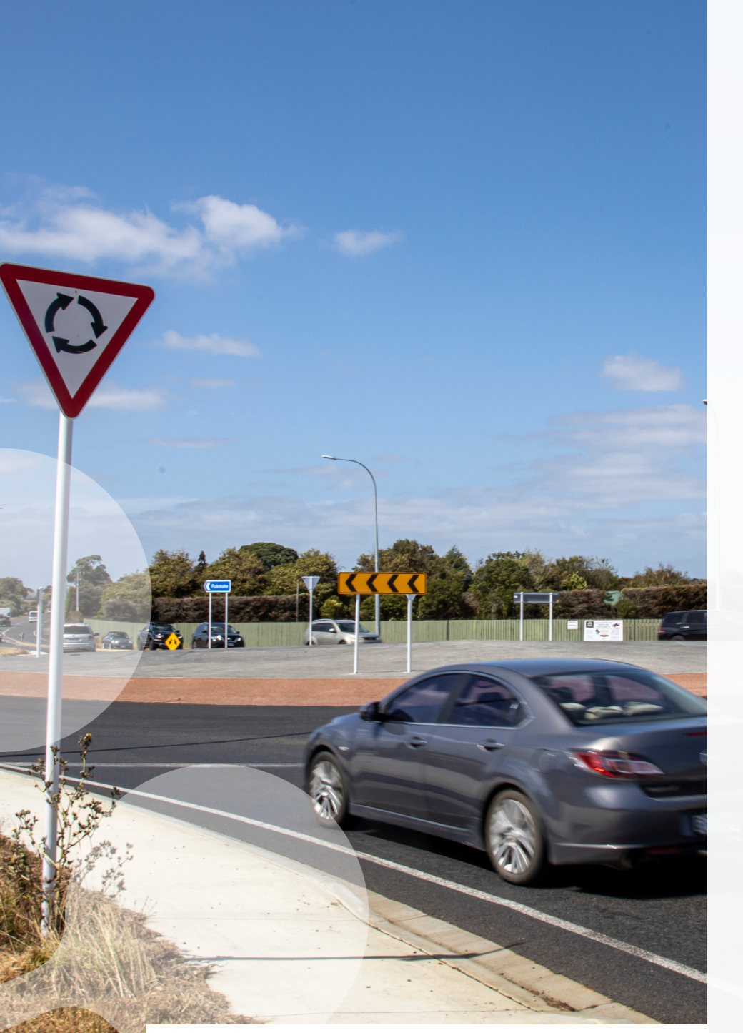
The Puni Roundabout has removed a notorious accident blackspot, creating safer driving conditions.

Whakaotinga rua: Ngā kōwhiringa ikiiki pai ake me ngā rori hāngai ki te kaupapa