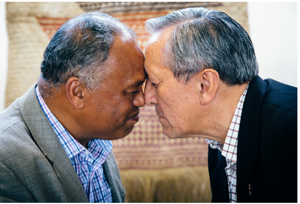
We are committed to our Treaty-based obligations and to Māori participation and development.

We have worked with Māori to develop initiatives that respond to Māori aspirations.