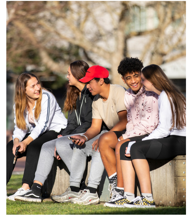
A group of young people get together in Pukekohe's Town Square.