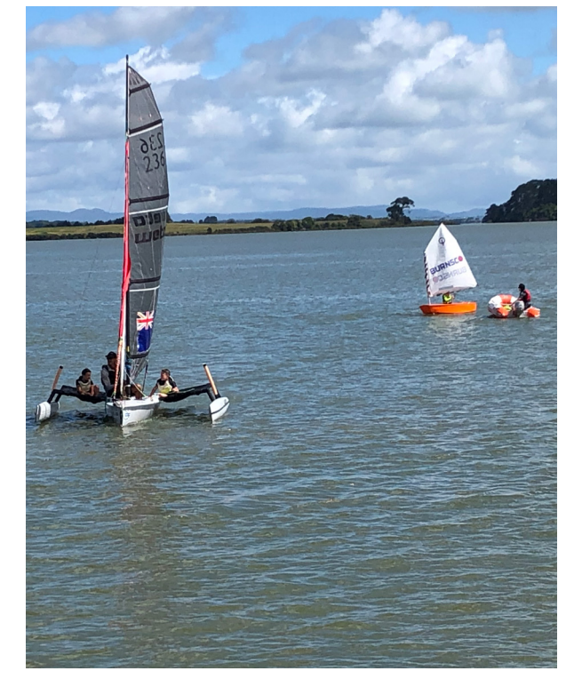
Move over Team NZ, budding yachties can learn at Sandspit Reserve, Waiuku.