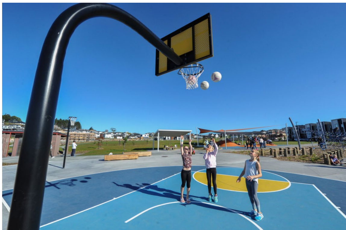
Children playing at Bonair basketball half court, Millwater.