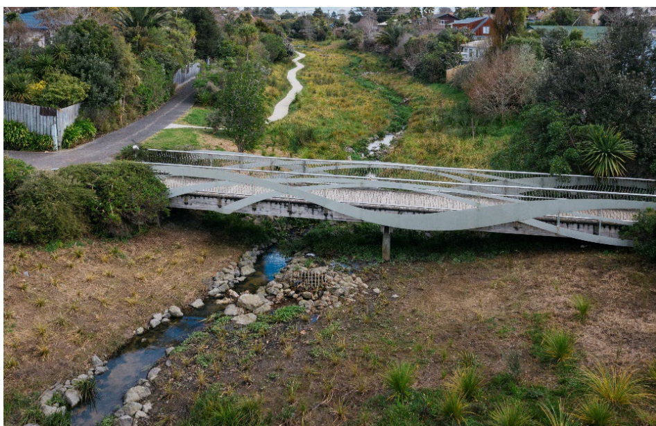
Daylighted/naturalised stormwater infrastructure - Whenua-roa / D'Oyly Reserve