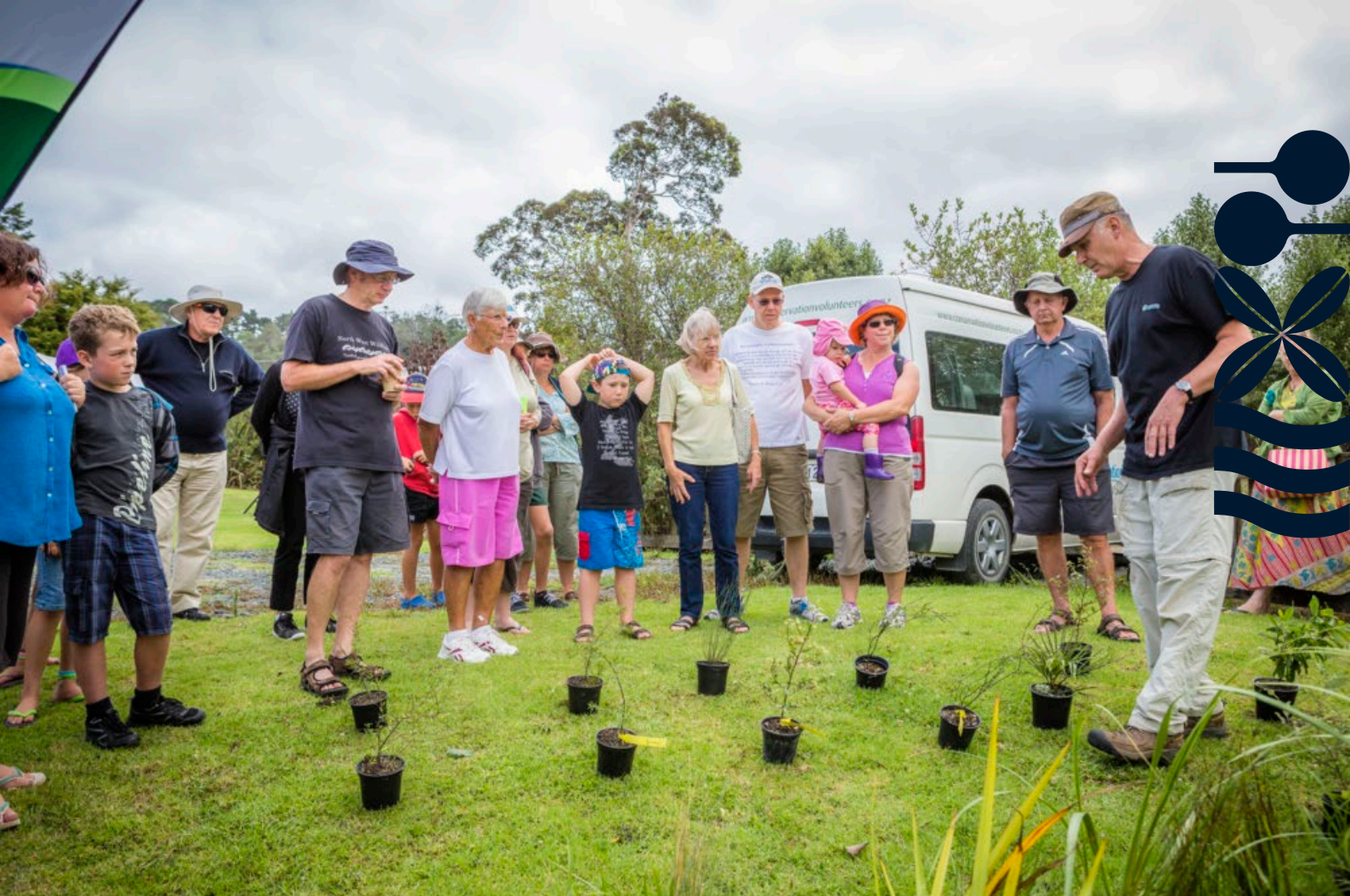
Planting day, Wade Landing Reserve.