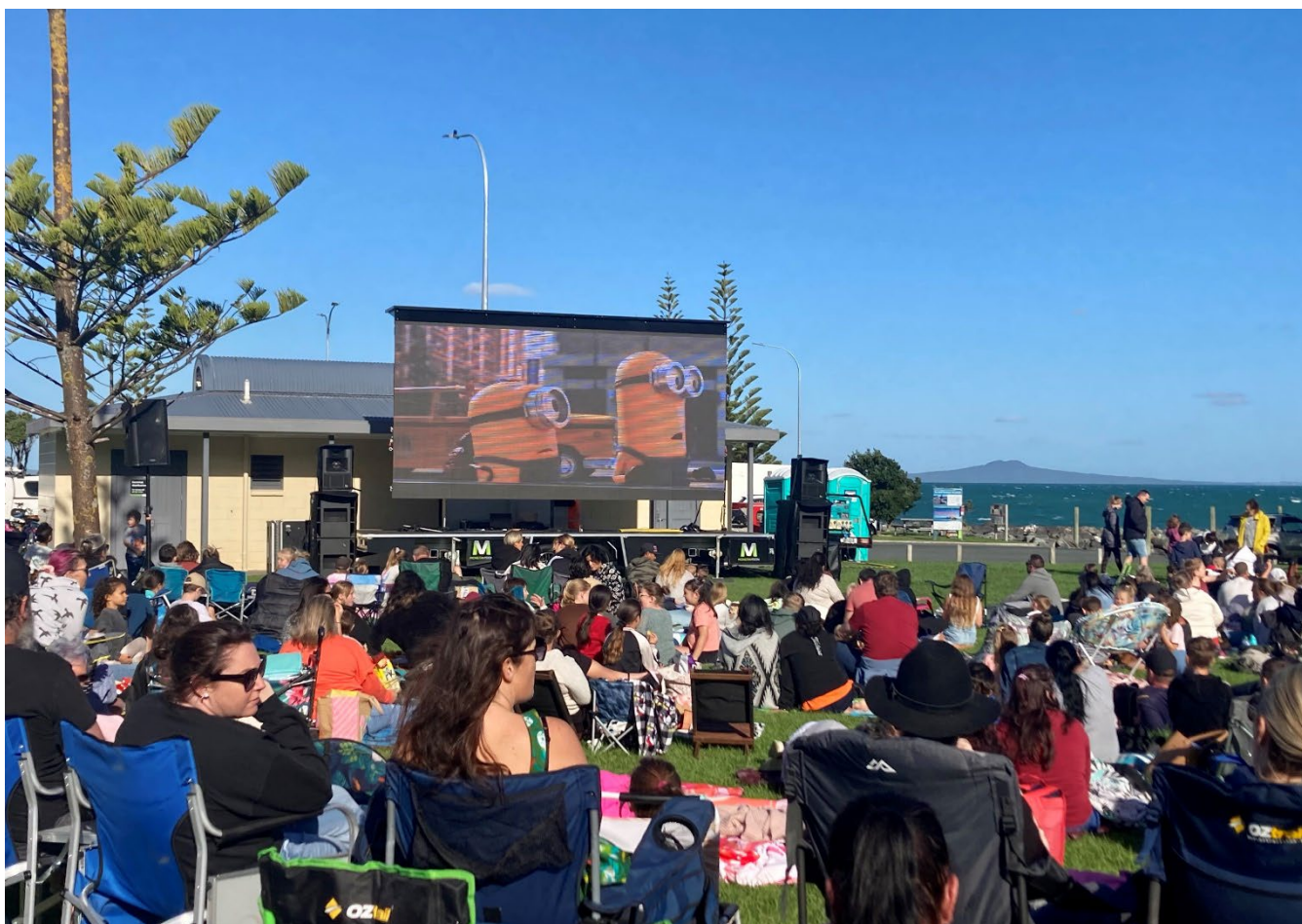
Destination Orewa Beach delivers a community movie, Gulf Harbour