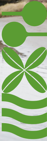
Improving stream and water quality by supporting projects like Īnanga (whitebait) spawning