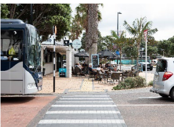
Hibiscus Coast Highway - Shared path, Ōrewa.

In a word, vibrant. Our past is remembered, and our facilities cater for future needs. Our open spaces can be used by all, and we have an abundance of recreation facilities.