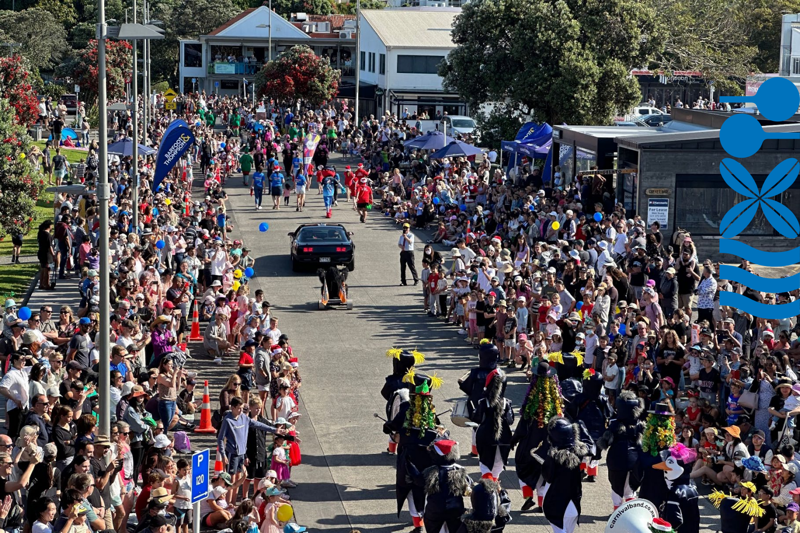
Browns Bay Business Association delivers Browns Bay Santa Parade, Beach Front Lane