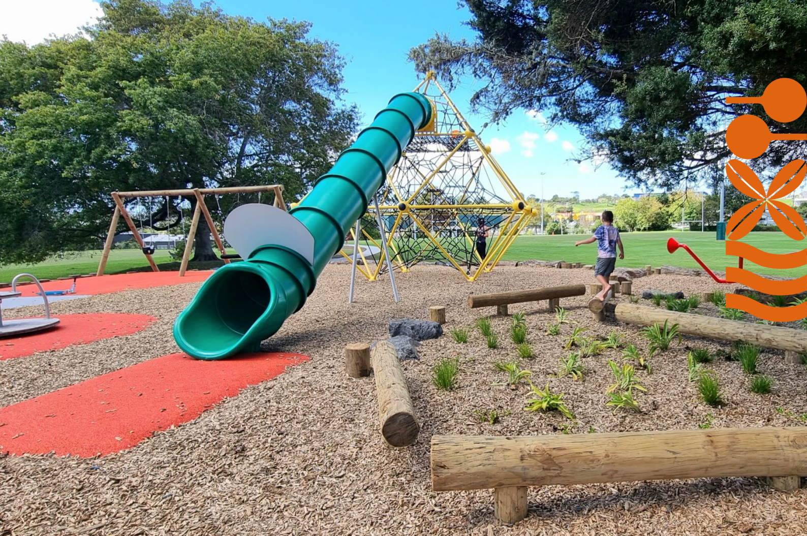
Silverdale War Memorial Park Playground renewal.