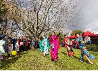
Browns Bay Chinese Society