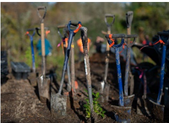
Volunteer planting day

The voices of our community are heard, our youth thrive, and everyone feels welcome. Our resilience networks enable us to be prepared for emergencies.