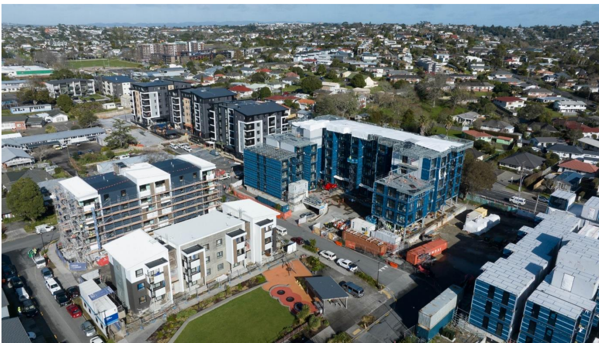
View from Tonar St towards Northcote Town Centre.