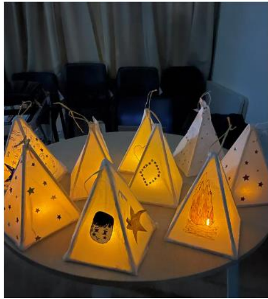
Lantern Hikoi through Te Ara Awataha