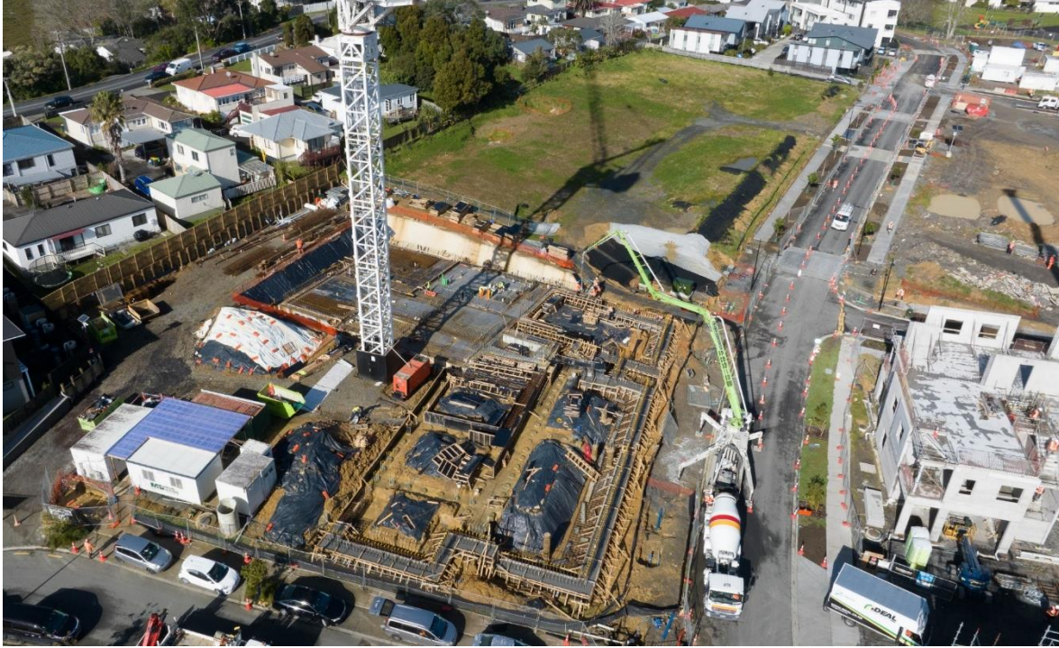
Construction progress of NC-34 - 56 state home apartments on the Corner of Cadness St & Huataki Rd.