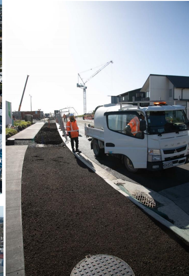
Cadness St - land development construction in the final stages.