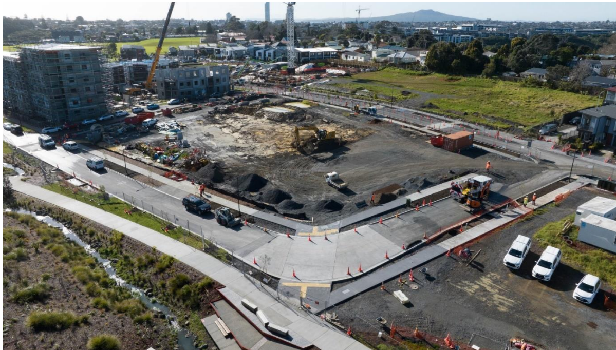
Stage 5 - land development construction in the final stages.