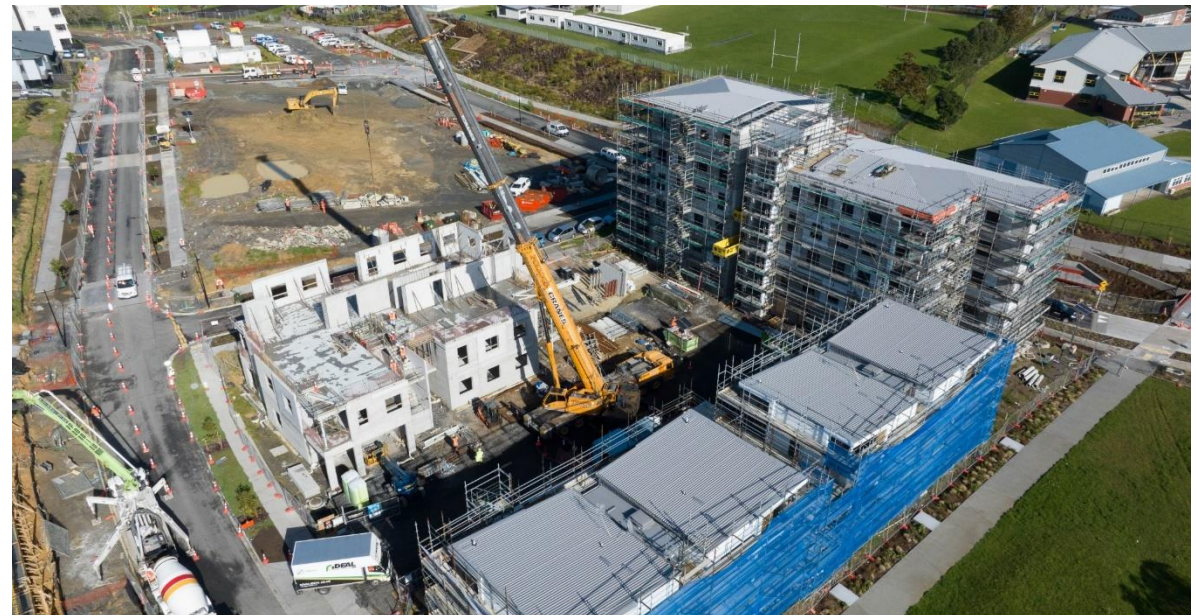
Construction progress of NC-30 – 55 state home apartments on Cadness St.

Below is a render of the future view looking towards NC-30 from Cadness Loop Reserve.