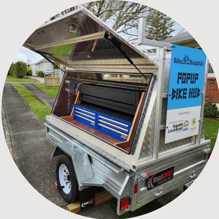
New bike maintenance trailer

Bike maintenance trailer has been built and almost ready to use at events