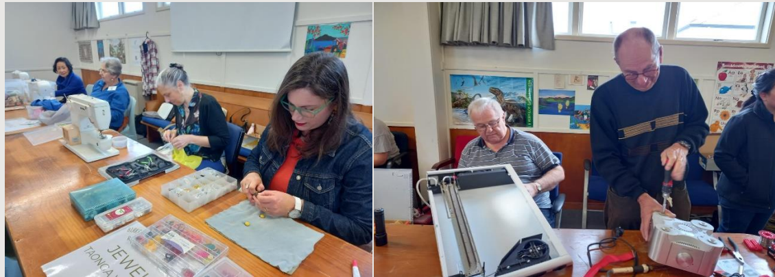
Birkenhead Repair Café, 9 September