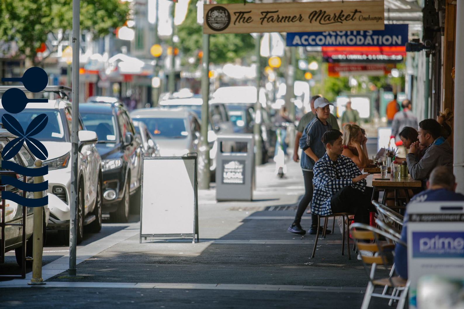
People out and about in Onewunga