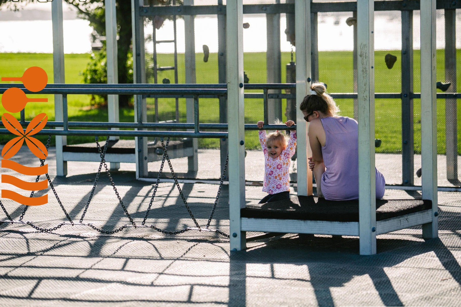
Pull-ups at Point England Reserve