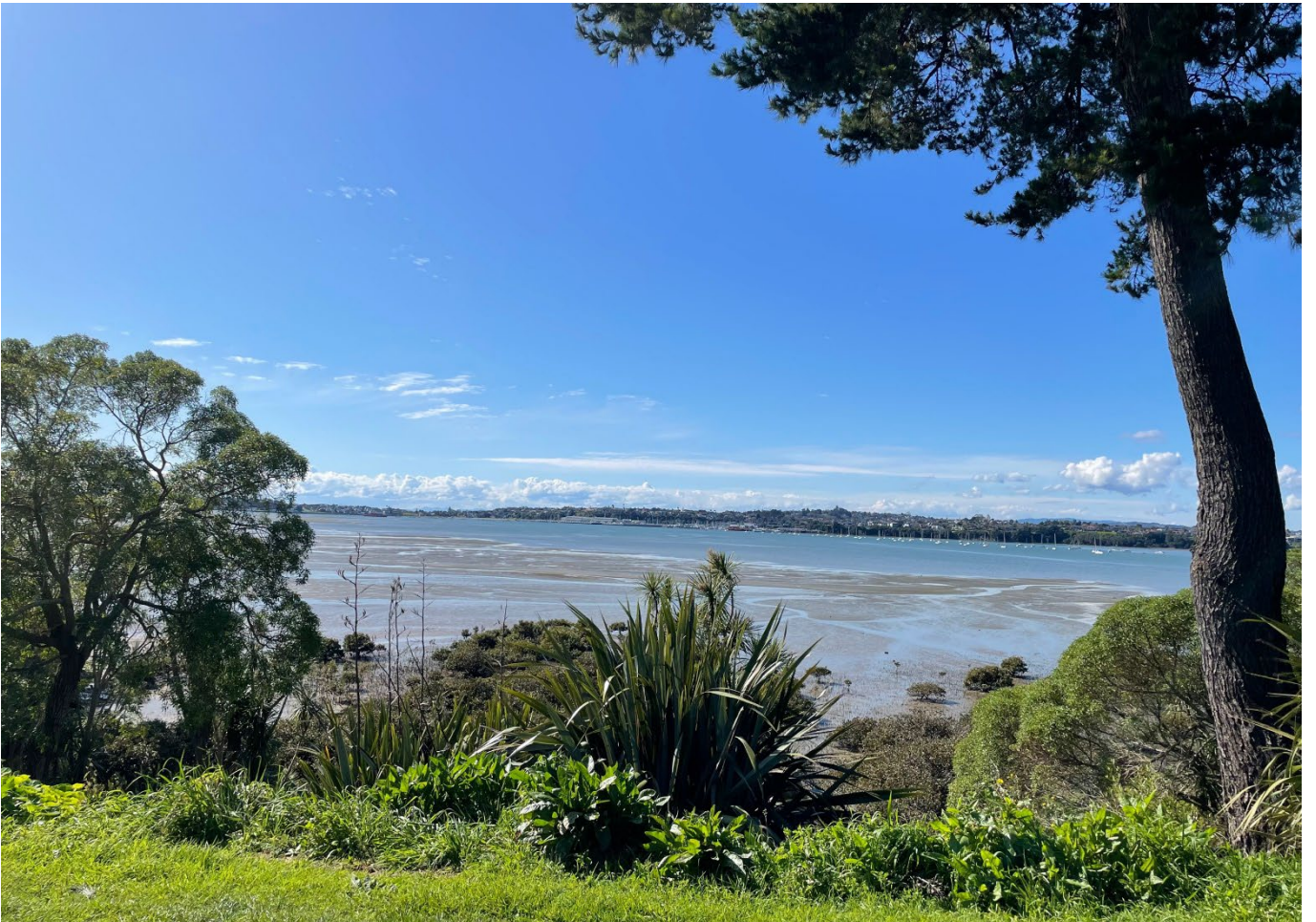
Wai o Taiki Bay