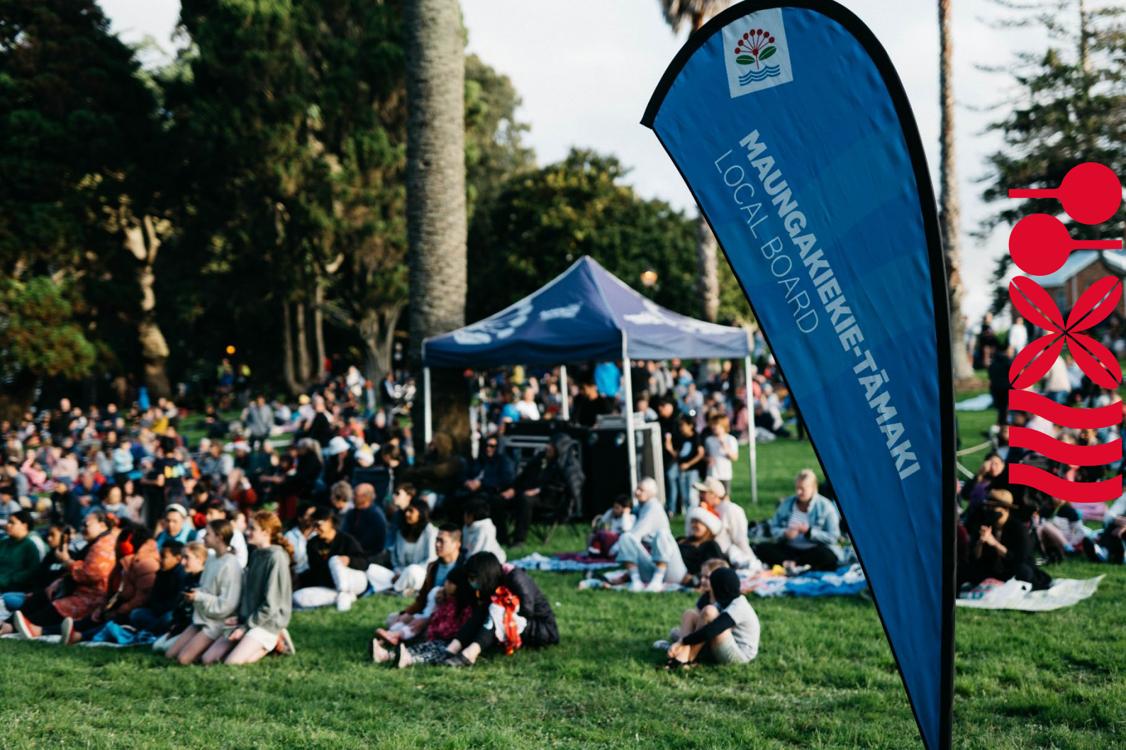
Onehunga Christmas Lights 2022, Jellicoe Park.