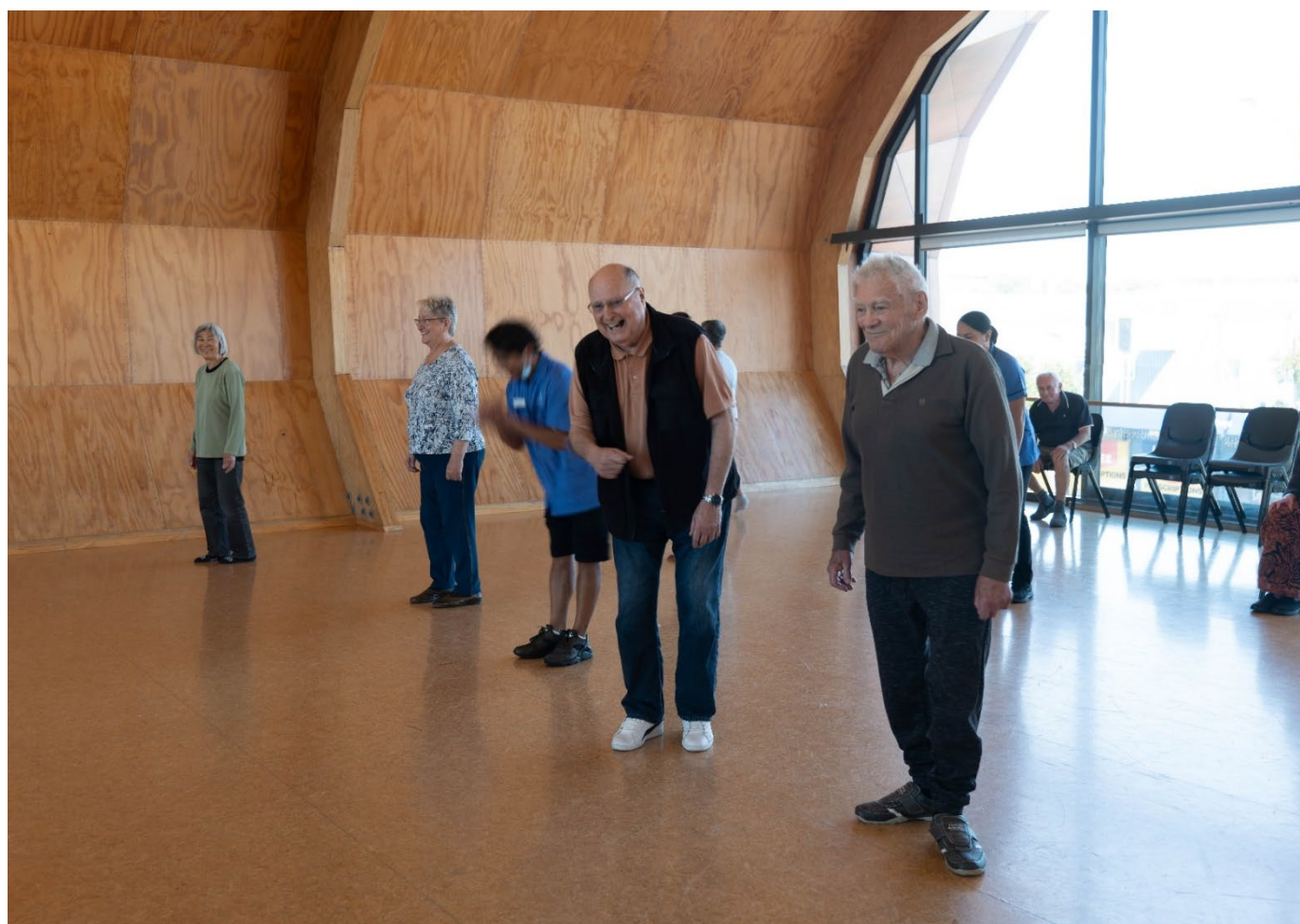
Te Oro seniors dance class