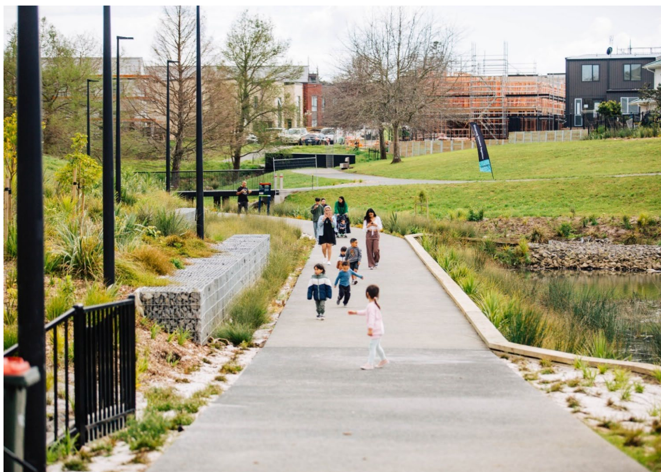
Children checking out Taniwha Reserve's upgrade