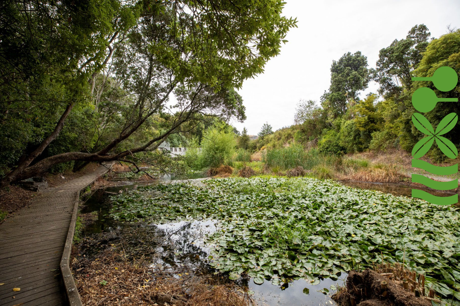
Van Damm's Lagoon in Mount Wellington