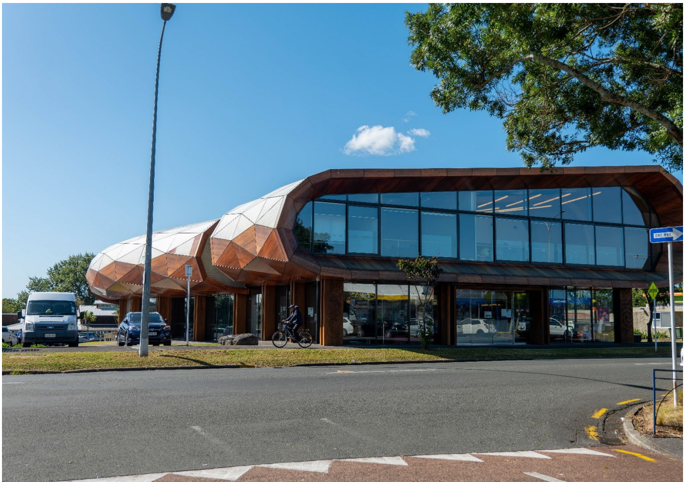
Te Oro music and arts centre, Glen Innes