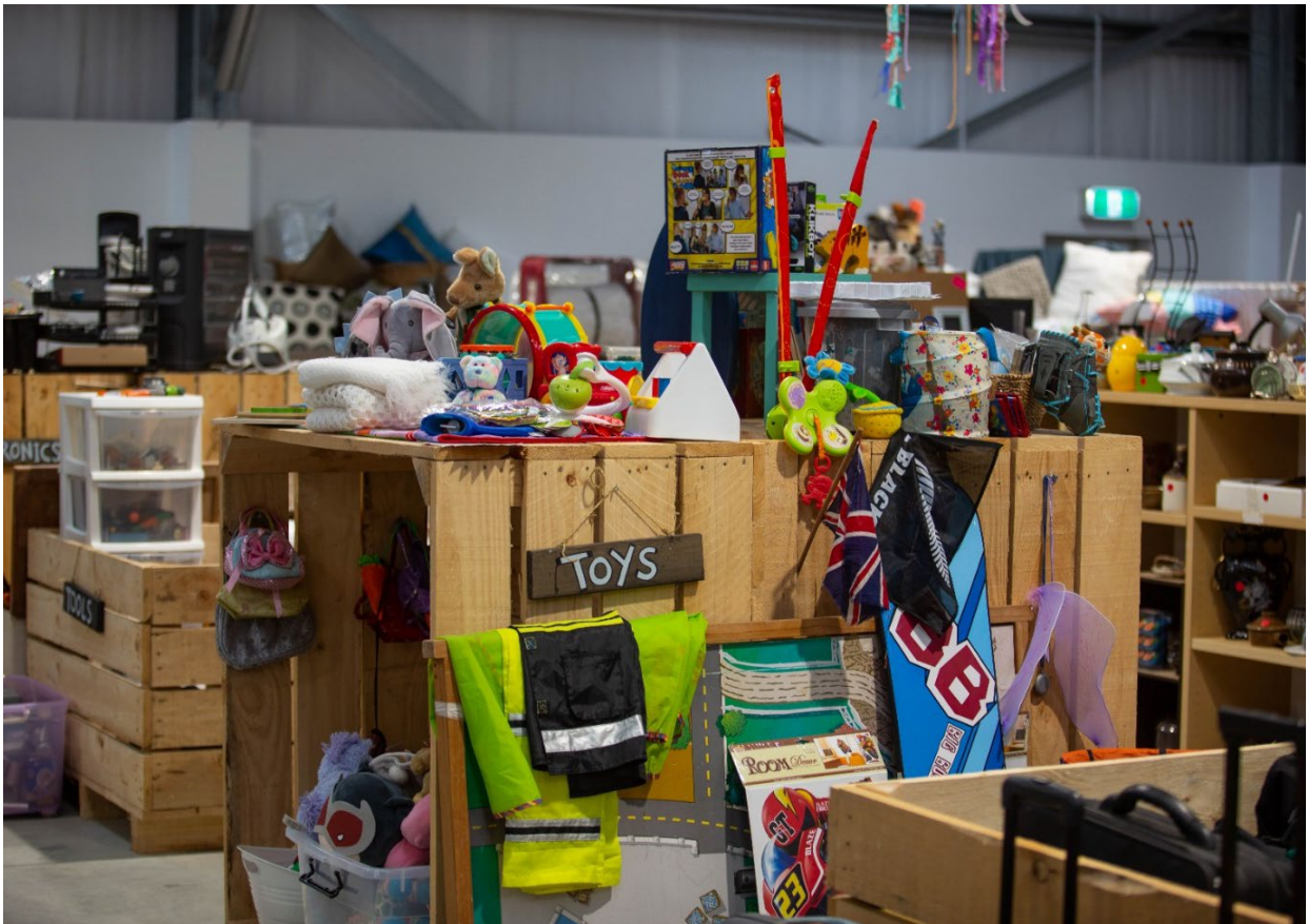
Another person's treasures at Onehunga Recycling Centre