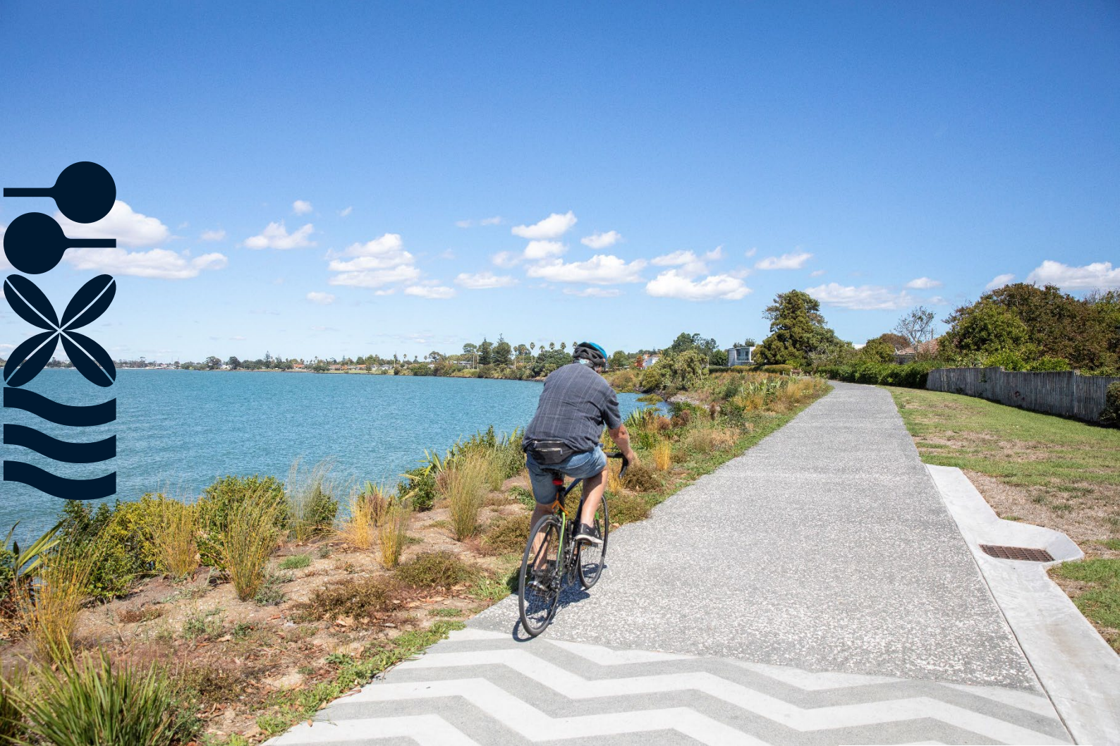
Cyclist on Tāmaki Shared Path