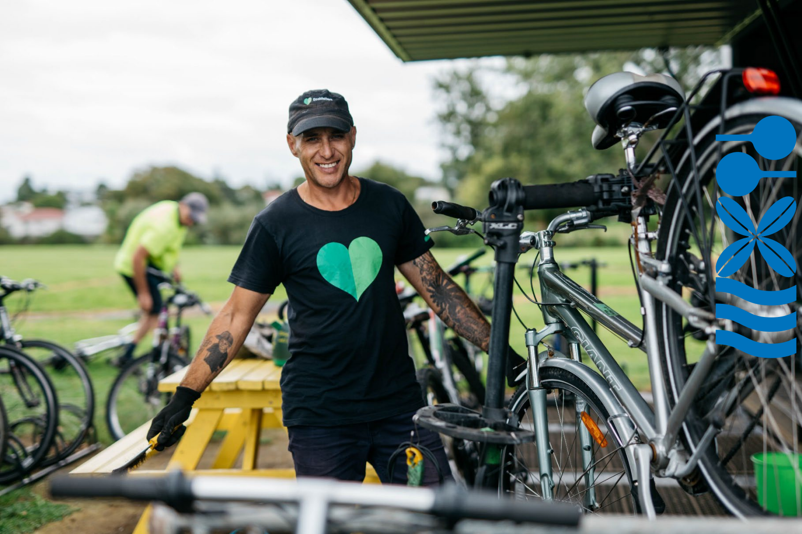
Bike expert at EcoMatters Bike Hub, Glen Innes