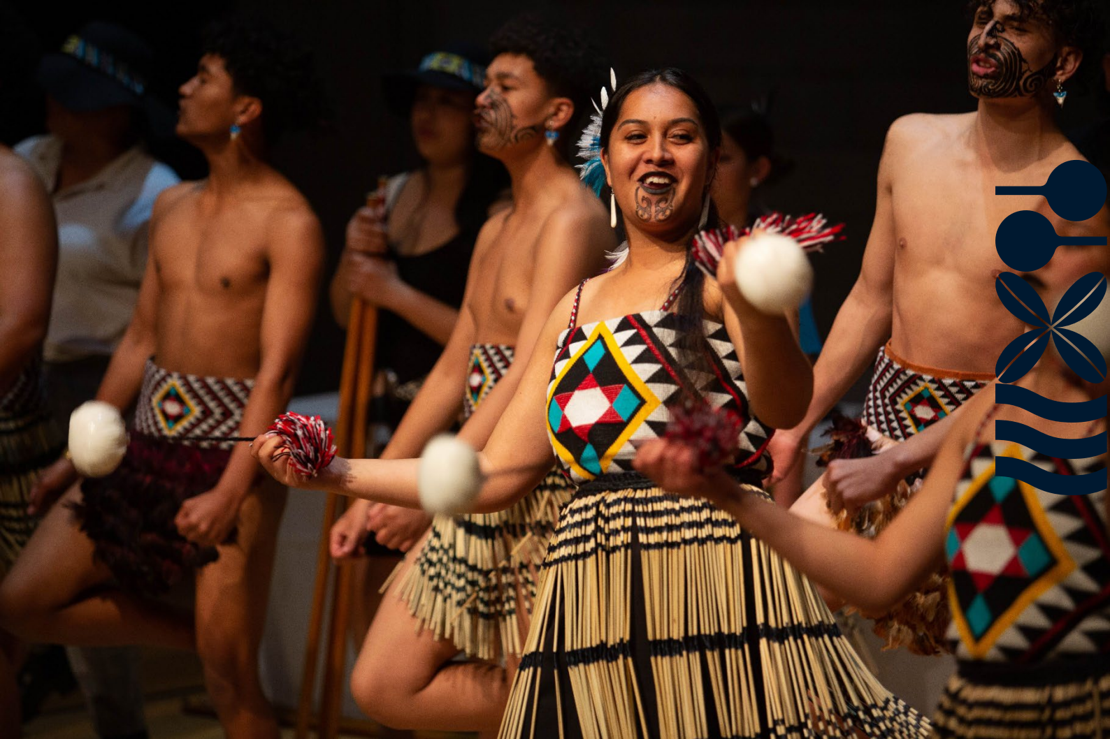
Te Kura Kaupapa Māori o Puau Te Moananui -a-Kiwa at Maungakiekie-Tāmaki Local Board inauguration ceremony November 2022.